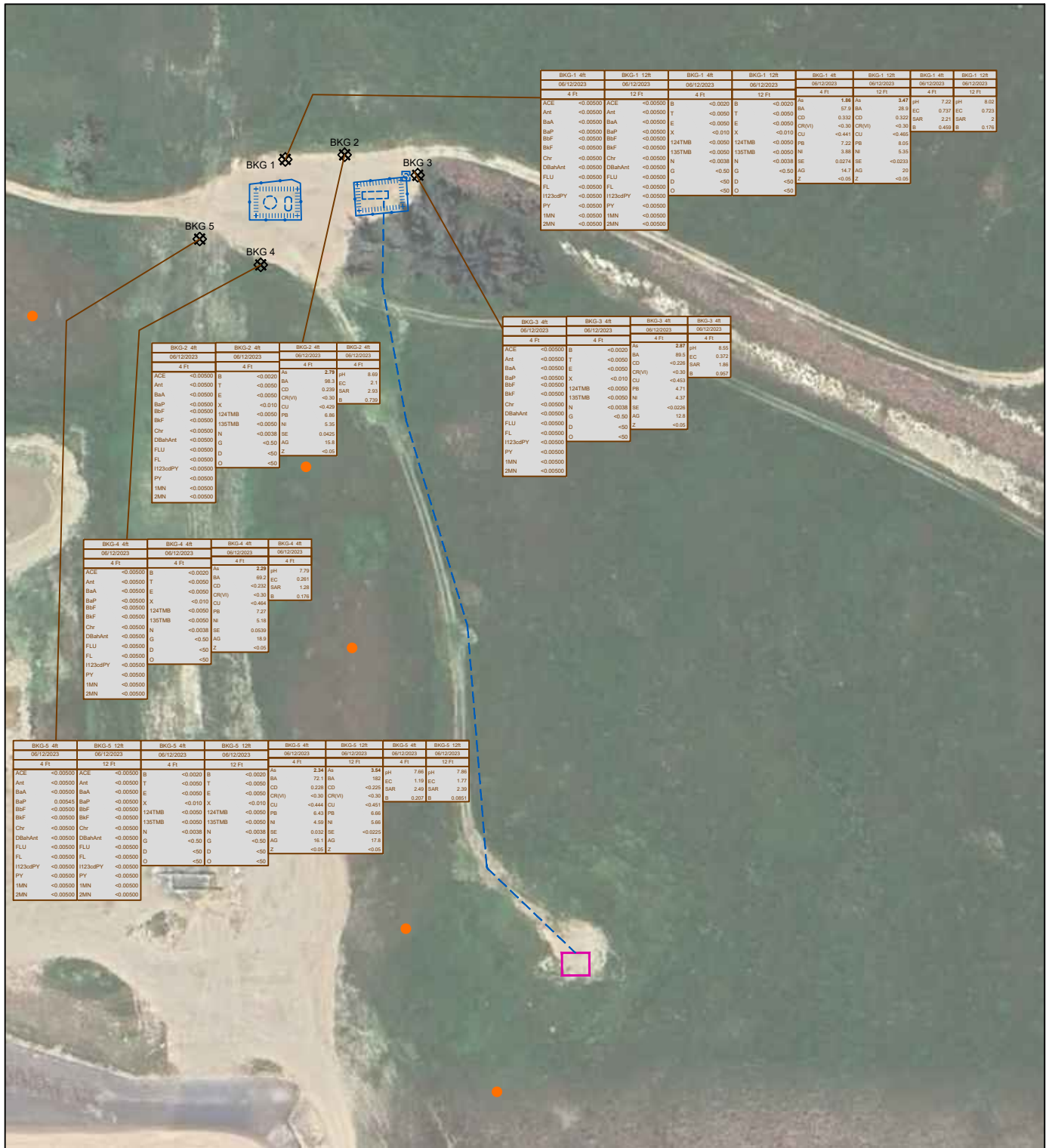
Figure 3 PROPOSED ADDITIONAL BACKGROUND SAMPLE LOCATIONS

Noble Energy, Inc. ~ Farr C 18-25 NESW Sec. 18, T4N, R64W, 6th PM Weld County, Colorado 40.308718° -104.597412°