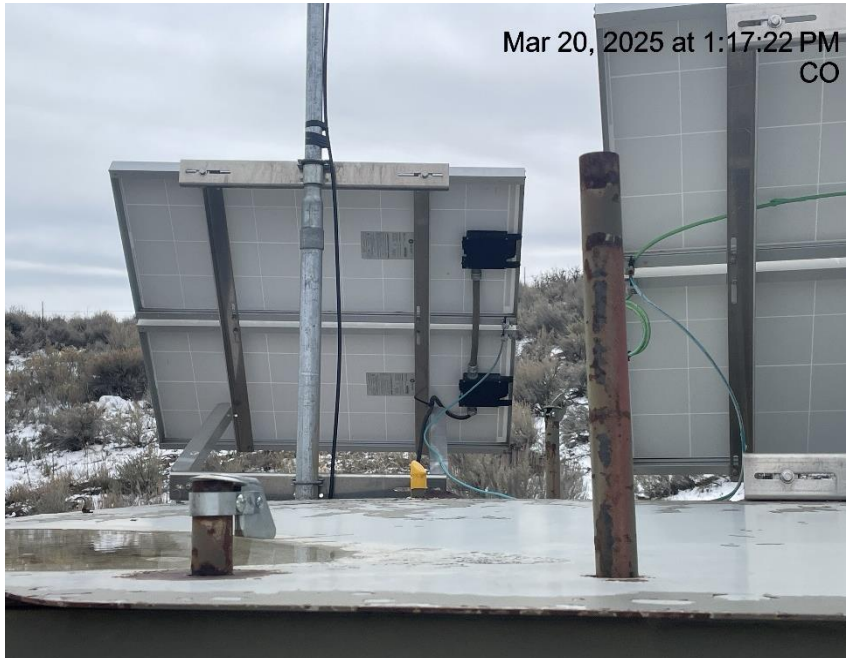
Photo # 5854 From inspection 708906068 conducted on 03/20/2025 PRV vent line does not comply with CECMC pressure safety device rules