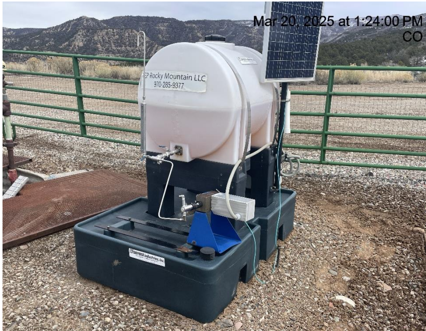
Photo # 5857 From inspection 708906068 conducted on 03/20/2025 Unused equipment