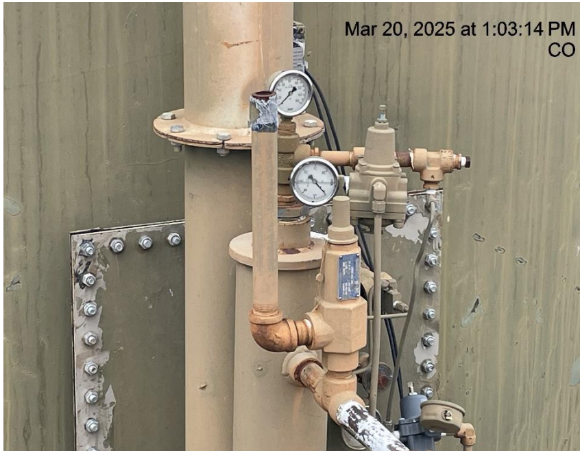
Photo # 5855 From inspection 708906068 conducted on 03/20/2025 PRV vent line does not comply with CECMC pressure safety device rules