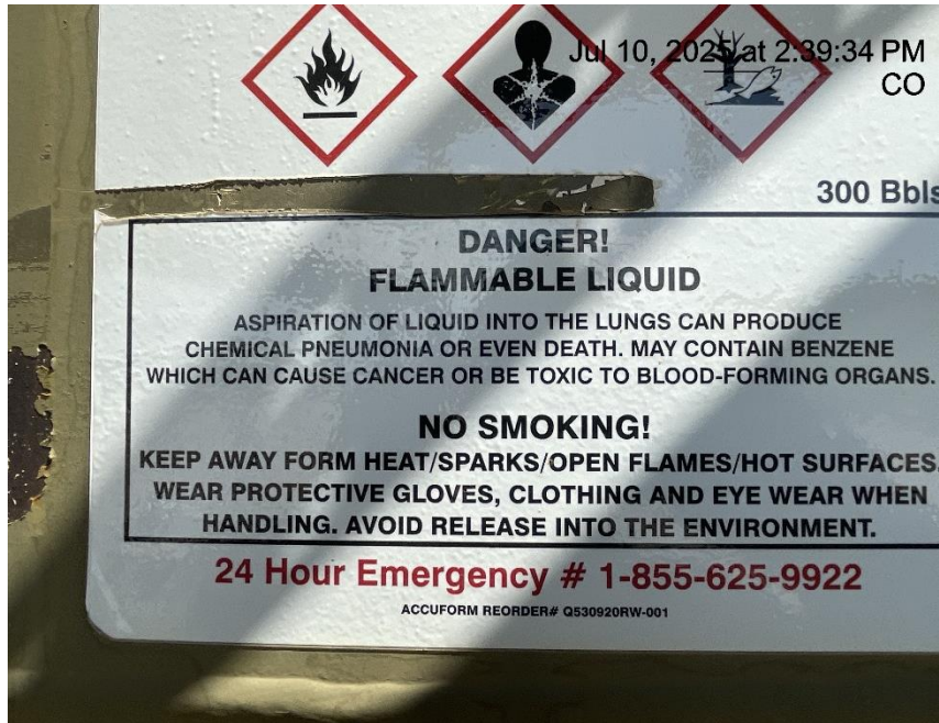
Photo # 1044 Emergency # on tank label disconnected/not in service