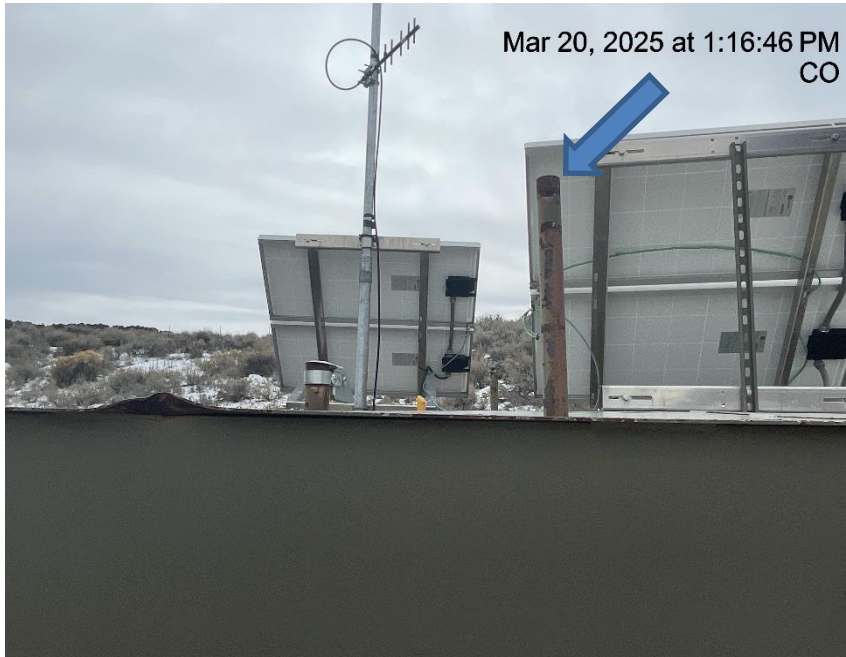
Photo # 5853 From inspection 708906068 conducted on 03/20/2025 PRV vent line does not comply with CECMC pressure safety device rules