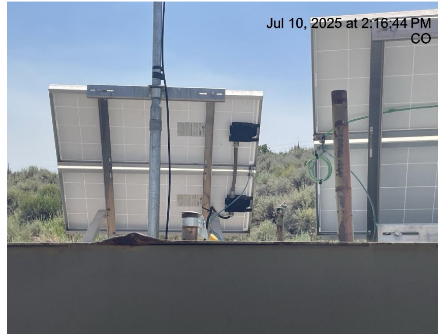
Photo # 1037 PRV vent line does not comply with CECMC pressure safety device rules