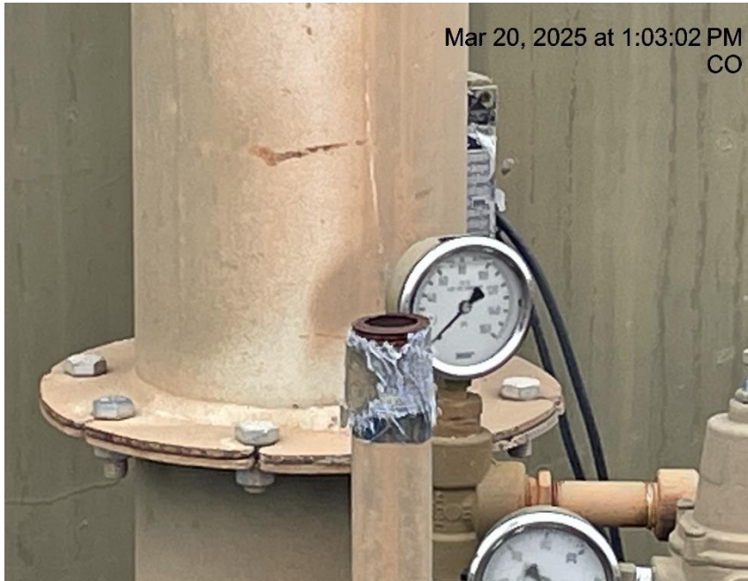
Photo # 5856 From inspection 708906068 conducted on 03/20/2025 PRV vent line does not comply with CECMC pressure safety device rules