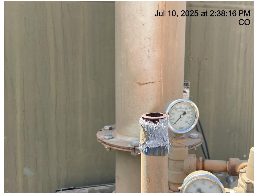
Photo # 1039 PRV vent line does not comply with CECMC pressure safety device rules