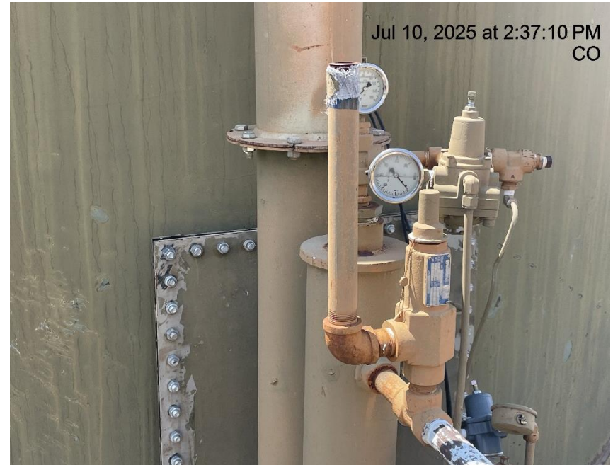
Photo # 1038 PRV vent line does not comply with CECMC pressure safety device rules

Photo # 5855 From inspection 708906068 conducted on 03/20/2025 PRV vent line does not comply with CECMC pressure safety device rules