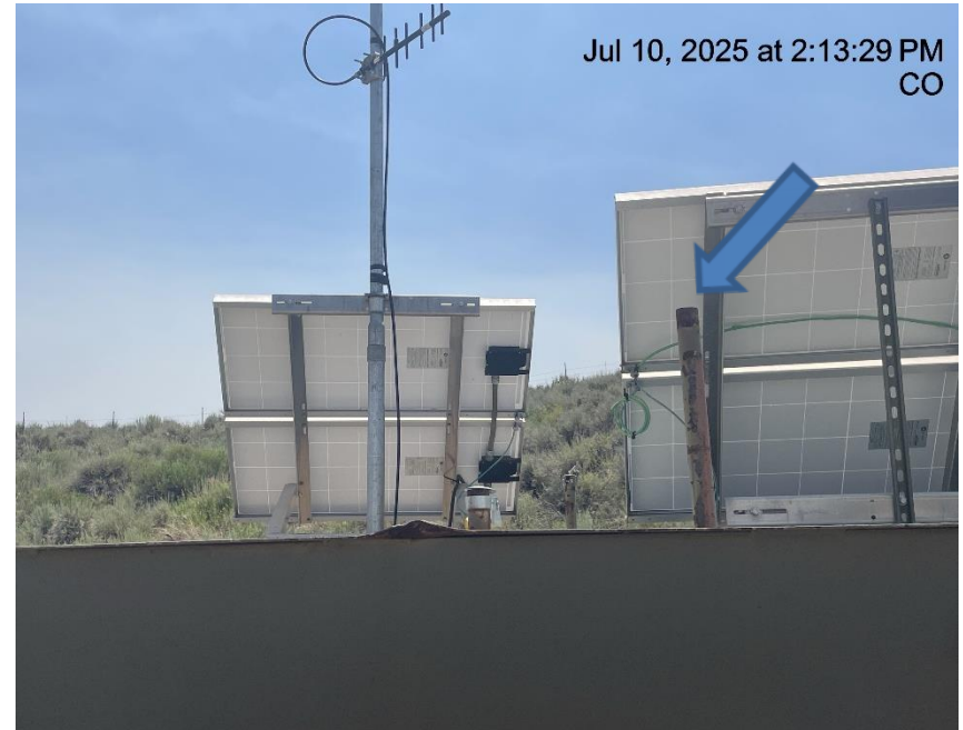
Photo # 1036 PRV vent line does not comply with CECMC pressure safety device rules