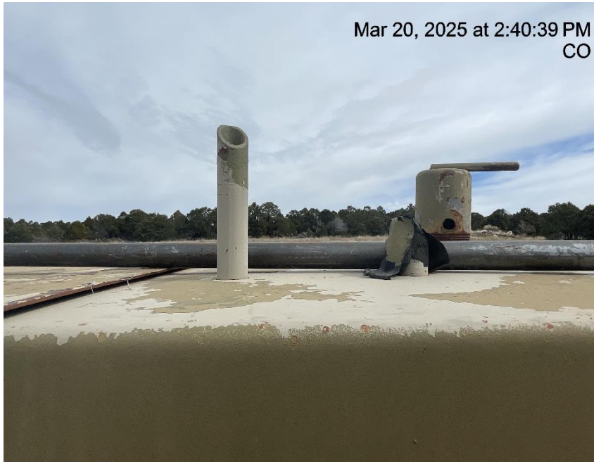
Photo # 6182 From inspection/audit 708906074 conducted on 03/20/2025 PRV vent line on separator does not comply with CECMC pressure safety device rules