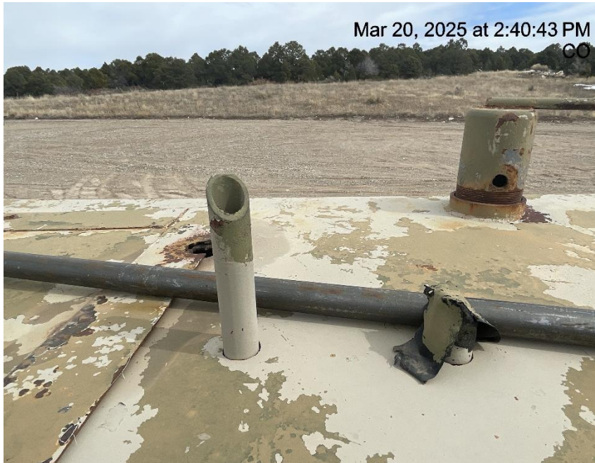
Photo # 6183 From inspection/audit 708906074 conducted on 03/20/2025 PRV vent line on separator does not comply with CECMC pressure safety device rules