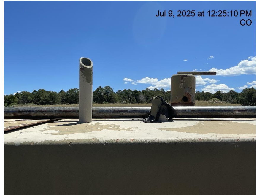
Photo # 293 PRV vent line on separator does not comply with CECMC pressure safety device rules