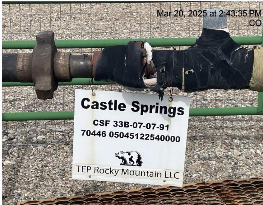
Photo # 6185 From inspection/audit 708906074 conducted on 03/20/2025 Wellhead sign lacks required information