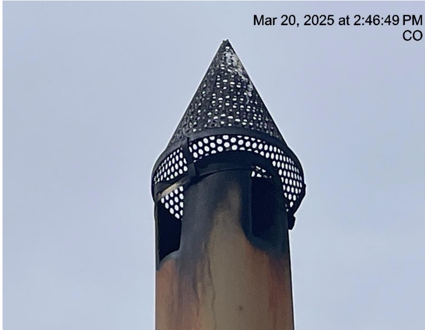
Photo # 6184 From inspection/audit 708906074 conducted on 03/20/2025 Bird protection on separator insufficient /burner stack available for entry by wildlife/wildlife hazard