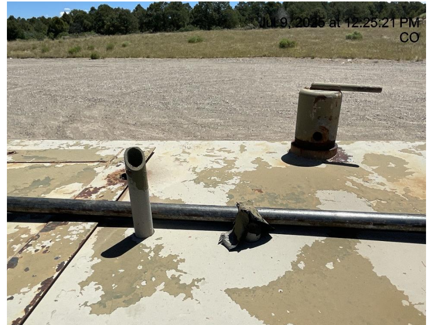
Photo # 294 PRV vent line on separator does not comply with CECMC pressure safety device rules