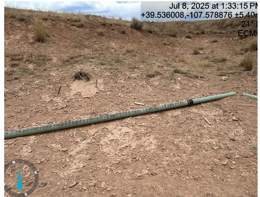
Cut slope erosion and stakes from waddles