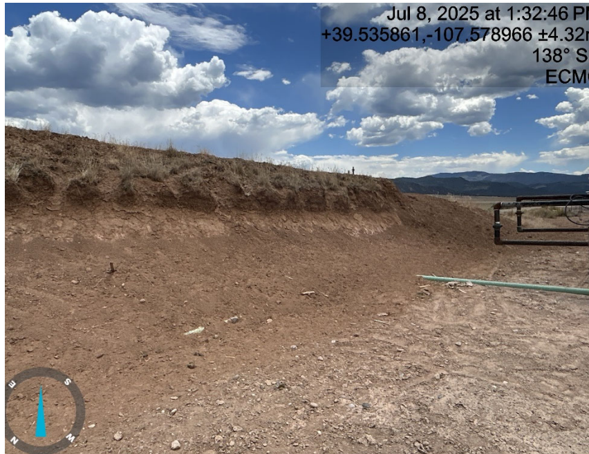
Cut slope erosion