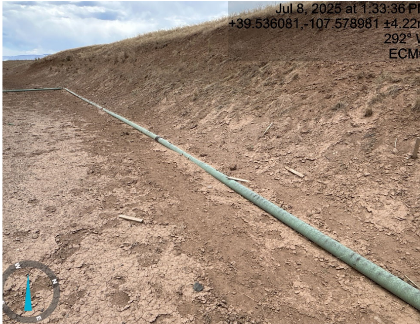
Cut slope erosion and stakes from waddles