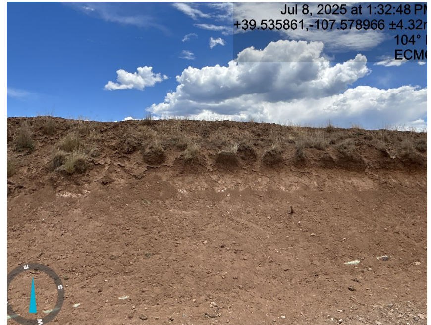
Cut slope erosion