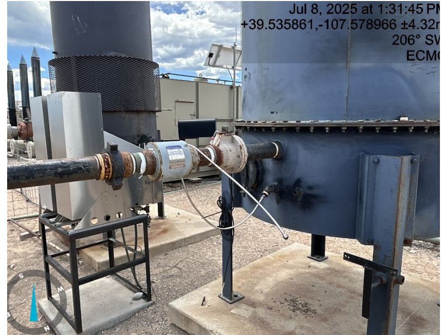
Locked out ECD