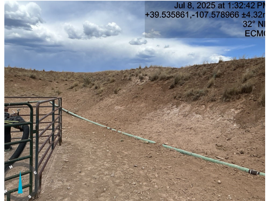
Cut slope erosion