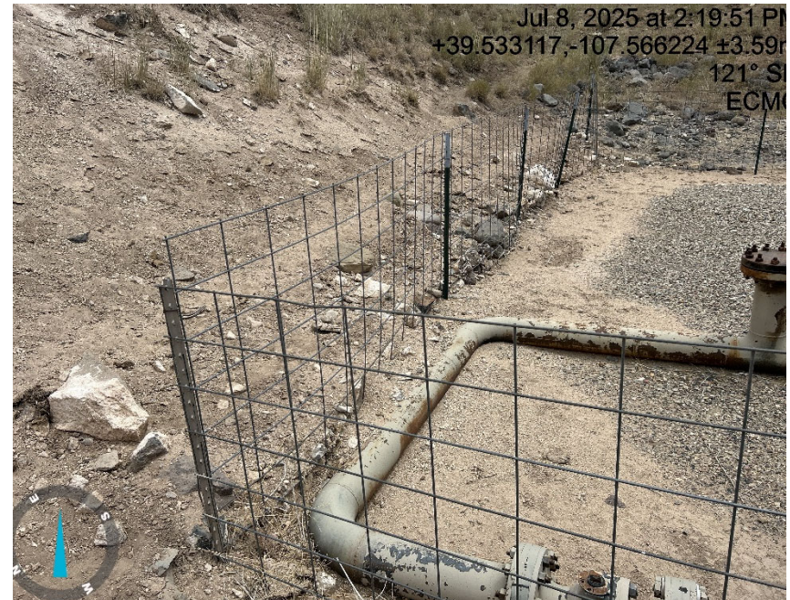
Sediment from cut slope erosion