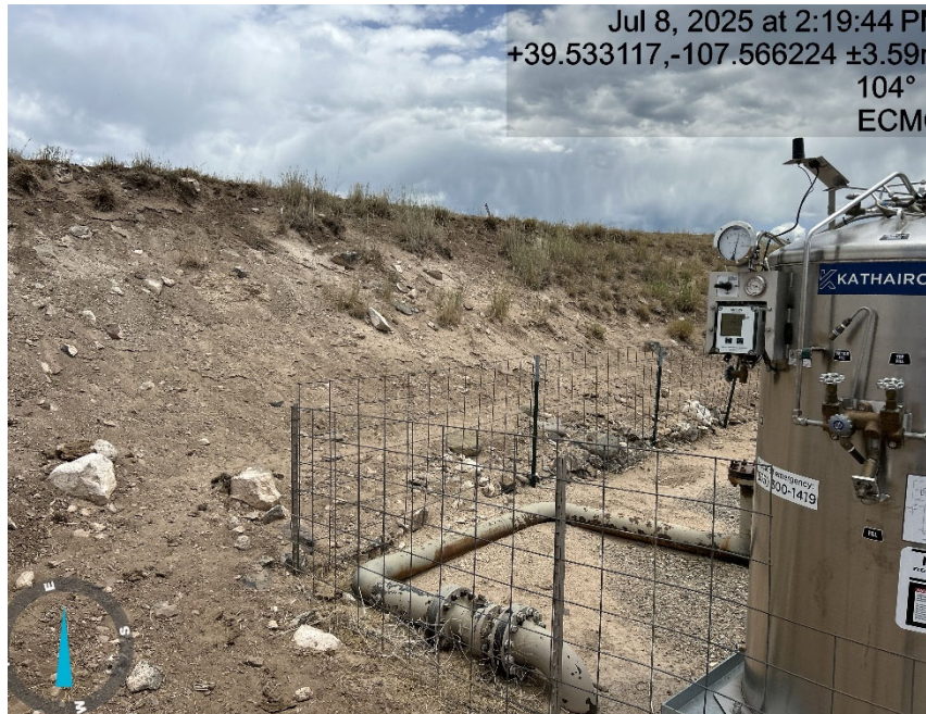
Cut slope lacks stabilization