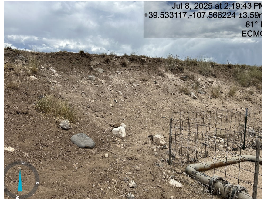
Cut slope lacks stabilization