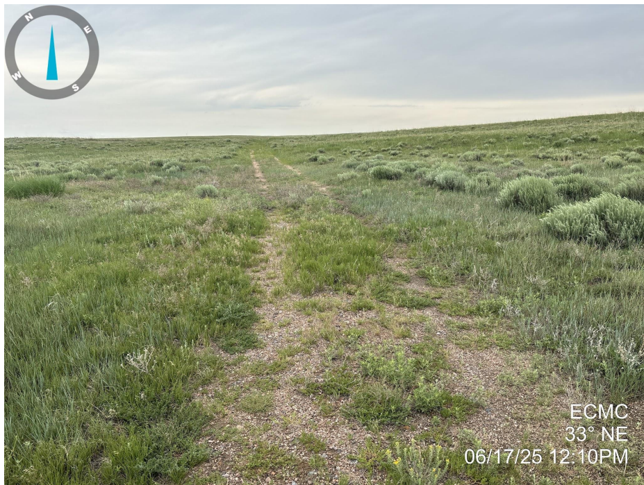
Photo 7. Photo taken of the access road, facing northeast towards the well location. See comments under Photo 6.