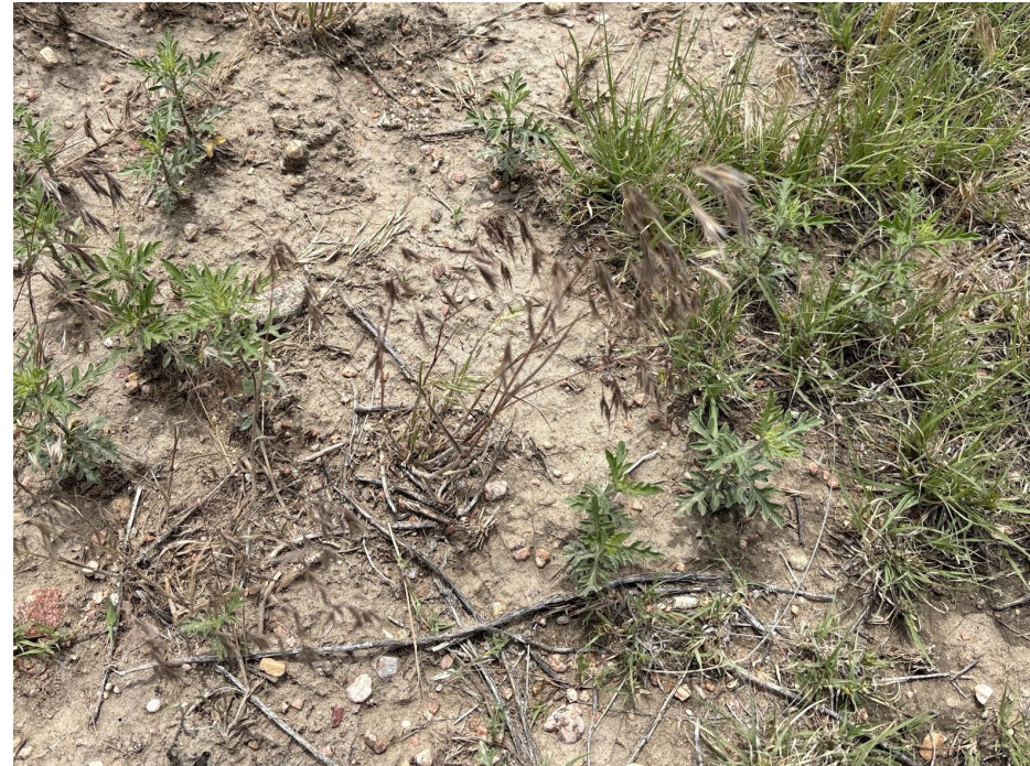
Photo 12. Photo taken of ground cover at the tank battery location. Photo illustrates bare ground and weedy annual vegetation, including cheatgrass ( Bromus tectorum ), a List C Noxious Weed species.