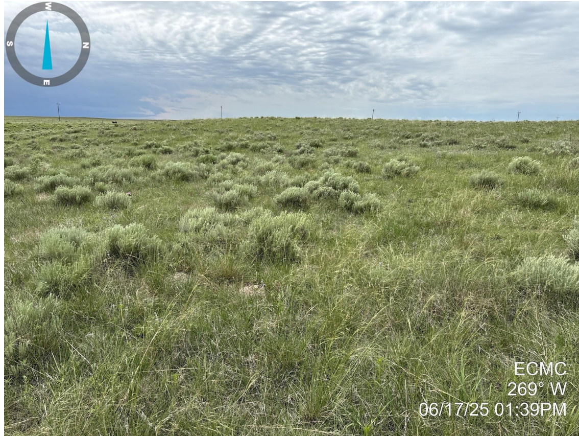
Photo 13. Photo taken of reference area to the well location, west of the location, facing West. Photo illustrates sand sagebrush ( Artemisia filifolia ) and perennial grass vegetation.