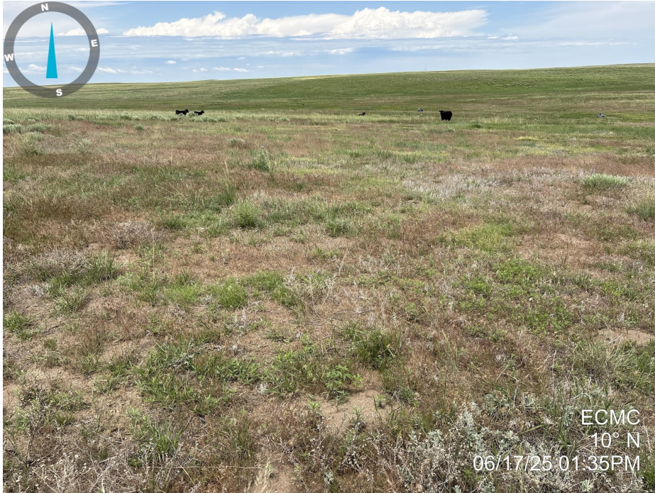
Photo 9. Photo taken of the tank battery location, facing North. Photo illustrates that final reclamation activities appear to have taken place, but weedy annual vegetation dominates the location.