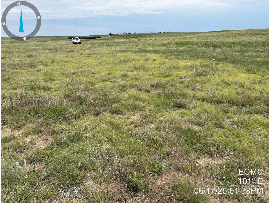
Photo 11. Photo taken of the tank battery location, facing East. See comments under Photo 9.