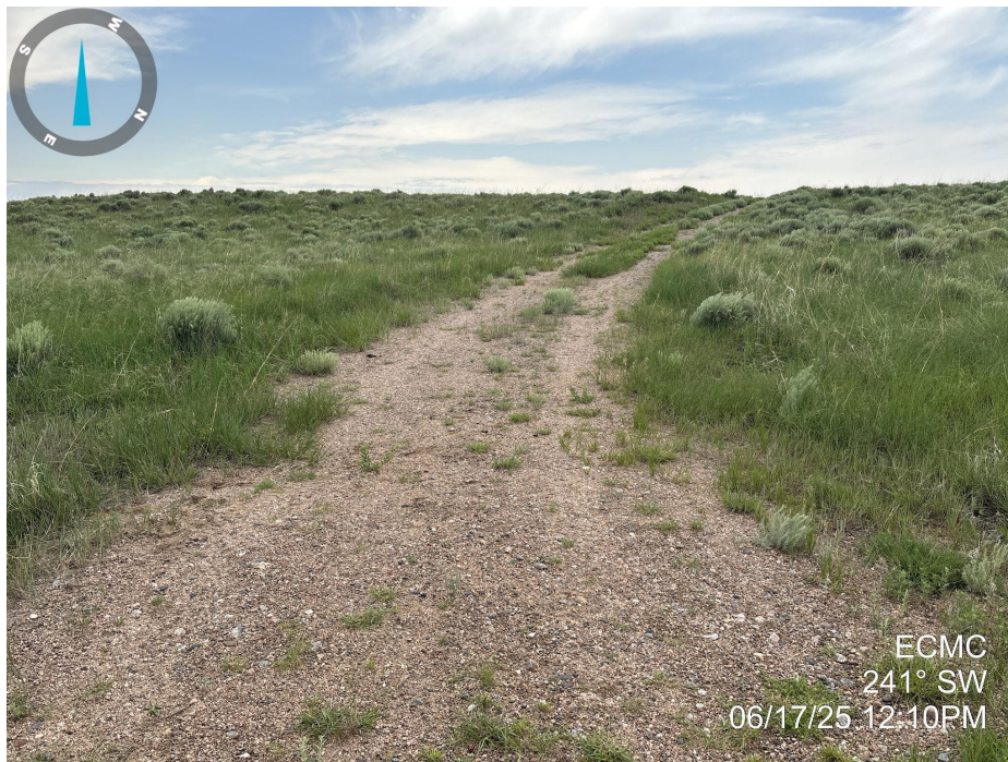
Photo 8. Photo taken of the access road, facing southwest away from the well location. See comments under Photo 6.