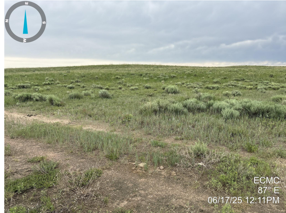
Photo 2. Photo taken from the well location, facing East. See comments under Photo 1.