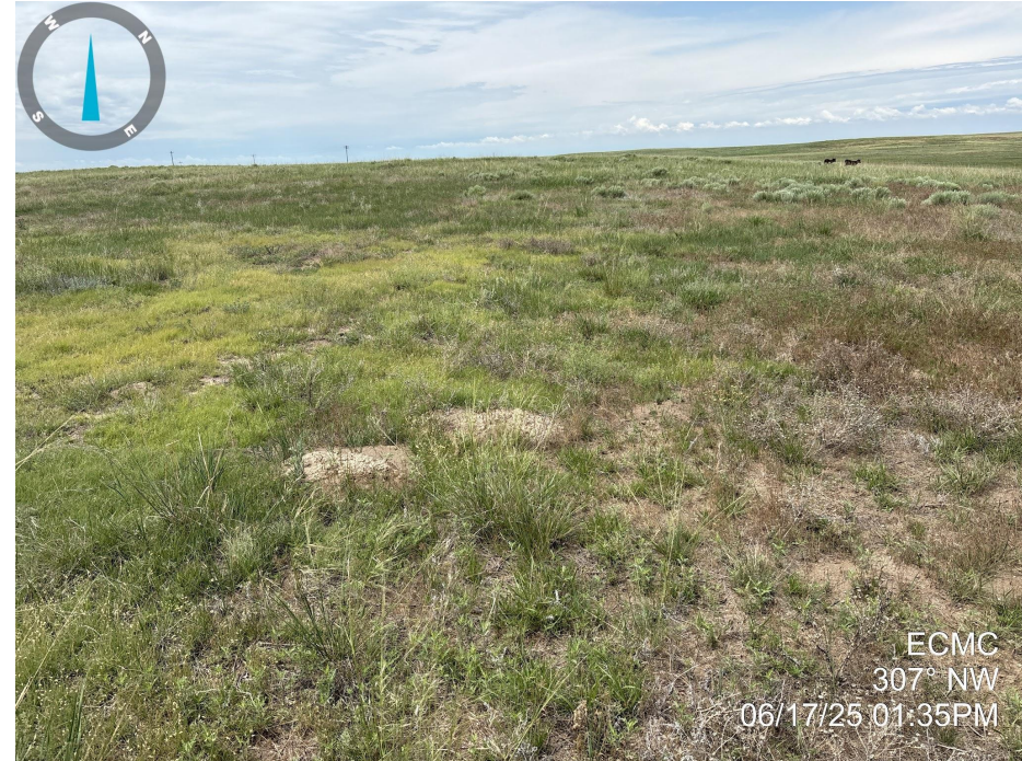
Photo 10. Photo taken of the tank battery location, facing Northwest. See comments under Photo 9.