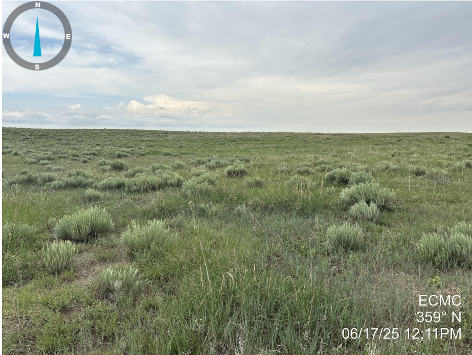
Photo 1. Photo taken from the well location, facing North. Photo illustrates that final reclamation activities have taken place, but vegetation establishment does not meet Rule 1004 standards. The site is dominated by weedy annual vegetation, including cheatgrass ( Bromus tectorum ), a List C Noxious Weed species.