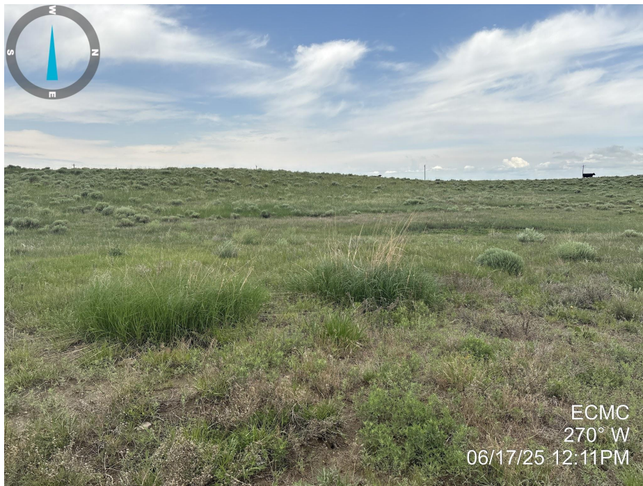
Photo 4. Photo taken from the well location, facing West. See comments under Photo 1.