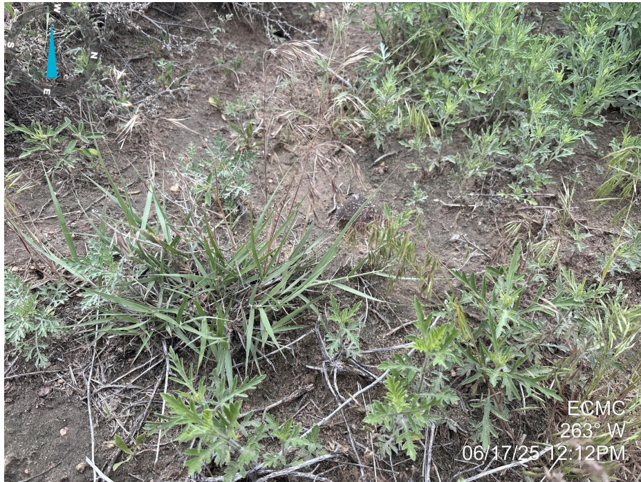
Photo 5. Photo taken of ground cover at the well location. Photo illustrates weedy annual vegetation was observed at the location, including cheatgrass ( Bromus tectorum ), a List C Noxious Weed species.