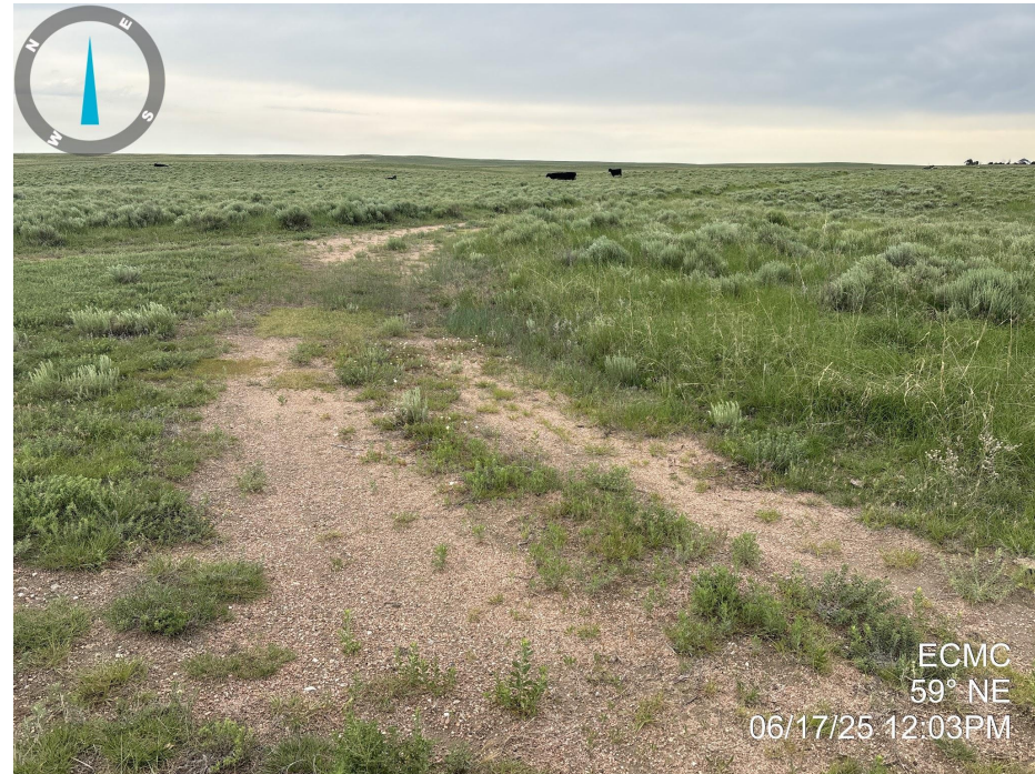
Photo 6. Photo taken of the access road, facing northeast towards the well location. Photo illustrates that final reclamation has not taken place at the access road, per the approved variance request.