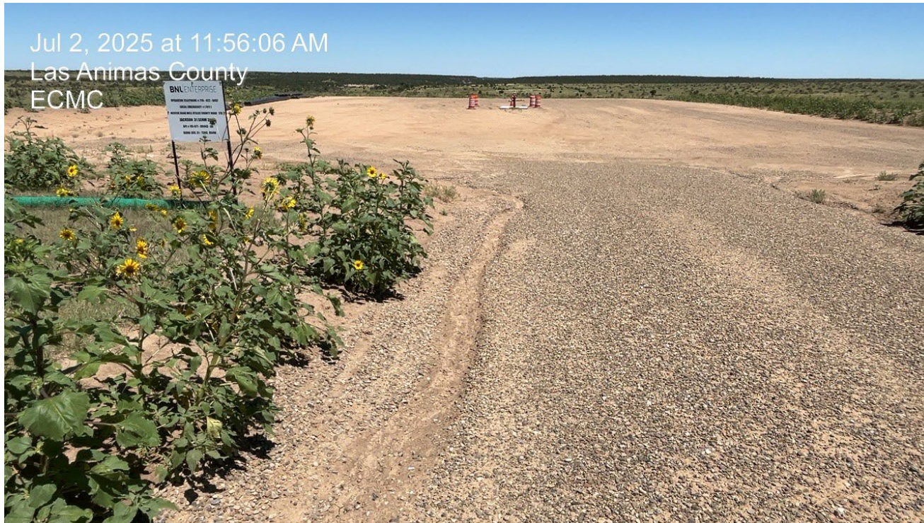
Photo 3. Facing north toward the wellsite location.