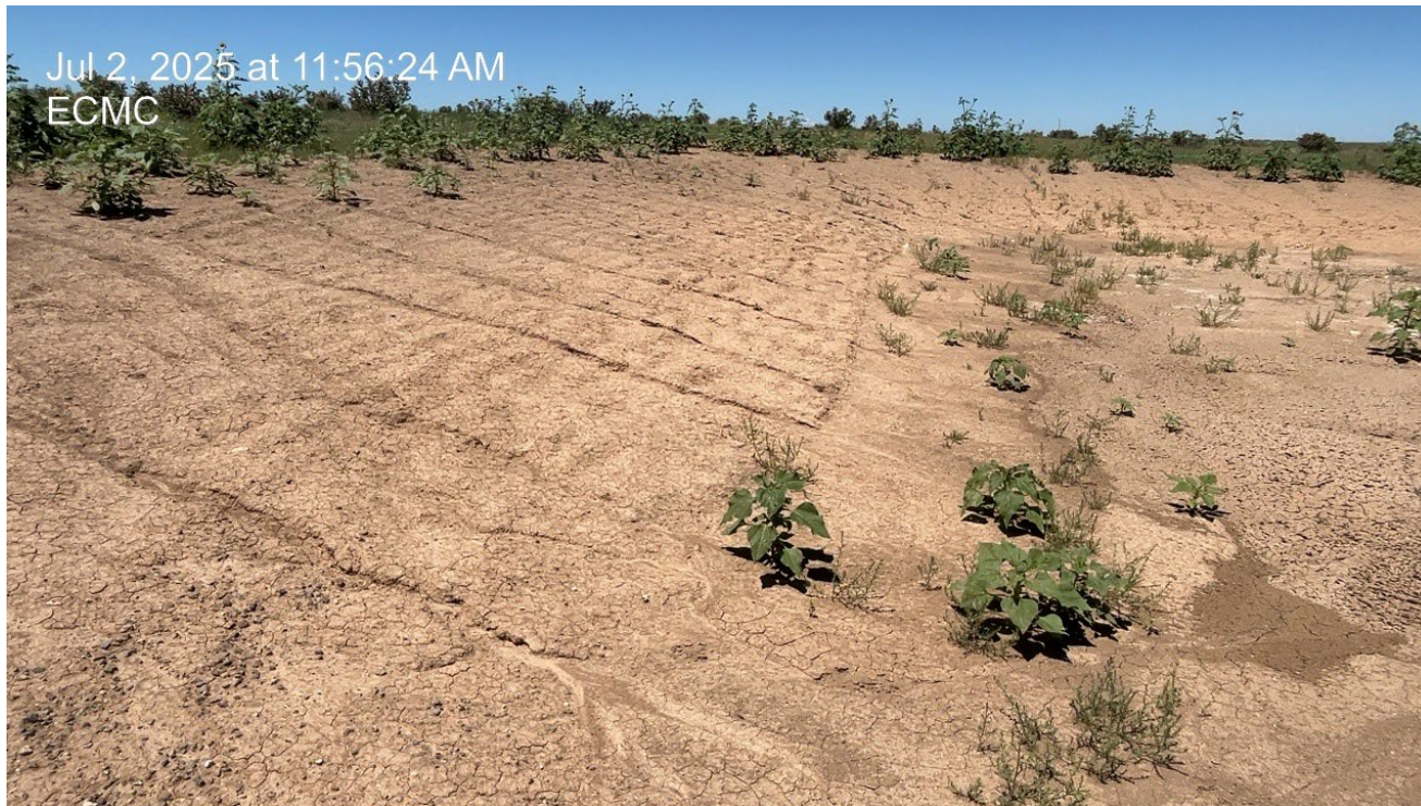
Photo 4. The cut slope of the location is not stabilized and is beginning to erode.