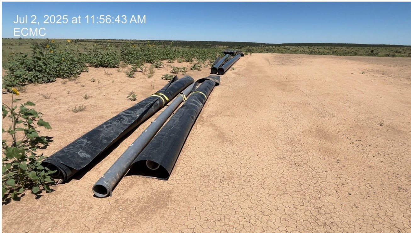
Photo 5. There is unused piupe and liner that needs to be removed.