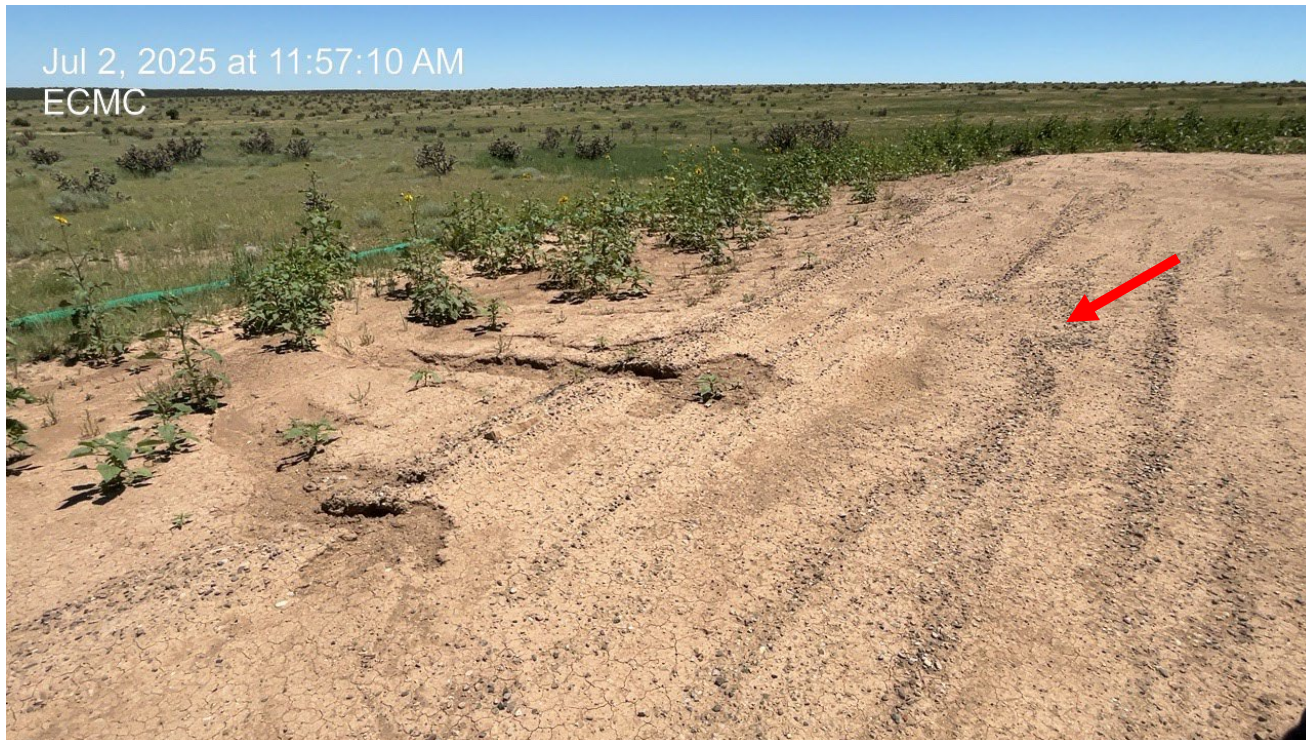
Photo 6. The fill slope of the location is not stabilized and is beginning to erode.