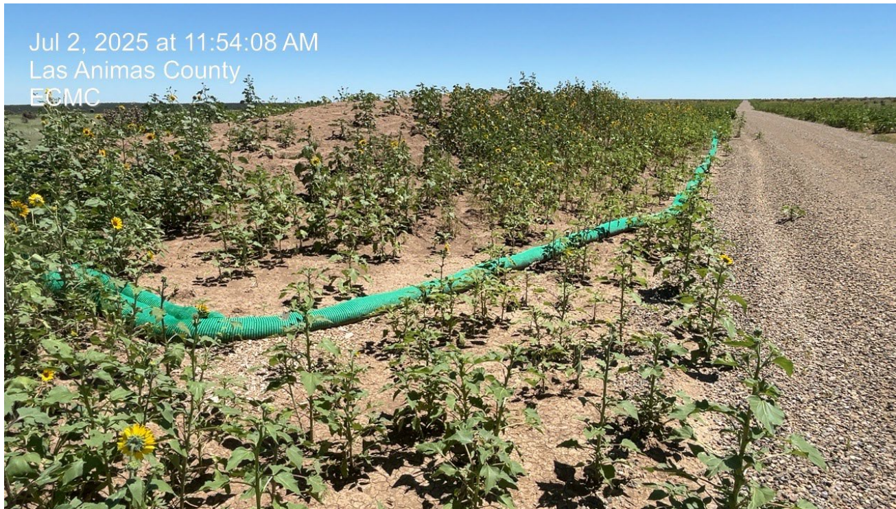
Photo 2. The topsoil piles stored along the road will need to be seeded for long term stabilization with perennial vegetation. The annual sunflowers that have naturally grown are not sufficient for long term stabilization.