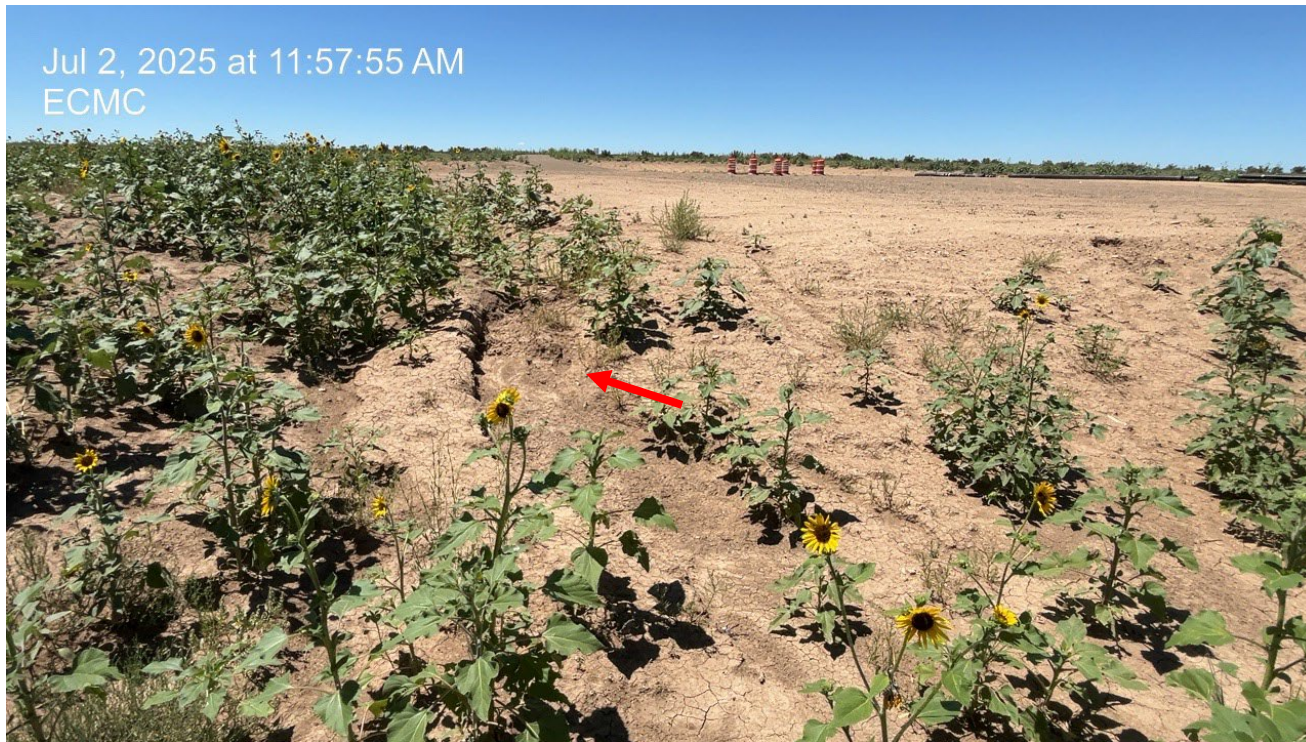
Photo 7. The entire location slopes to this northeast corner and there are insufficient BMP's to prevent erosion and offsite sediment transport. There is erosion occurring shown at red arrow.