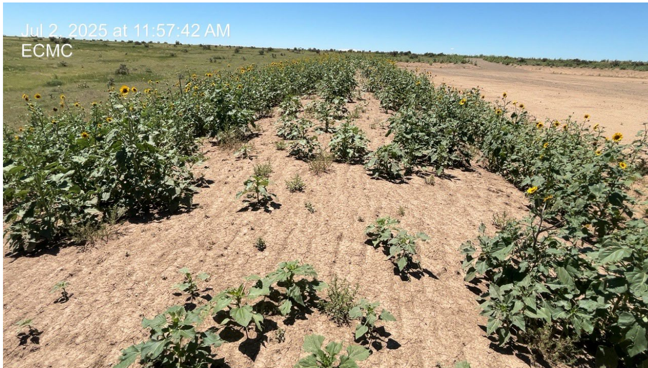
Photo 8. The topsoil pile at the east side of the location will need to be seeded and stabilized if stored for longer than 6 month since construction.