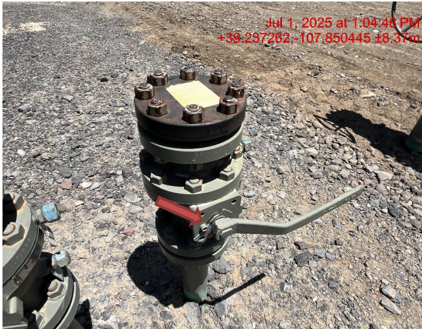
Photo # 9256 Unused flowline does not comply with CECMC 600 & 1100 series rules