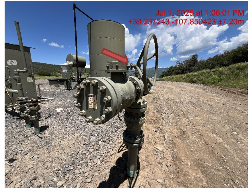
Photo # 9257 Unused flowline does not comply with CECMC 600 & 1100 series rules