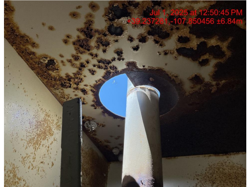
Photo # 9247 Hole in separator building/wildlife hazard/available for entry by wildlife