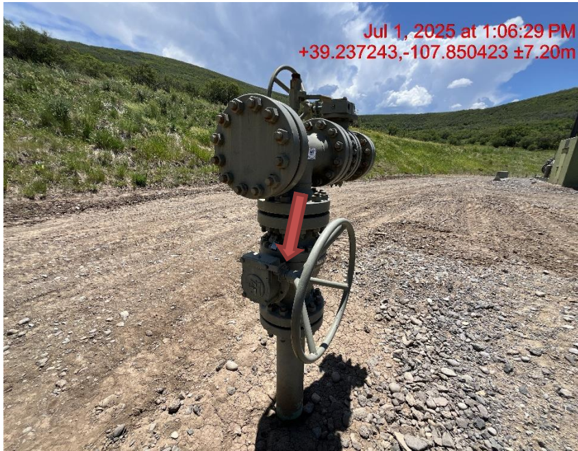
Photo # 9259 Unused flowline does not comply with CECMC 600 & 1100 series rules