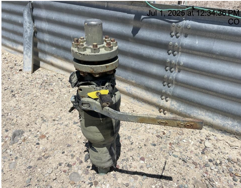
Photo # 9151 Unused flowline lacks tag/not in compliance with CECMC rules