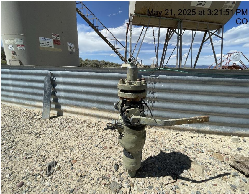
Photo # 2213 From inspection/audit 708906562 conducted on 05/21/2025 Unused flowline lacks lockout tagout (OOSLAT)