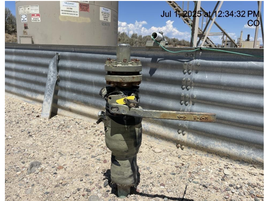
Photo # 9150 Unused flowline lacks tag/not in compliance with CECMC rules