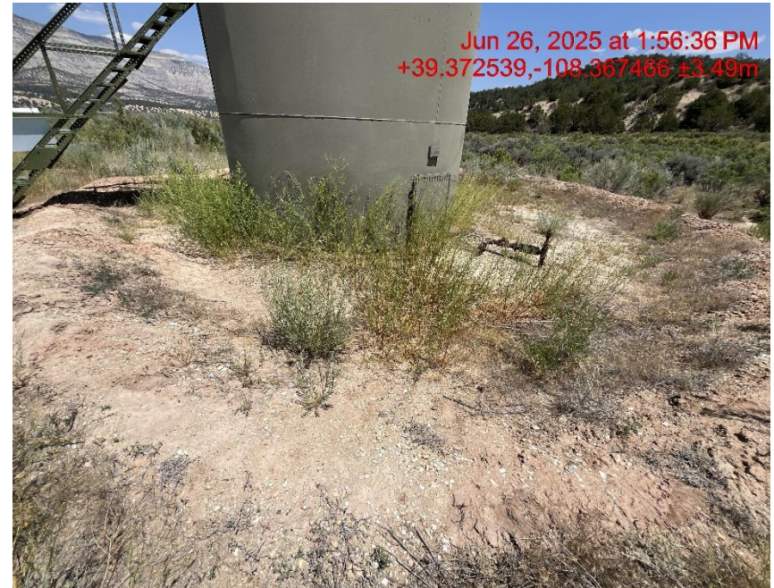
Photo # 8993 Weeds/undesirable plant species surrounding production equipment constitutes a fire hazard