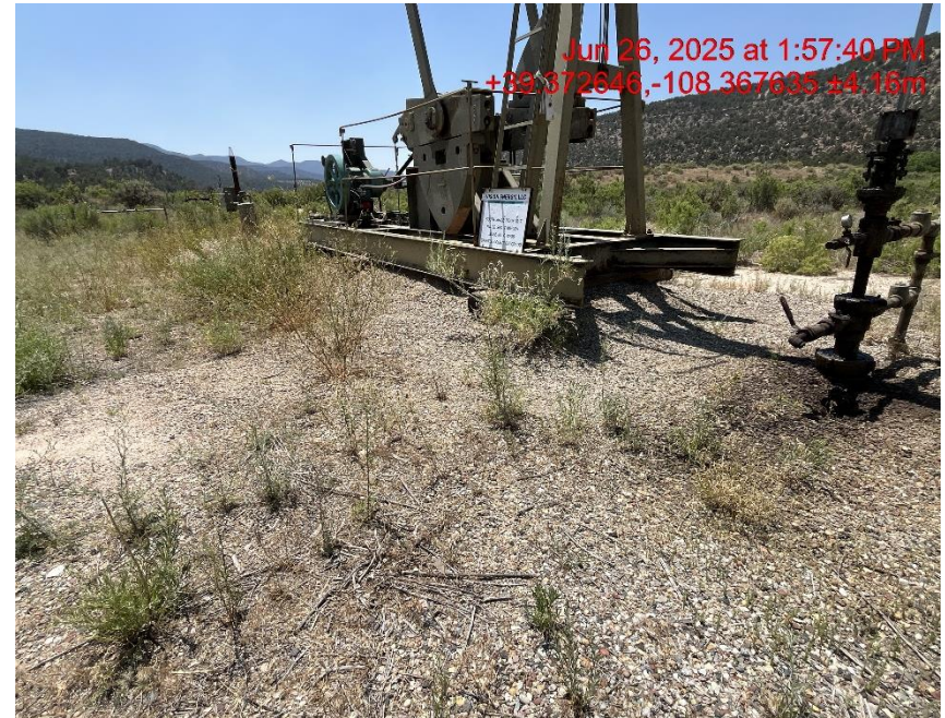
Photo # 8995 Weeds/undesirable plant species surrounding production equipment constitutes a fire hazard