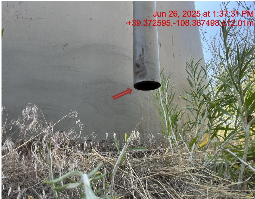
Photo # 8965 Open ended piping on production tank/wildlife hazard/available for entry by wildlife