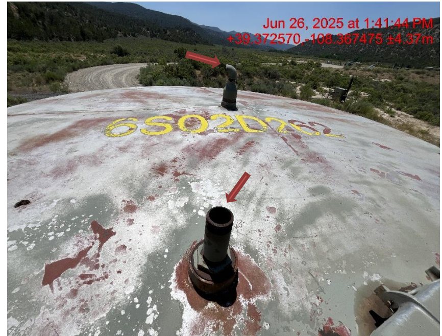
Photo # 8974 Open ended piping on production tank/wildlife hazard/available for entry by wildlife