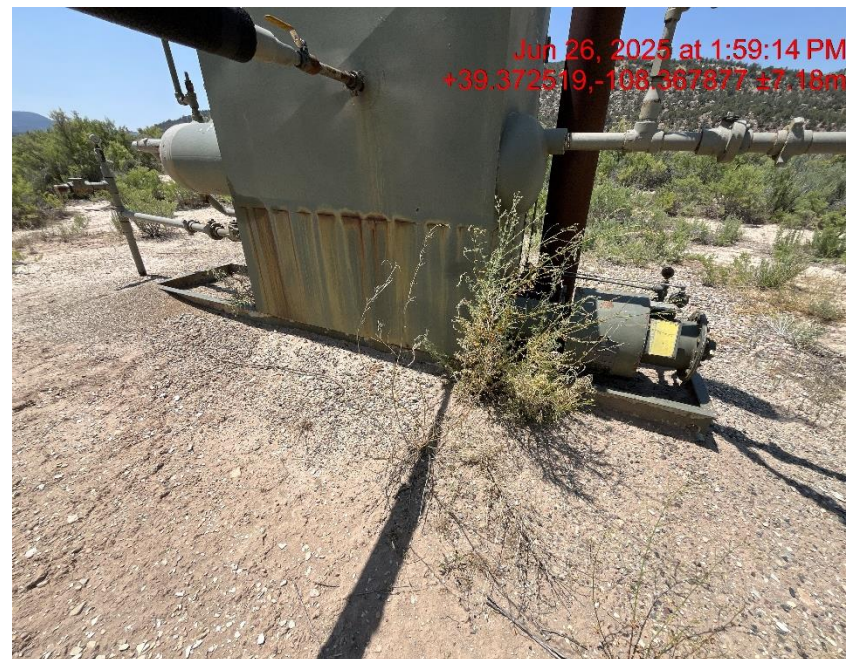
Photo # 9001 Weeds/undesirable plant species surrounding production equipment constitutes a fire hazard