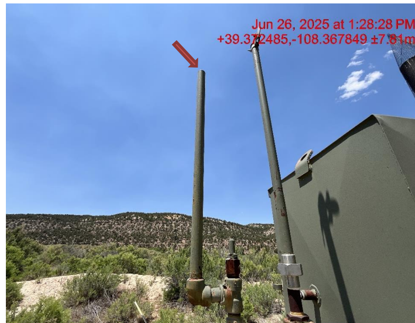
Photo # 8954 PRV vent line does not comply with CECMC pressure safety device rules