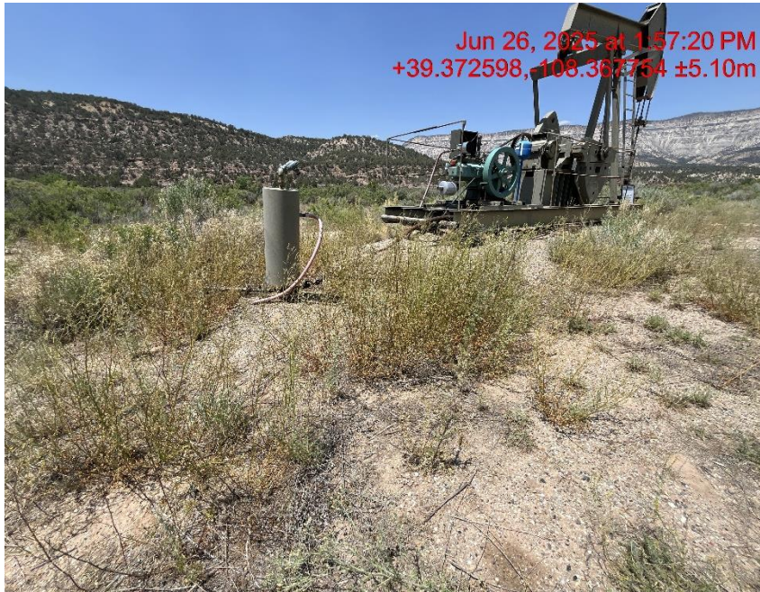
Photo # 8994 Weeds/undesirable plant species surrounding production equipment constitutes a fire hazard