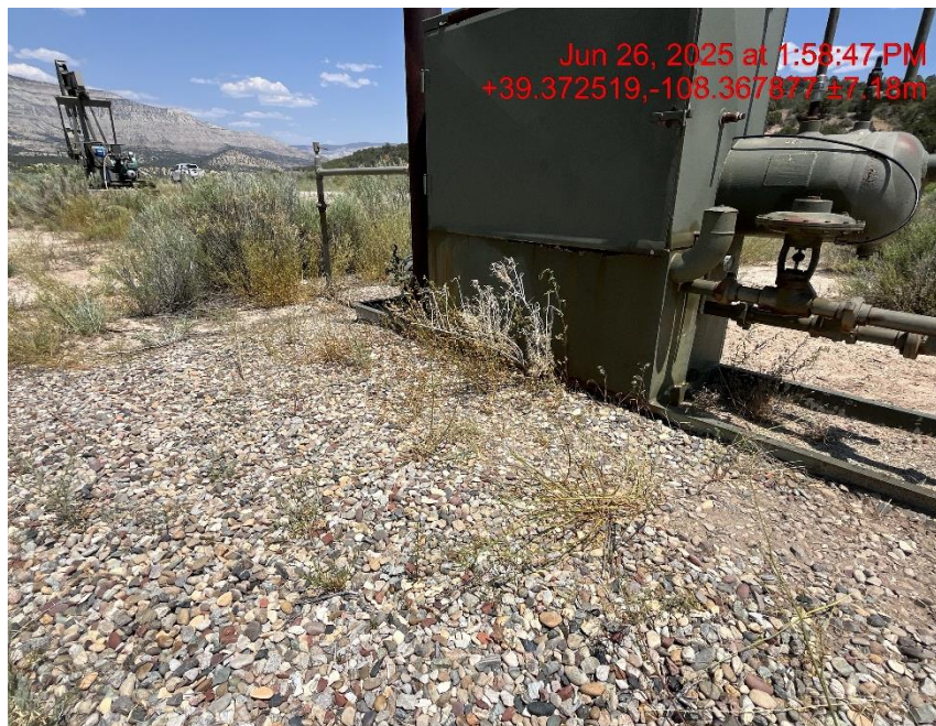
Photo # 8999 Weeds/undesirable plant species surrounding production equipment constitutes a fire hazard