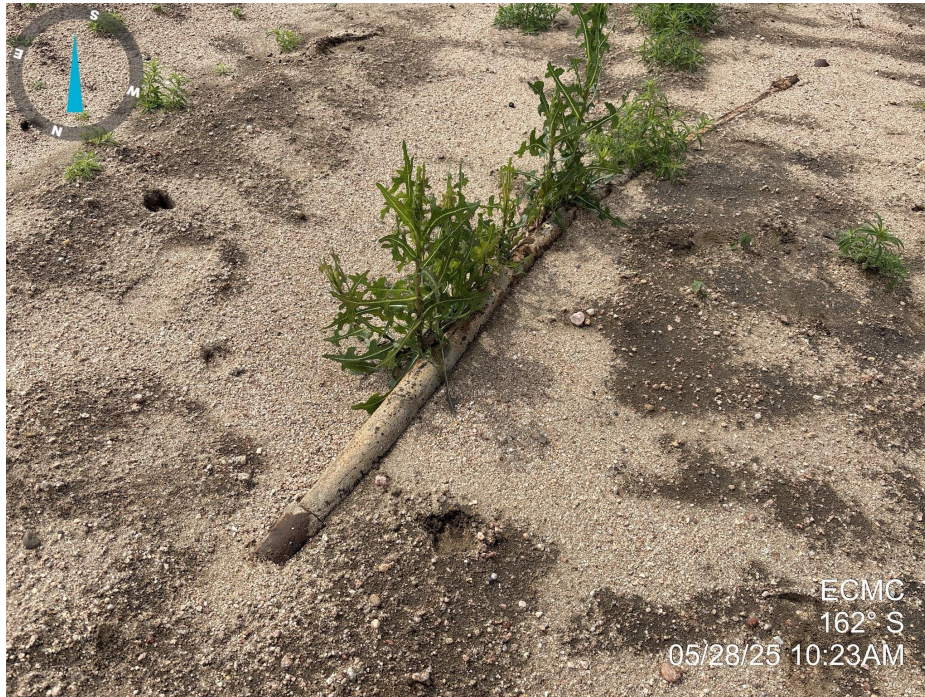
Photo 7. Photo taken of the well location. Photo illustrates that the flowlines which were previously abandoned in place have been exposed at the well site.