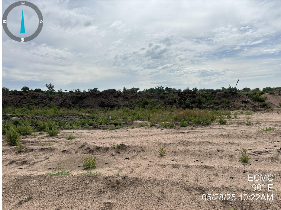
Photo 4. Photo taken from the well location, facing East. See comments under Photo 3.