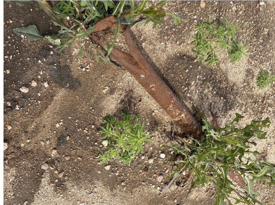
Photo 8. Photo taken of the well site. Photo illustrates flowlines exposed by the land use change at the well site.