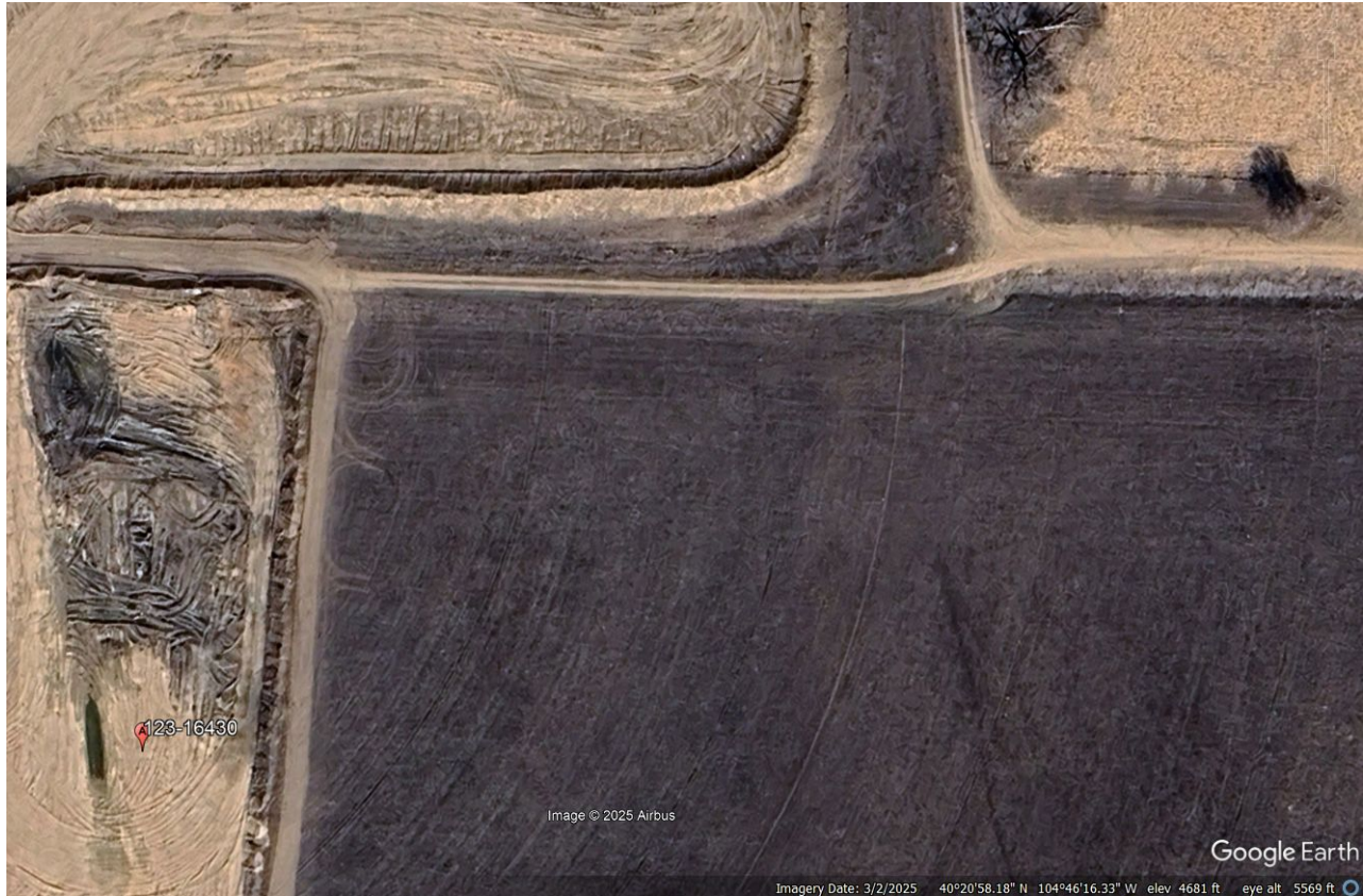
Photo 2. Google Earth Aerial Imagery from March 2, 2025. Photo illustrates the well location, access road, and associated off-location tank battery after plugging operations. The well location is contained within a land use change.