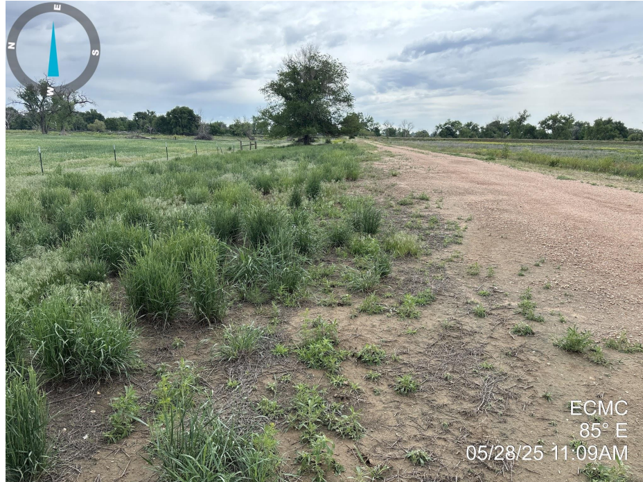
Photo 10. Photo taken of the tank battery location, facing East. See comments under Photo 9.