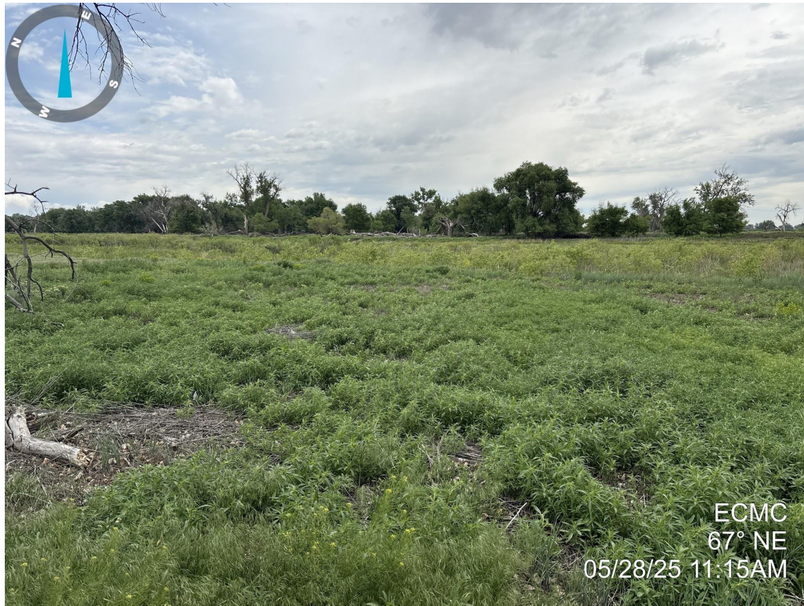
Photo 11. Photo taken of reference area, east of the tank battery location, facing Northeast.