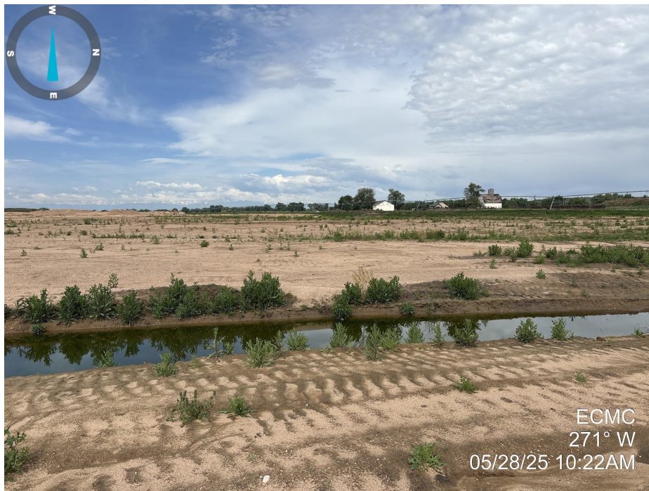
Photo 6. Photo taken from the well location, facing West. See comments under Photo 3.