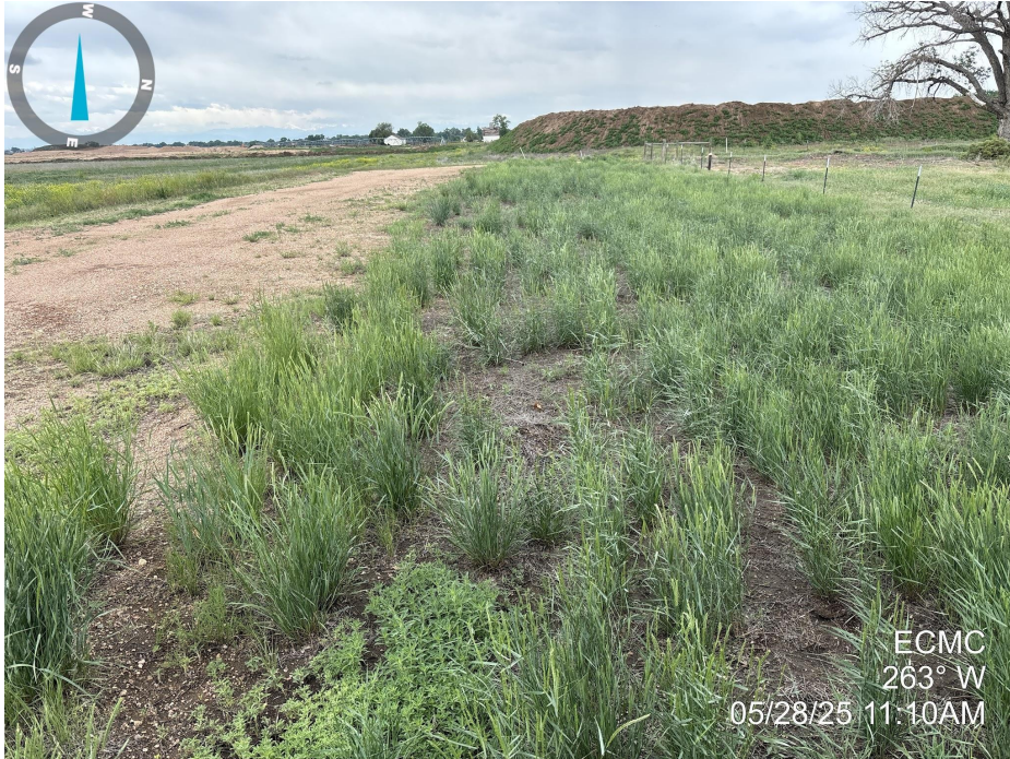
Photo 9. Photo taken of the tank battery location, facing West. Photo illustrates that final reclamation activities have taken place, however vegetation establishment does not meet Rule 1004 standards. Weedy annual vegetation, including cheatgrass ( Bromus tectorum ), a List C Noxious Weed species, was observed at the location.