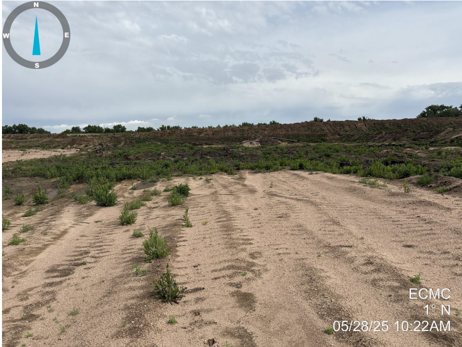
Photo 3. Photo taken from the well location, facing North. Photo illustrates that the location is contained within a land use change.