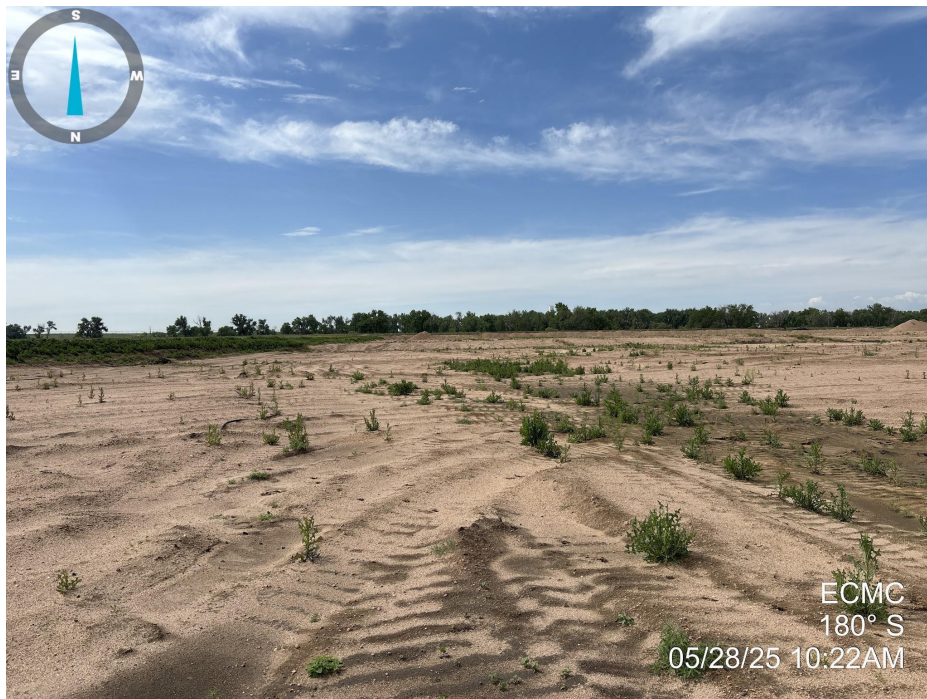
Photo 5. Photo taken from the well location, facing South. See comments under Photo 3.