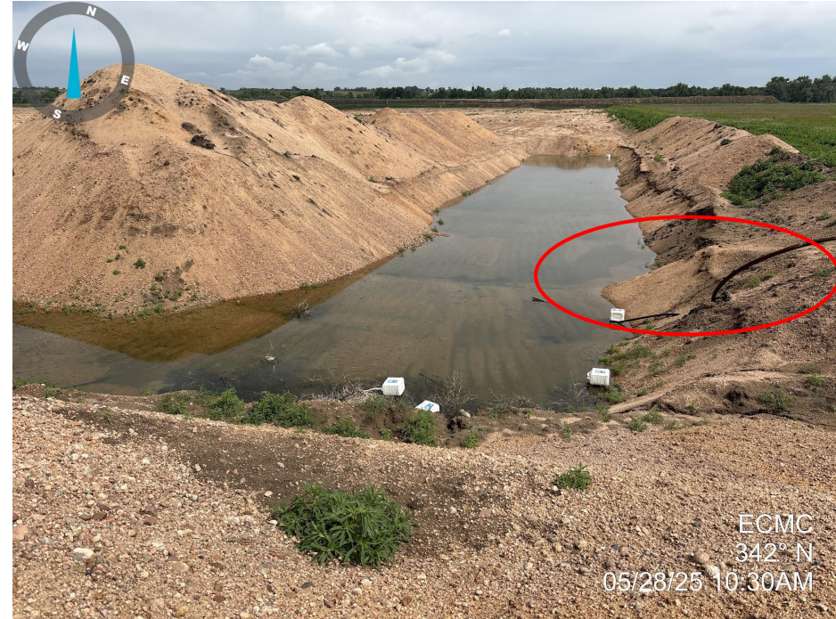
Photo 4. Photo taken of the well location, facing North. See comments under Photo 3.