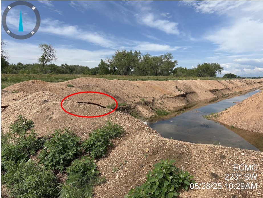
Photo 3. Photo taken of the well location, facing Southwest. Photo illustrates that the location is contained within a land use change. A flowline was abandoned in place, but has been exposed at the site and requires removal (highlighted in red circle).