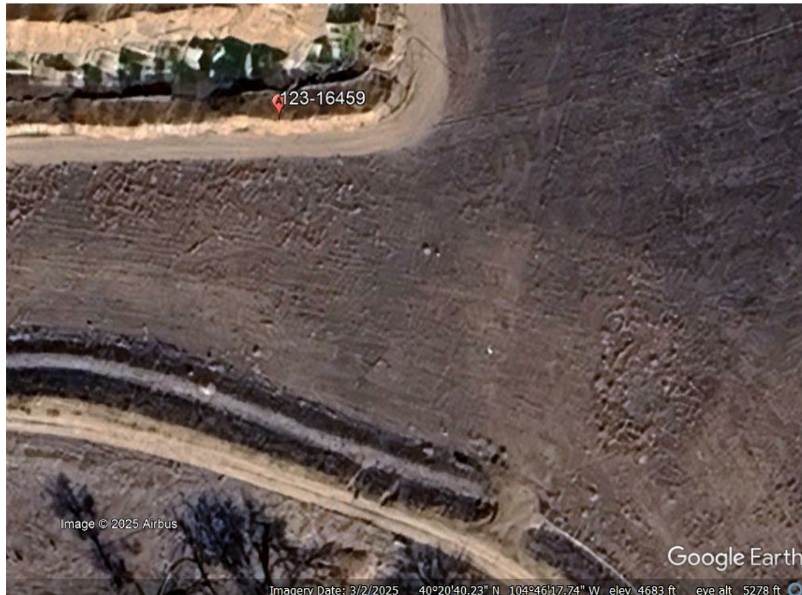
Photo 2. Google Earth Aerial Imagery from March 2, 2025. Photo illustrates the well location and access road after plugging operations. The well location is contained within a land use change.