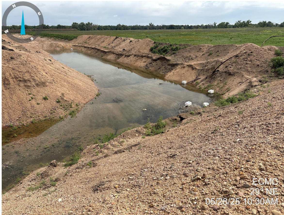
Photo 5. Photo taken of the well location, facing Northeast. See comments under Photo 3.