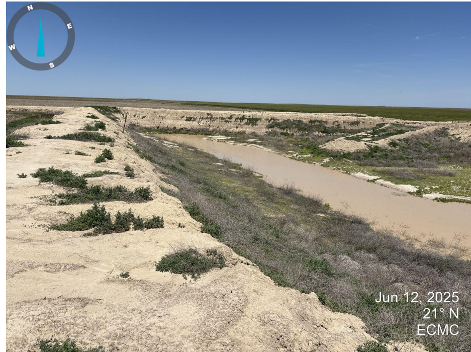
Photo 2. Picture taken from the southwest corner of the south pit. T posts and metal debris are present in the pit.