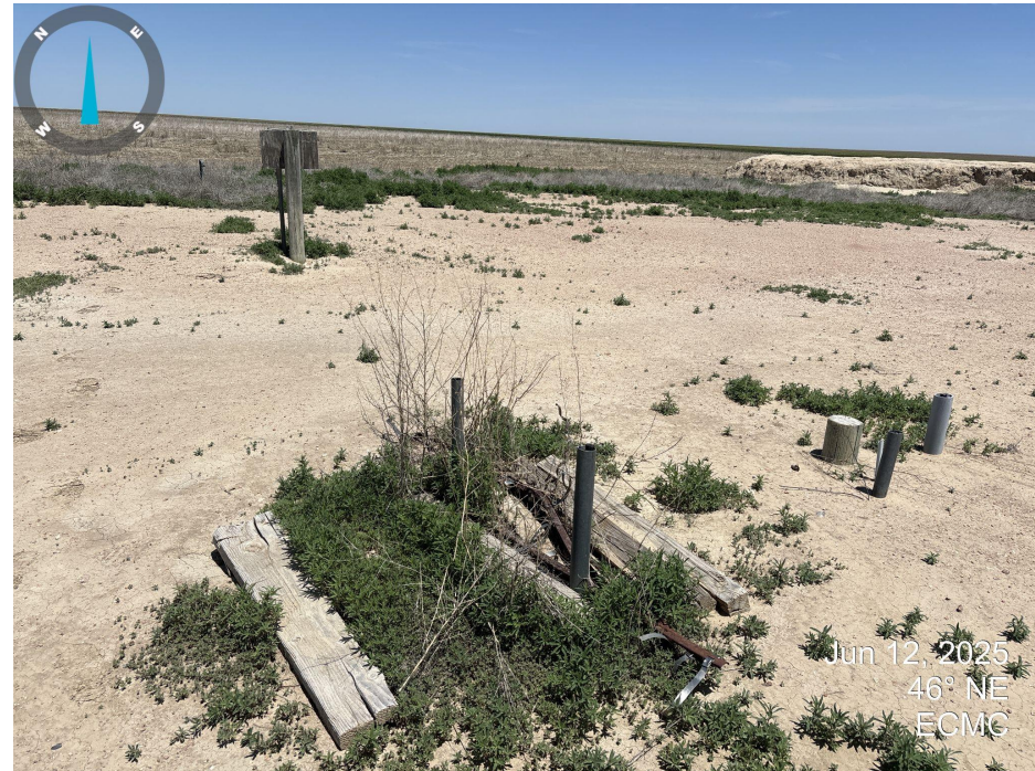
Photo 8. Looking northeast across the wellhead area. Wood debris, pipe and exposed wires are present on location.