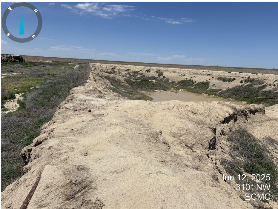
Photo 5. Looking northwest across the northwest pit.