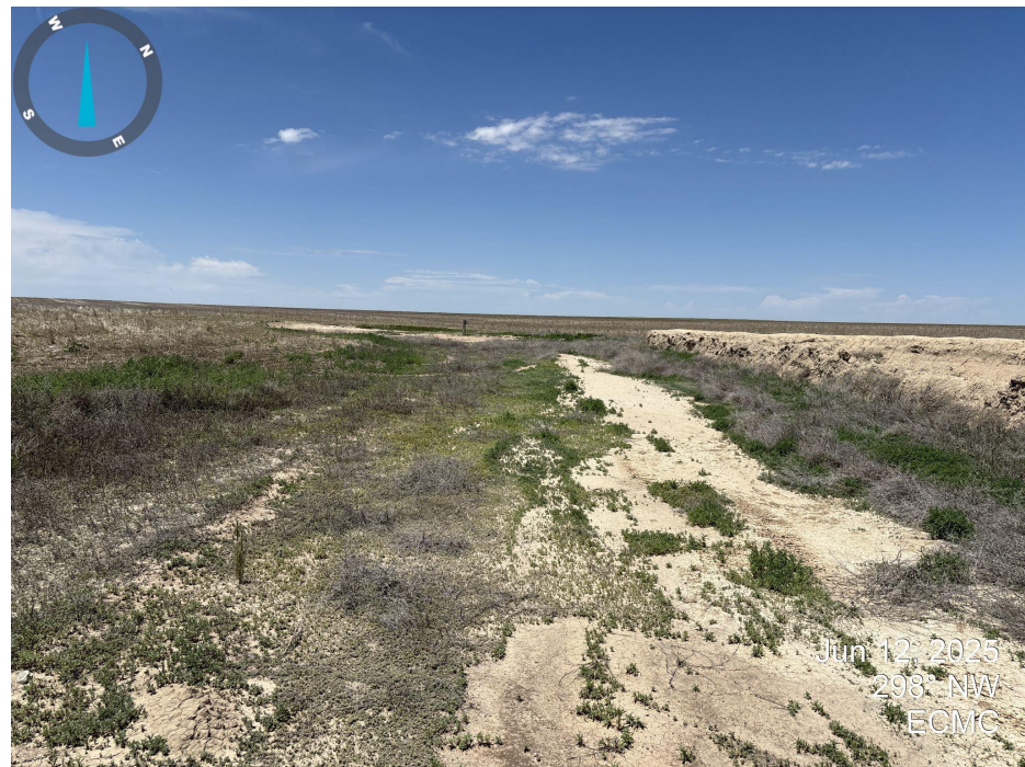
Photo 6. Looking west down the access road towards the wellhead.