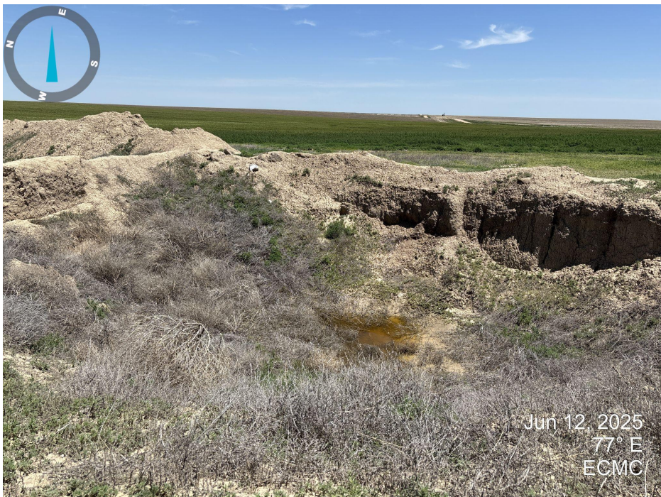
Photo 3. Looking east across the skim pit area.