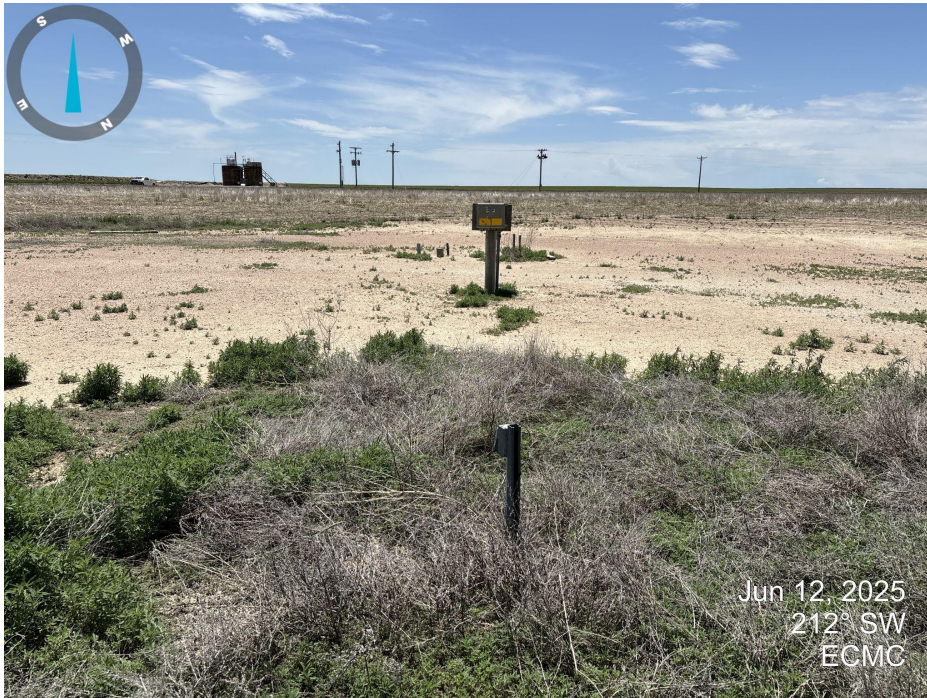
Photo 7. Looking southwest across the wellbore area. Electrical equipment and posts remain on location.