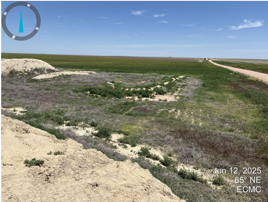
Photo 1. Looking east across the entrance and former tank battery. Undesirable weed kochia is present throughout the location. Location has not been recontoured and pits remain on location.