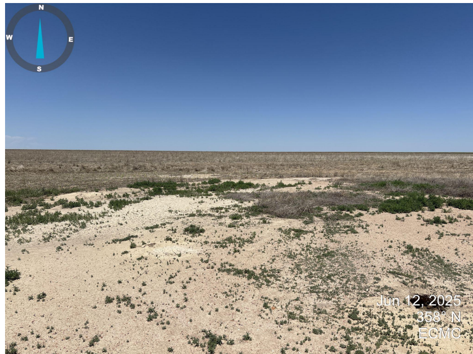
Photo 10. Looking north from the wellbore. See photo 9 comments.