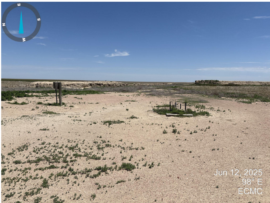
Photo 9. Looking east from the wellbore. The well location is bare earth and gravel. The location is surrounded by cropland.