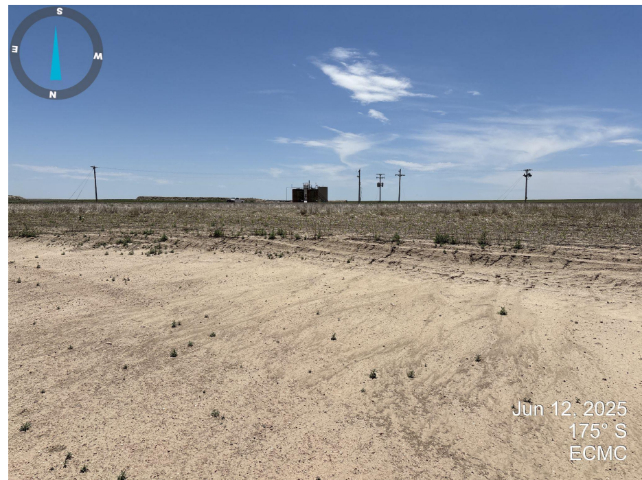
Photo 12. Looking south from the wellbore. See photo 9 comments.