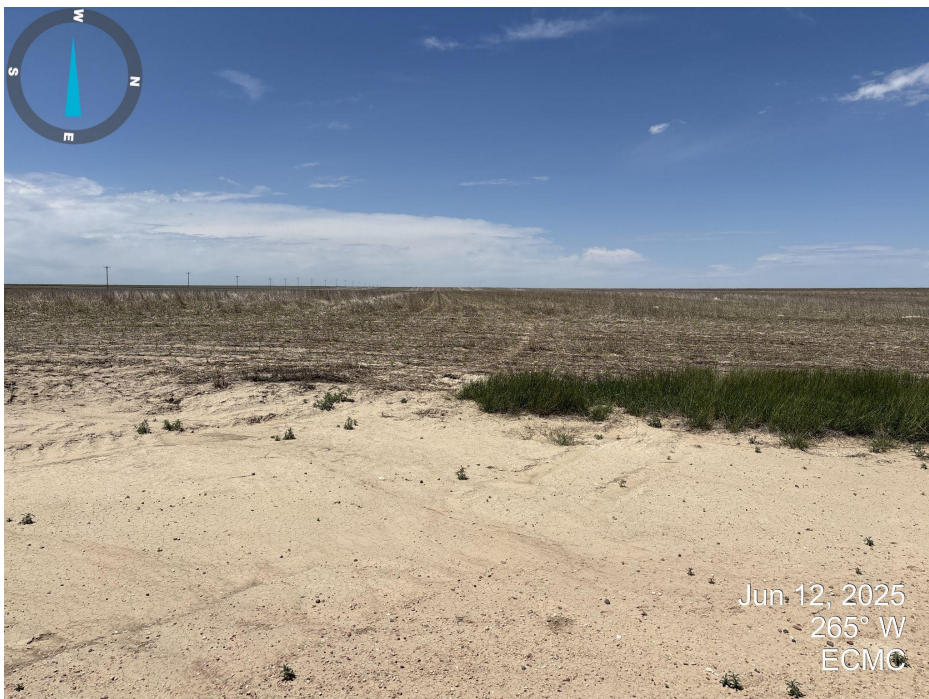
Photo 11. Looking west from the wellbore. See photo 9 comments.