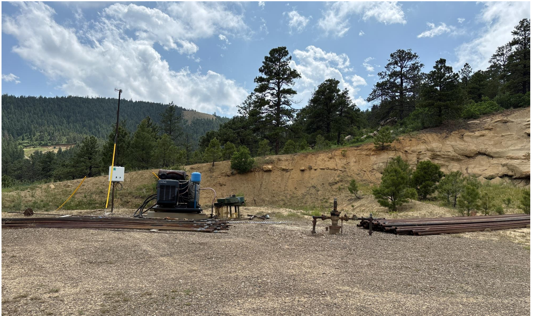
PHOTO 6: UNUSED EQUIPMENT STORED ON LOCATAION (RODS AND TBG). REMOVE UNUSED EQUIPMENT PER RULE 606. CA DATE 7/17