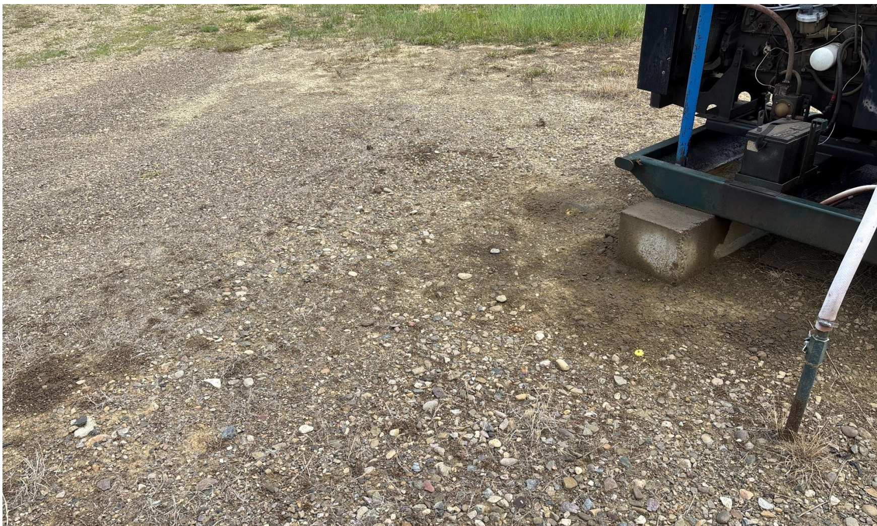
PHOTO 5: AREAS OF IMPACTED SOIL STARTING AT PRIME MOVER ENGINE SKID GOING TOWARD ORIGINAL WELLHEAD. Conduct maintenance on equipment, cleanup stained material and review self inspection processes. COMPLY WITH RULE 1002,(2).D CA DATE 6-26-2025.