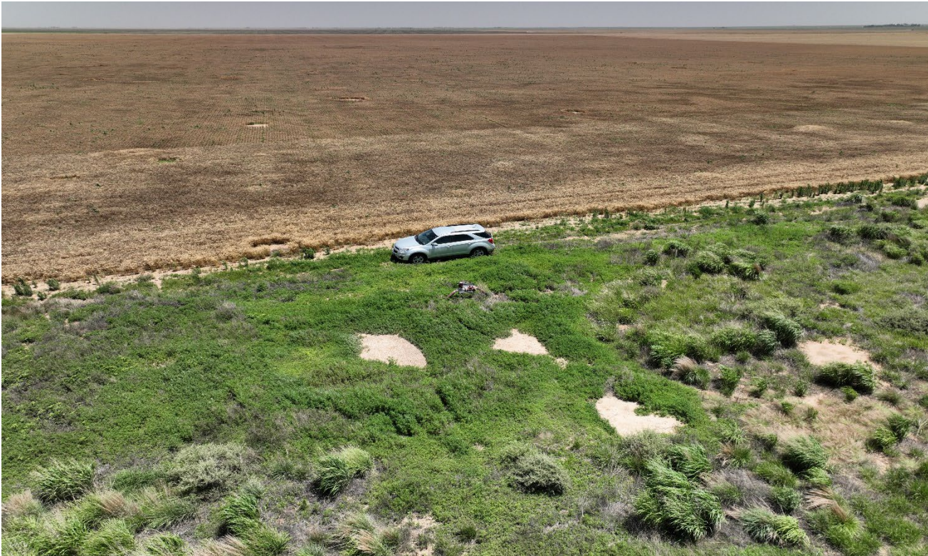
Photo 3. Drone aerial photo facing toward the offsite tank battery location 550 ft. from the wellsite. There are bare areas and undesirable weeds. This area has not been reclaimed.