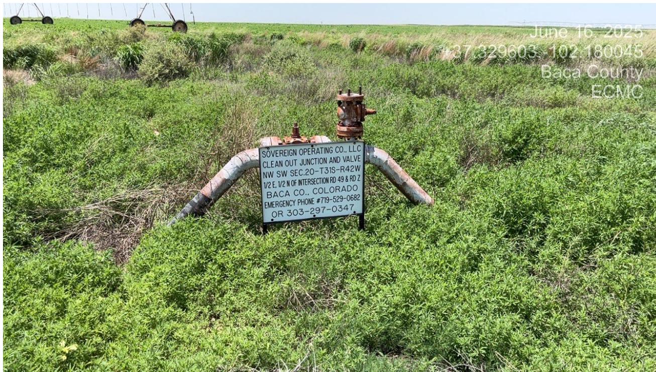
Photo 4. Abandon pipe riser has not been removed from the associated tank battery site. Operator must work with midstream for removal.