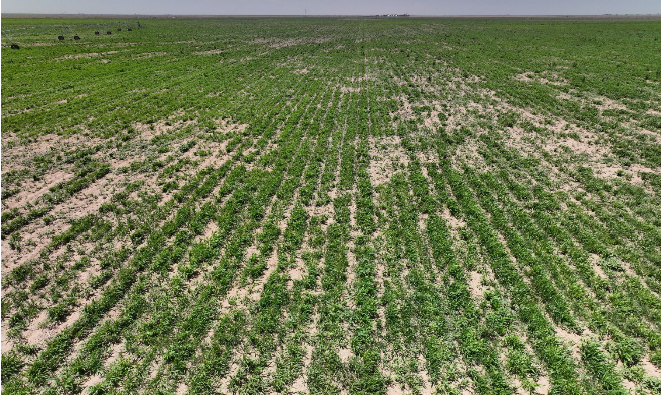
Photo 1. Drone aerial photo facing west toward the location. A crop cover has established at the former wellsite.