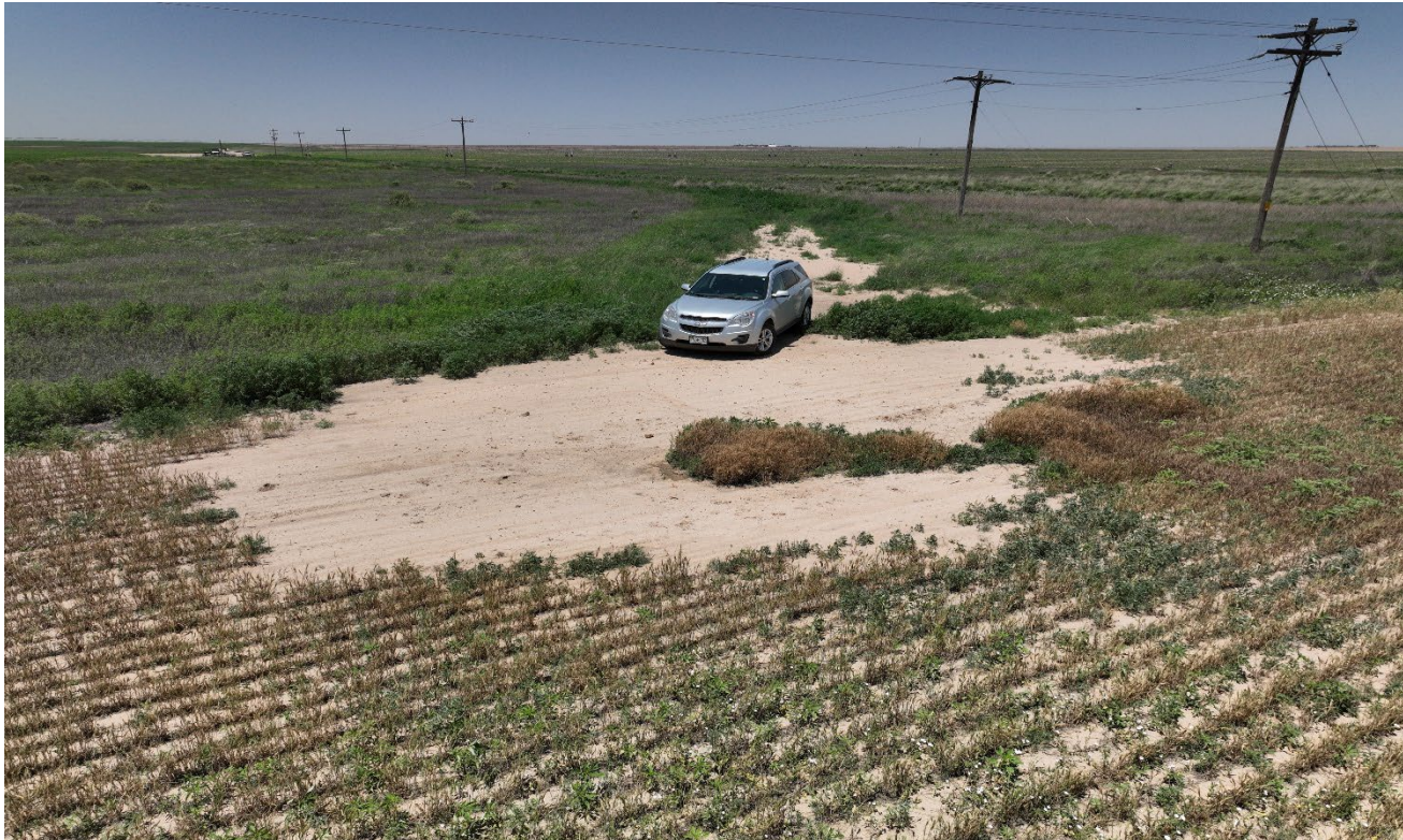
Photo 3. Drone aerial photo facing northwest toward the tank battery location located 600' northwest of the wellsite. This area has no crop growth and has suspected historic spill impacts to the soil.