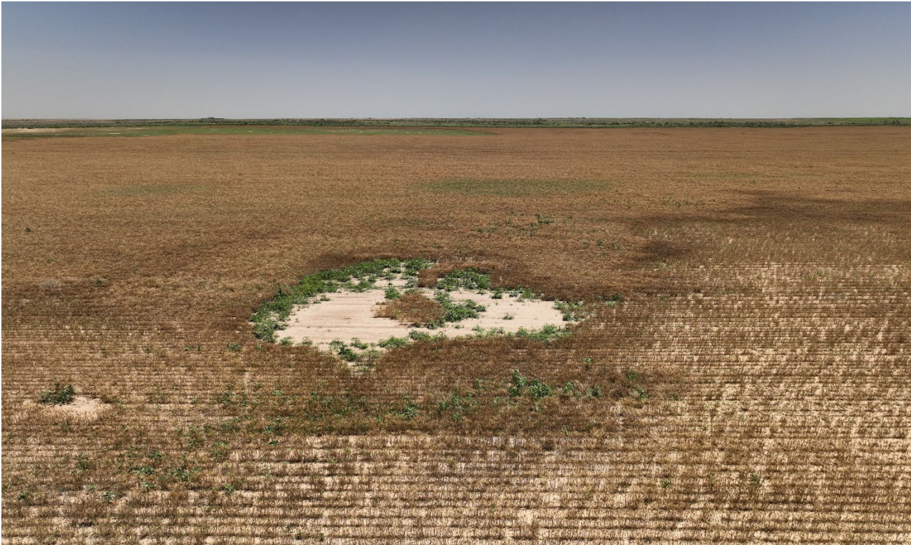
Photo 1. Drone aerial photo facing east toward the location. The area of the well site has no crop growth and appears to have impacted soils.