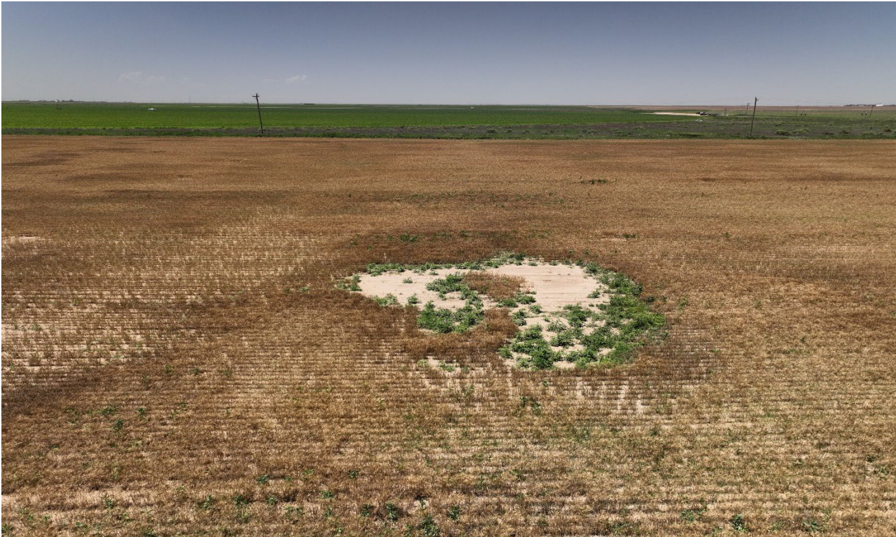
Photo 2. Drone aerial photo facing west toward the location. The area of the well site has no crop growth and appears to have impacted soils.