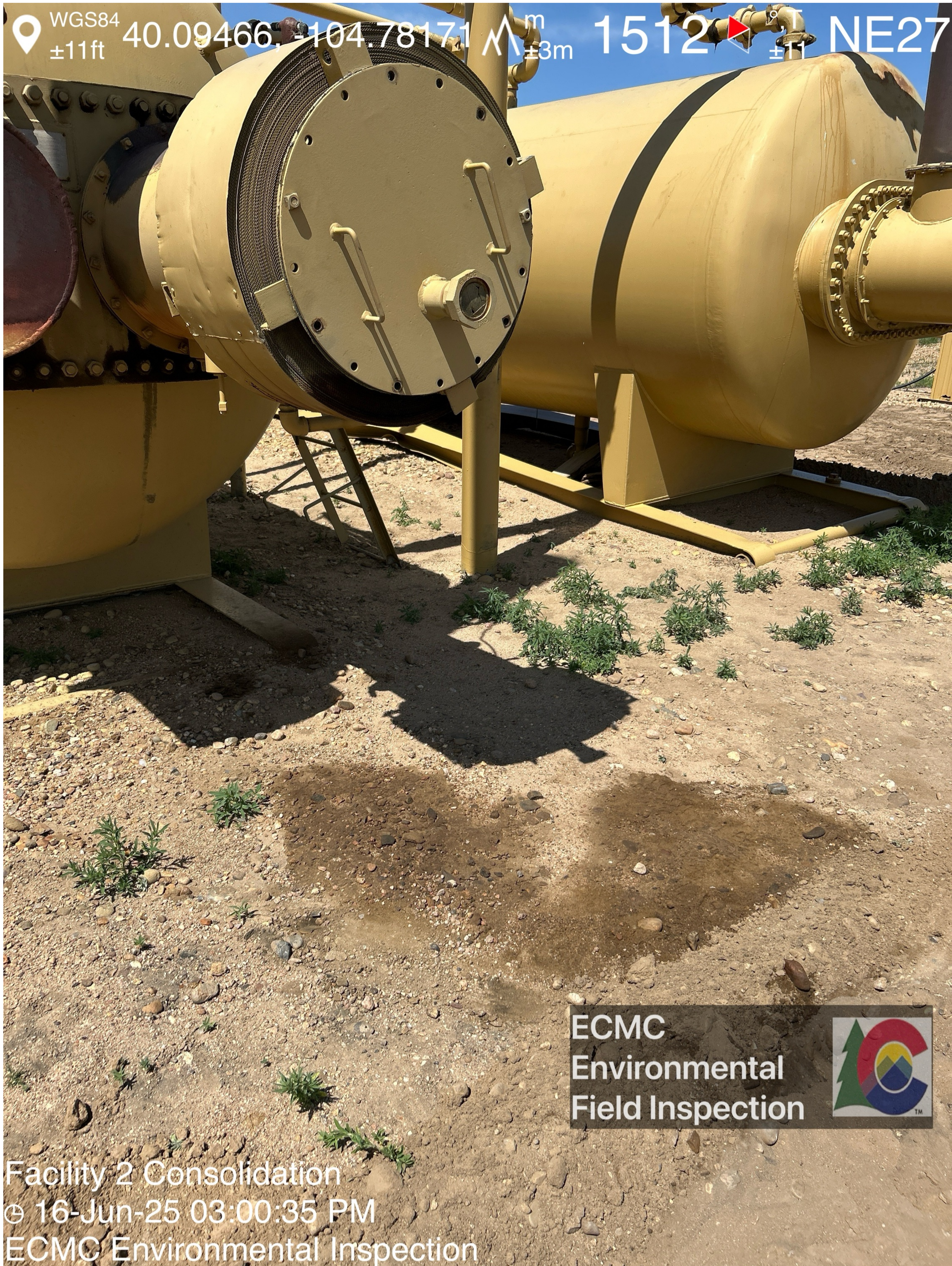
Stained soil was visible beneath the western separator. A petroleum hydrocarbon odor was observed when the stained soil was disturbed.