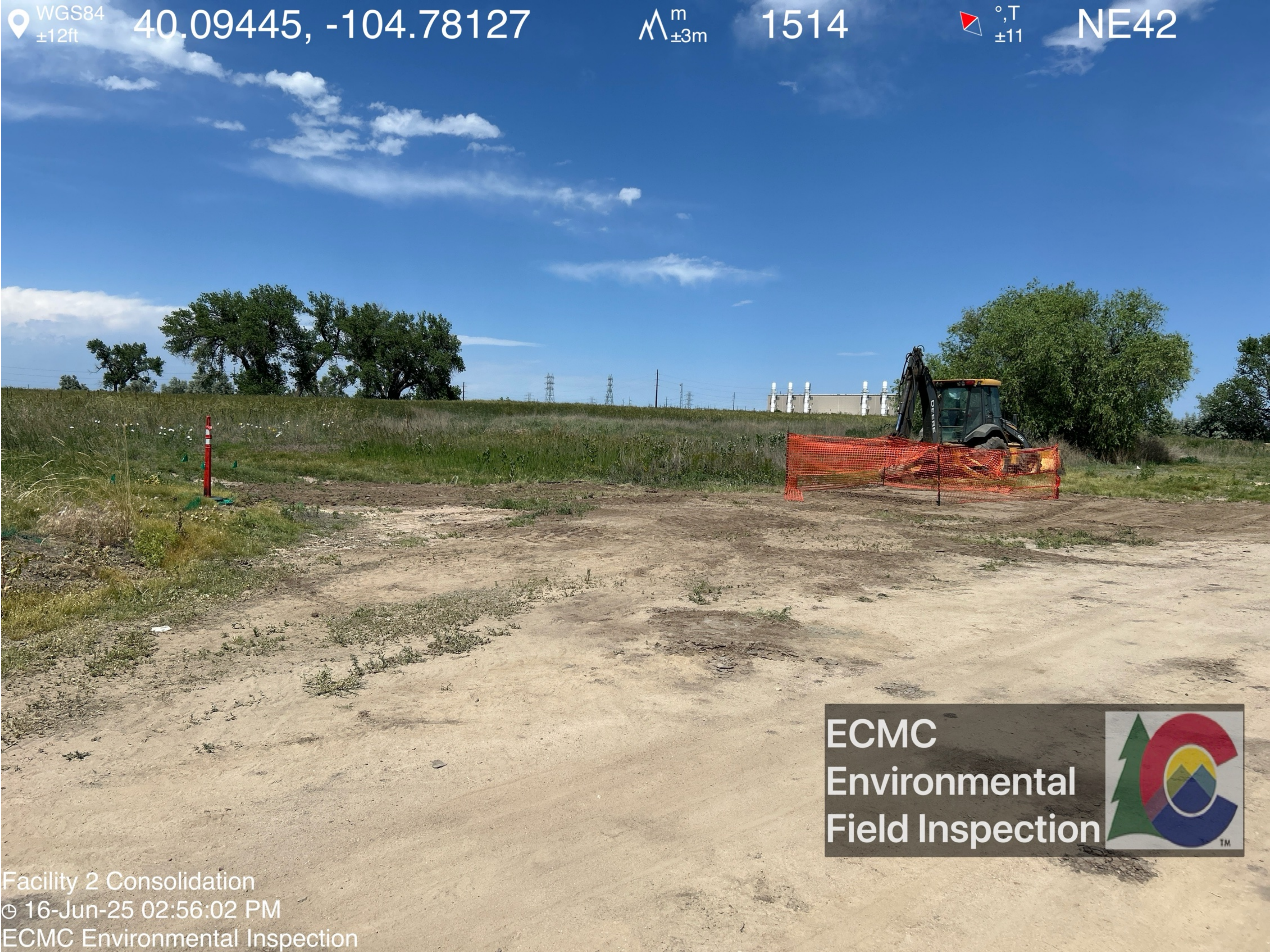
A scarped area with orange construction fencing and equipment is visible. No environmental impacts were visible on the surface in this area.