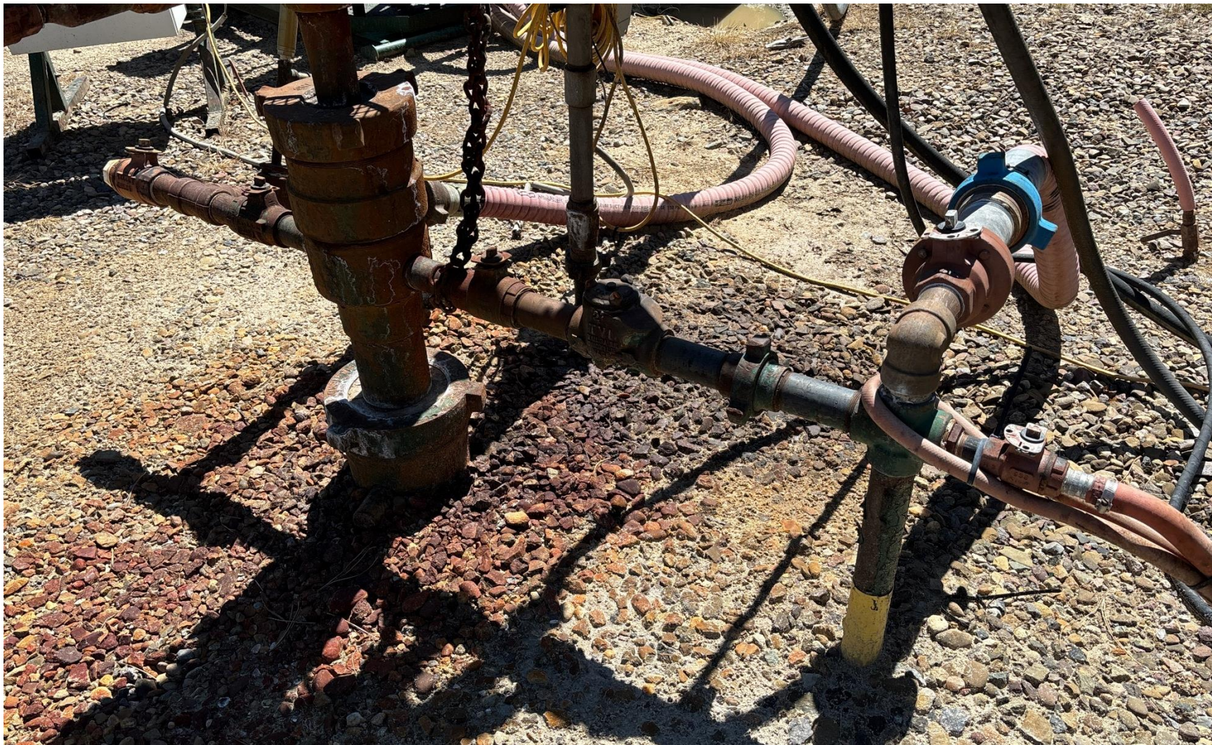
PHOTO 6: AREA OF IMPACTED SOIL AROUND WELLHEAD APPEARS TO BE FROM LEAKING DRIVEHEAD MOTOR SHOWN IN NEXT PHOTO. Conduct maintenance on equipment, cleanup stained material and review self inspection processes. COMPLY WITH RULE 1002,.(2).D. CA DATE 6-25-2025.