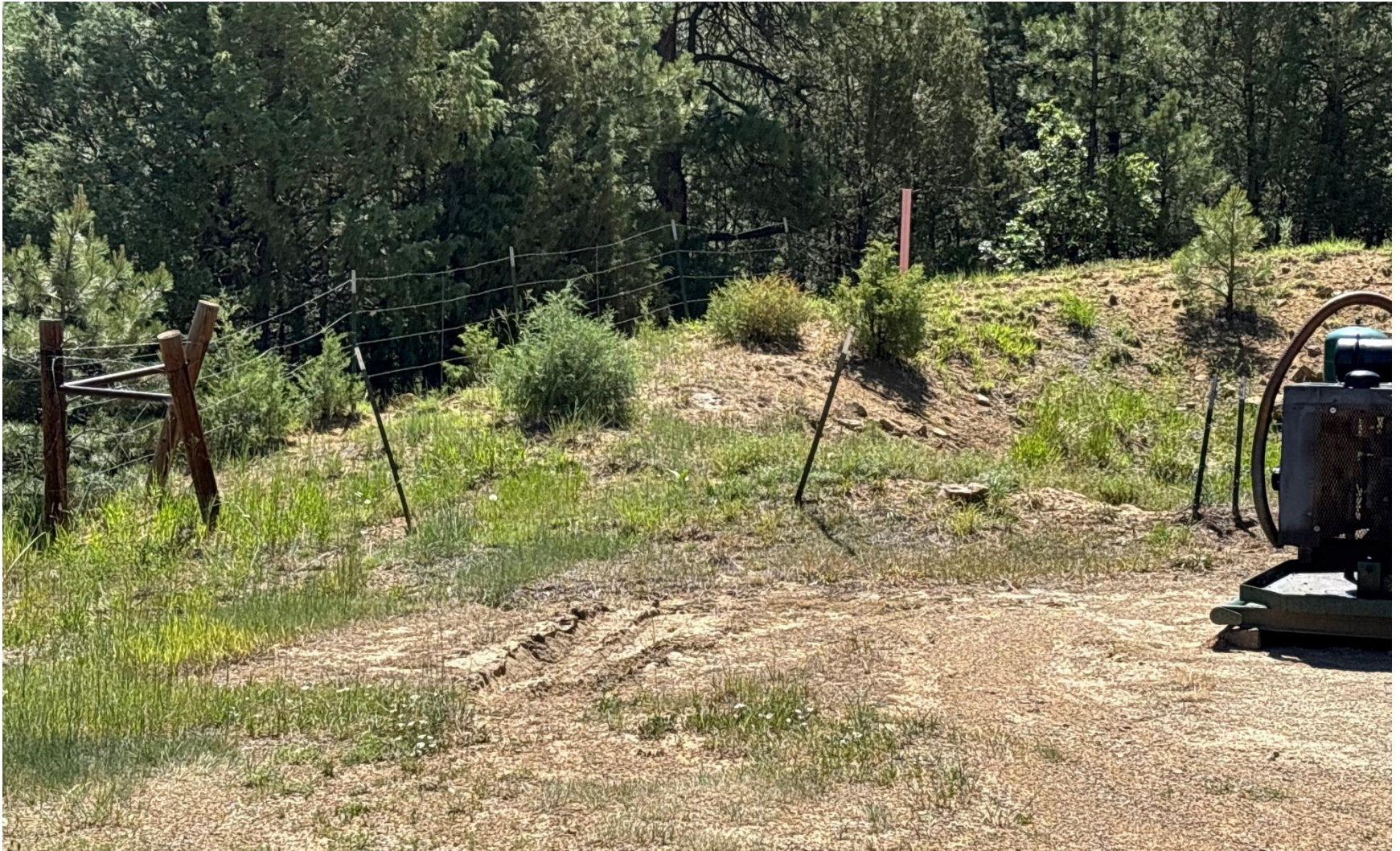
PHOTO 10: PART OF THE WIRES HAVE BEEN REMOVED FROM FENCE. REPAIR FENCE PER 1002 SERIES RULES. CA DATE 6-25-2025.