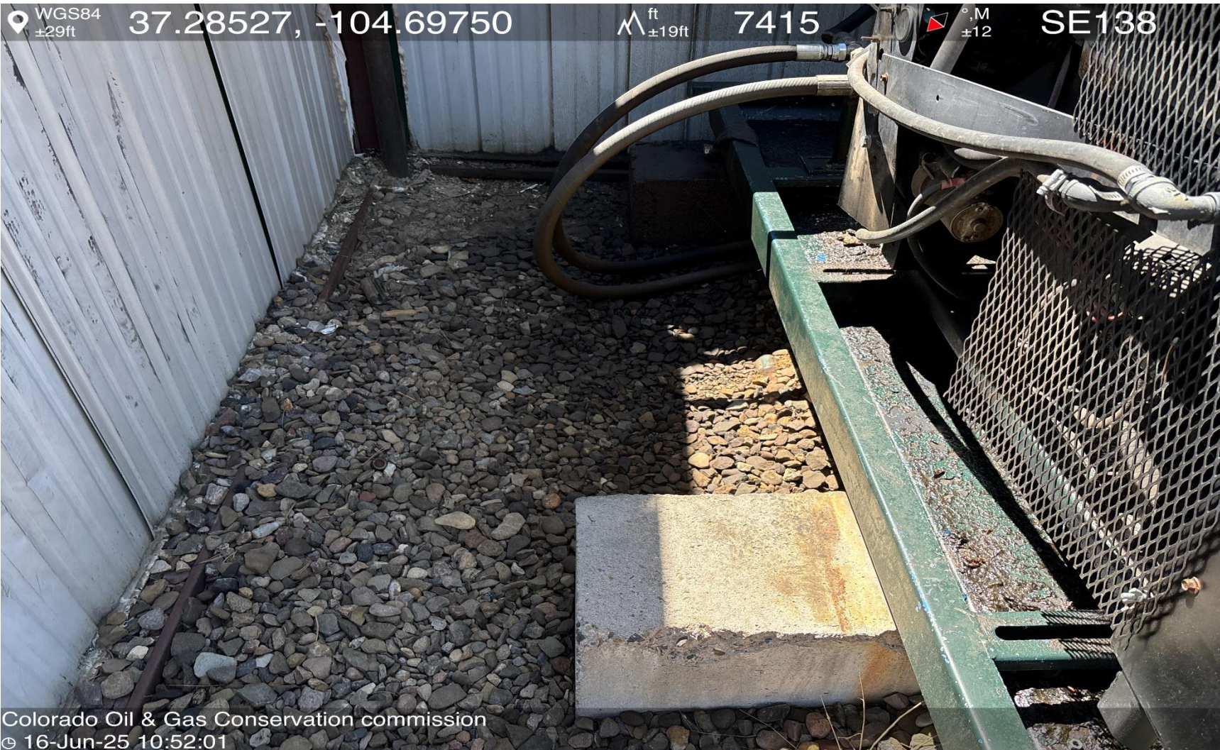
PHOTO 8: AREA OF IMPACTED SOIL AROUND PRIME MOVER ENGINE SKID (IMPACTED SOILS ON OTHER SIDES OF SKID ALSO). Conduct maintenance on equipment, cleanup stained material and review self inspection processes. COMPLY WITH RULE 1002,.(2).D. CA DATE 6-25-2025.