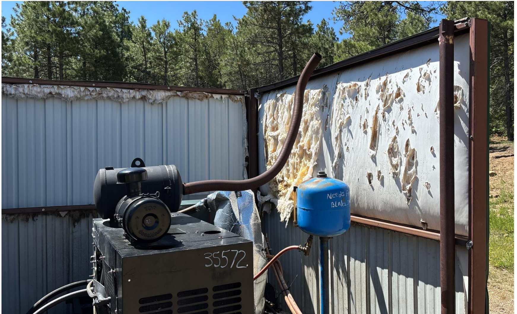
PHOTO 5: TRASH AND OR DEBREE (INSULATION ON SOUND WALLS IS DETERIORATING AND SPREADING ON AND AROUND LOCATION). PICK UP ALL TRASH ON AND AROUND LOCATION AND SECURE OR REPLACE INSULATION PER RULE 606. CA DATE 6-25-2025.