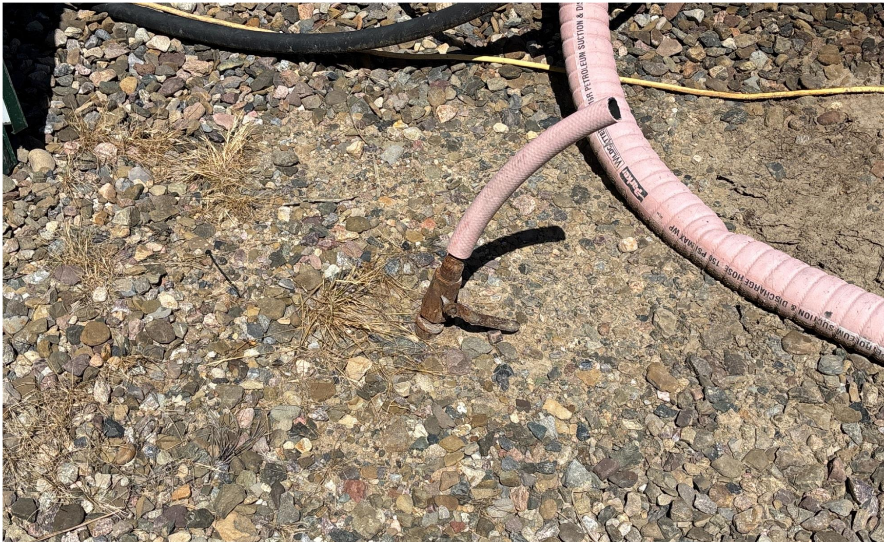
PHOTO 4: UNUSED EQUIPMENT (1" RISER NOT IN US AND NOT MARKED WHAT ITS USED FOR i.e. gas or water). USE, REMOVE OR LABEL RISER PER RULE 606. CA DATE 6-25-25.