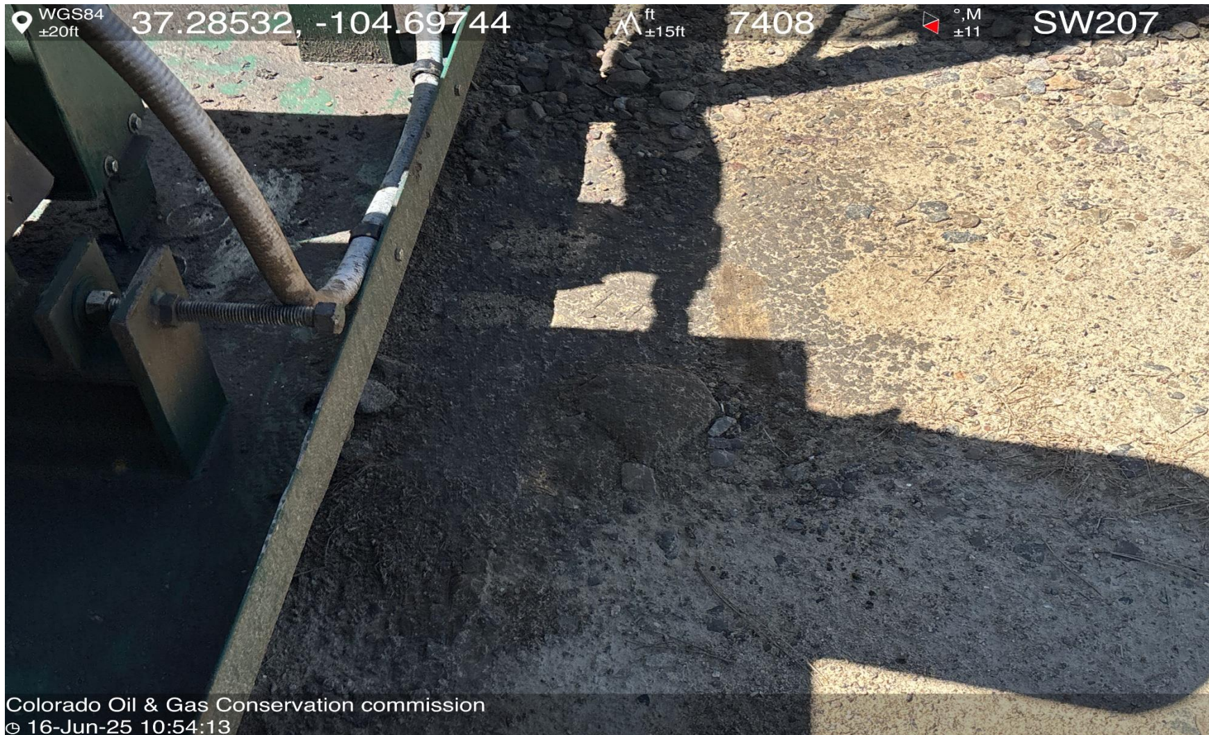
PHOTO 9: AREA OF IMPACTED SOIL AROUND COMPRESSOR SKID. Conduct maintenance on equipment, cleanup stained material and review self inspection processes. COMPLY WITH RULE 1002,(2).D. CA DATE 6-25-2025.