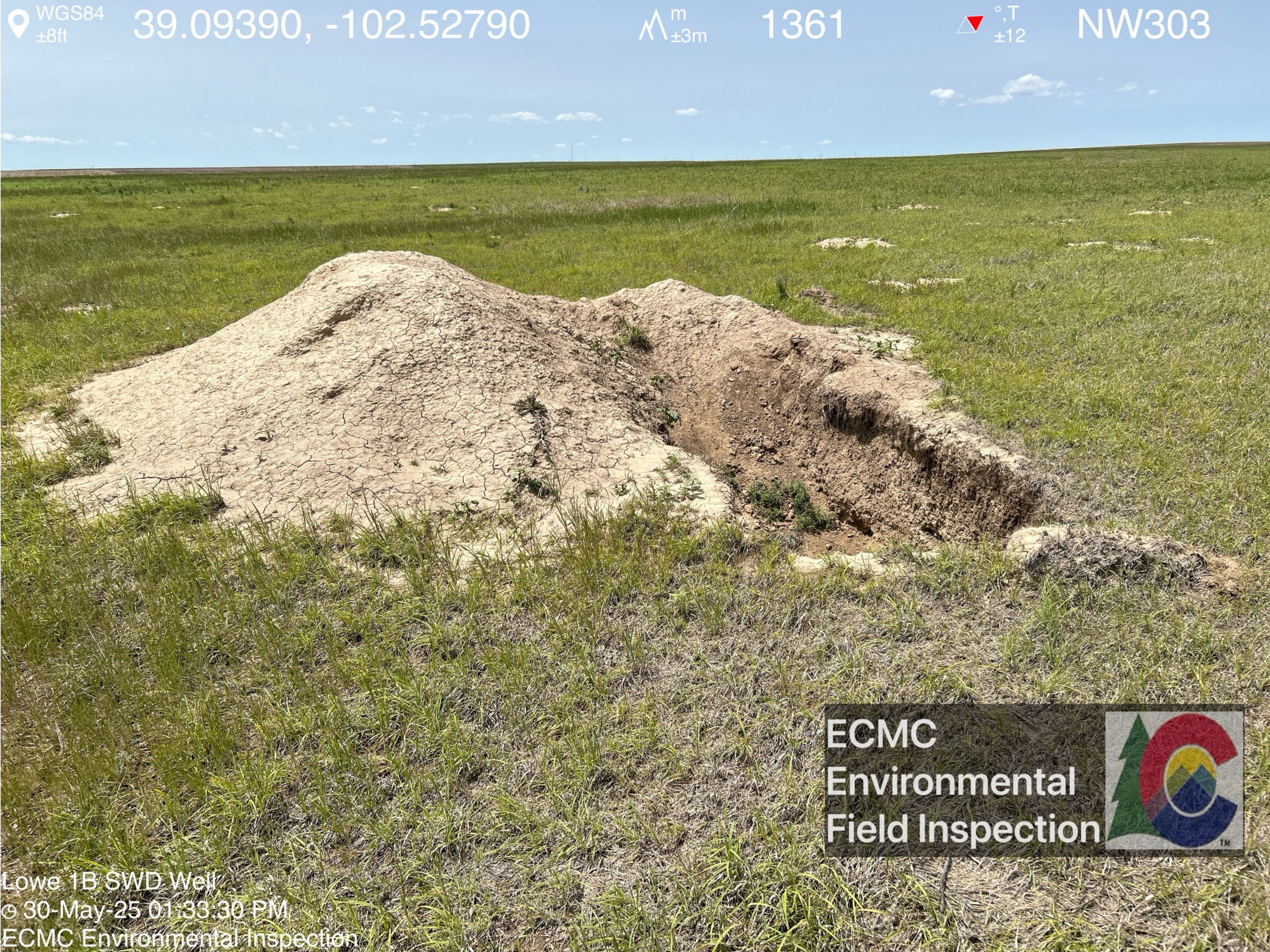
An unmarked soil stockpile and a small excavation are visible southeast of the former wellhead.