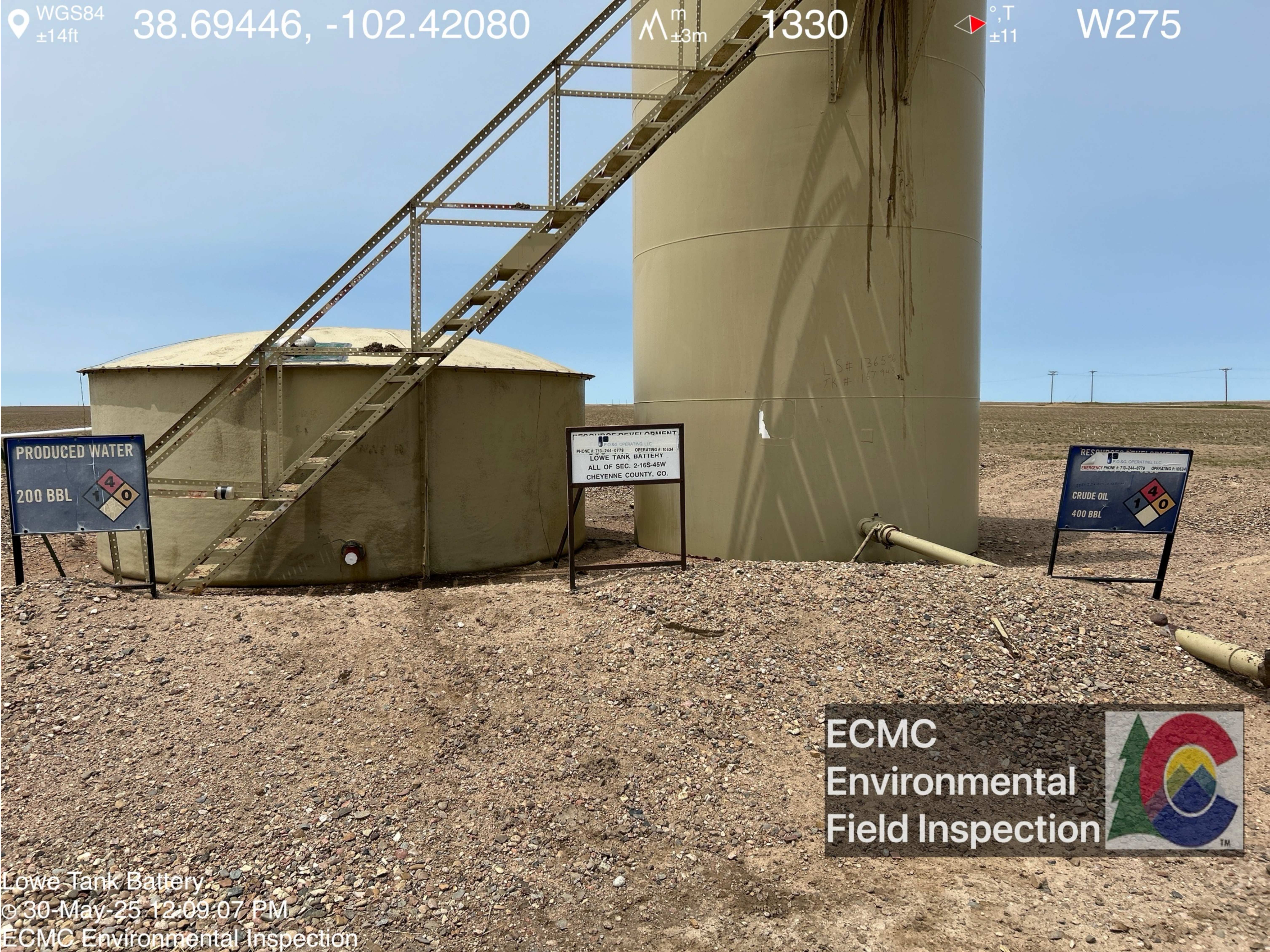
Signage with emergency contact number is visible. Labels/placards are legible.