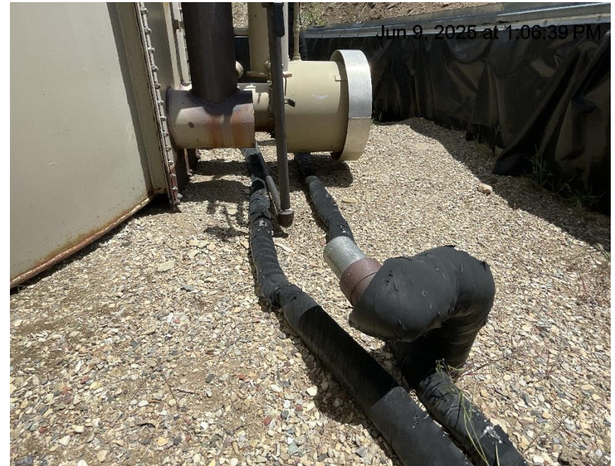
Photo # 7881 Unused flowline does not comply with CECMC 600 & 1100 series rules