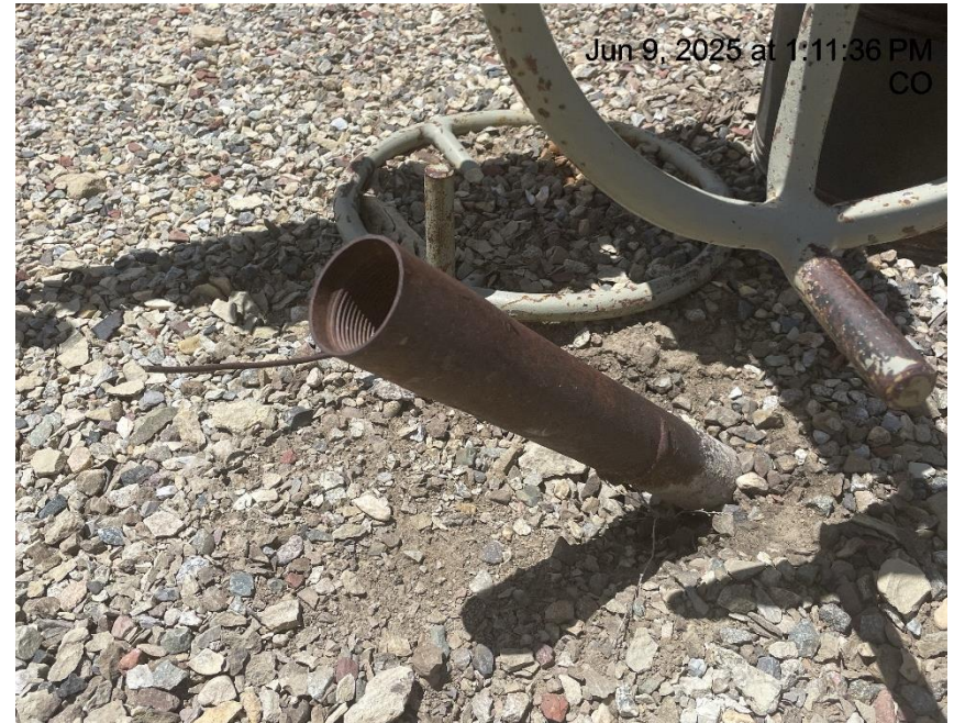
Photo # 7883 Possible unused flowline does not comply with CECMC 600 & 1100 series rules (Additionally open ended piping near the wellhead also constitutes a wildlife hazard)