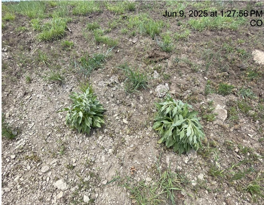
Photo # 7884 Hounds Tongue/undesirable plant species in the interim area