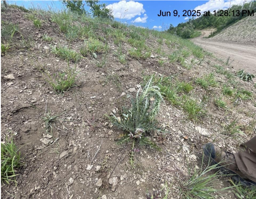
Photo # 7886 Plumbless Thistle/undesirable plant species in the interim area