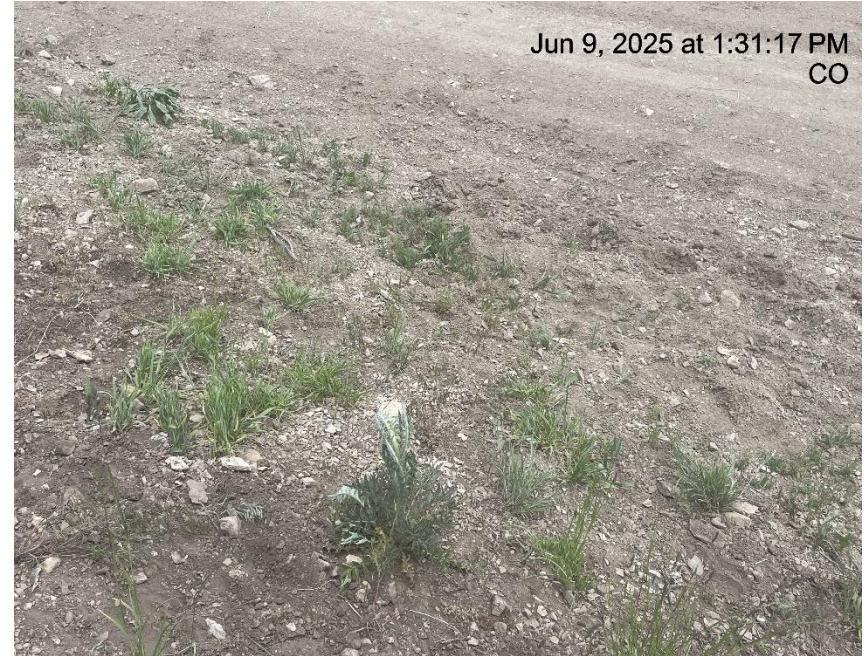
Photo # 7887 Plumbless Thistle/undesirable plant species in the interim area