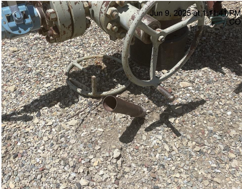
Photo # 7882 Possible unused flowline does not comply with CECMC 600 & 1100 series rules (Additionally open ended piping near the wellhead also constitutes a wildlife hazard)