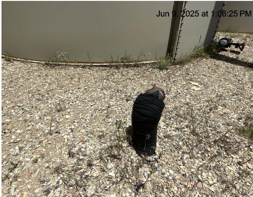
Photo # 7880 Unused flowline does not comply with CECMC 600 & 1100 series rules