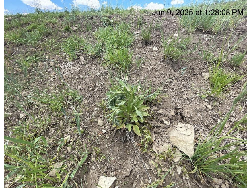
Photo # 7885 Hounds Tongue/undesirable plant species in the interim area