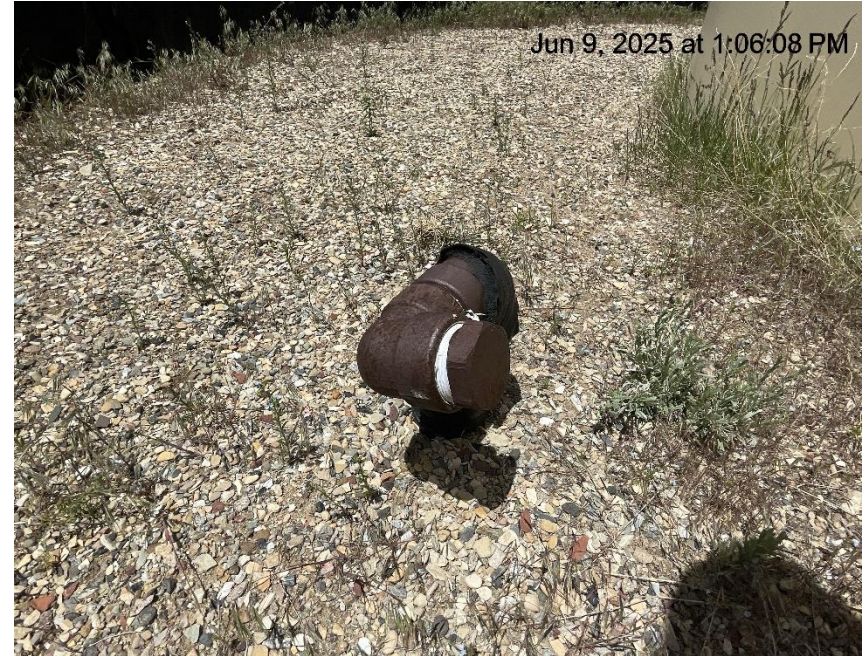
Photo # 7879 Unused flowline does not comply with CECMC 600 & 1100 series rules