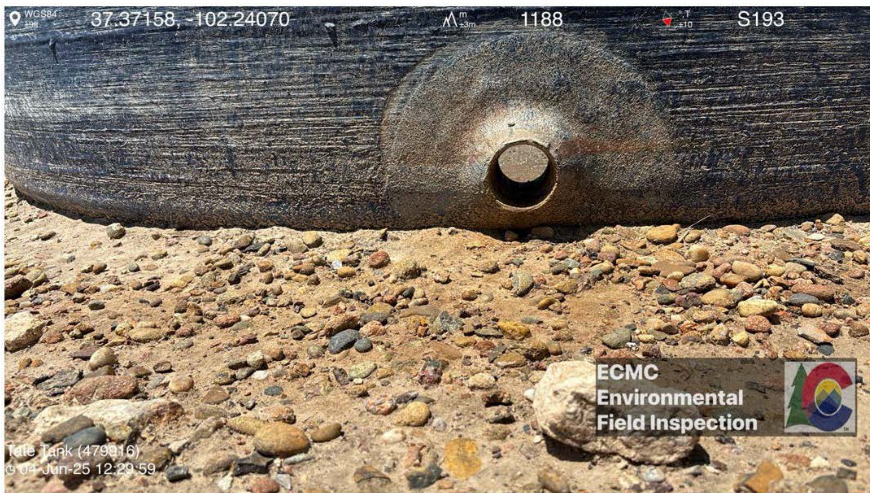
Stained soil adjacent to/down-gradient from open outlet/drain port, east side of ~100-bbl open top fiberglass produced water storage tank