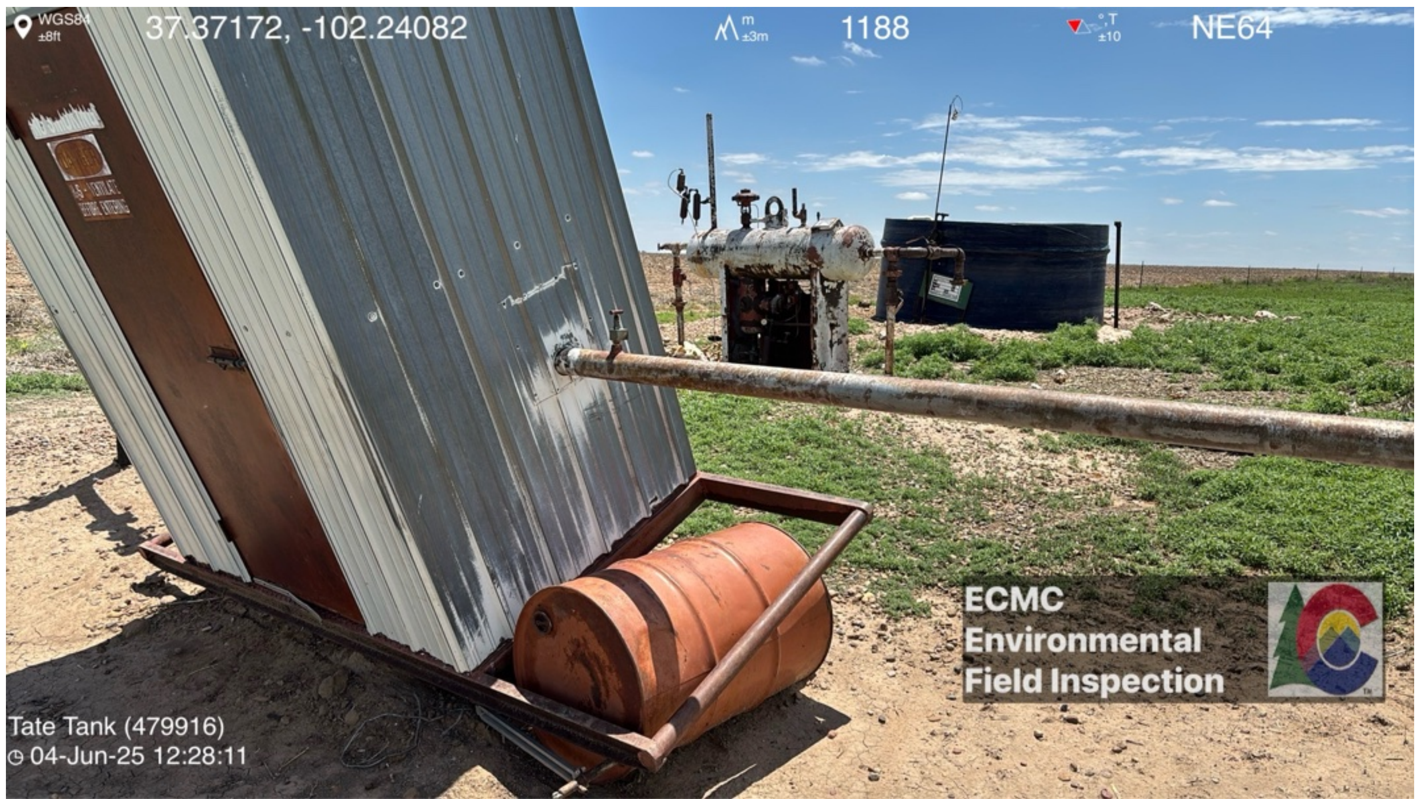
Unlabeled ~55-gallon steel drum without secondary containment/signage, weeds.