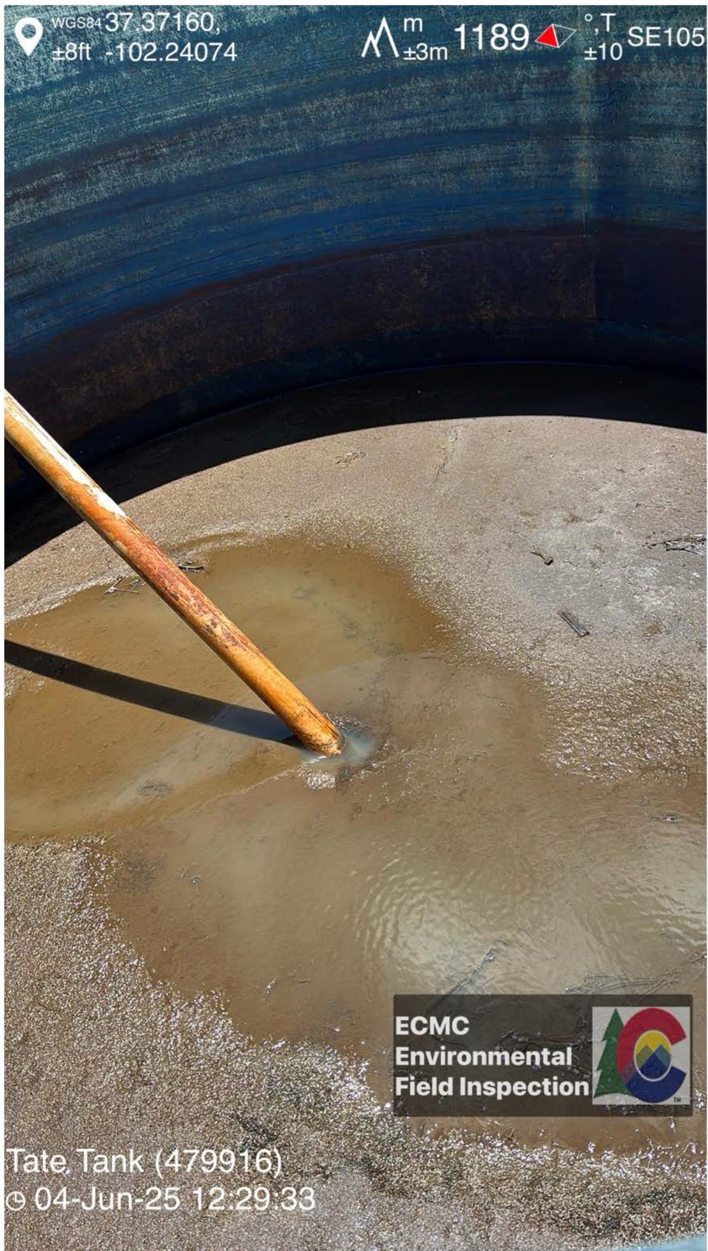
Liquid in base of the ~100-bbl open top fiberglass produced water storage tank.