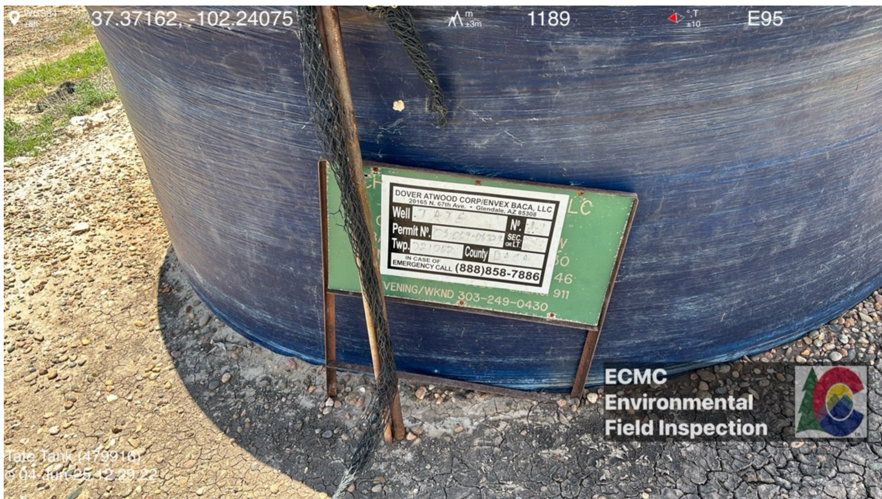
Signage faded and illegible from a distance, stained soil.