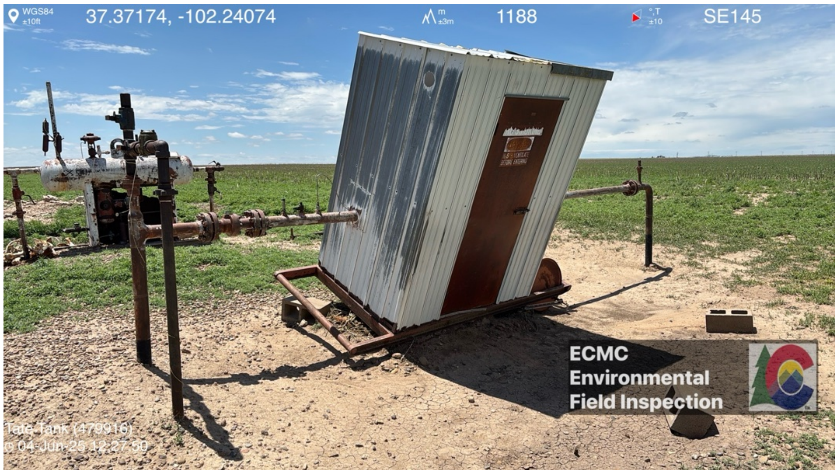
Meter shed not level/leaning, placards/signage faded and illegible.