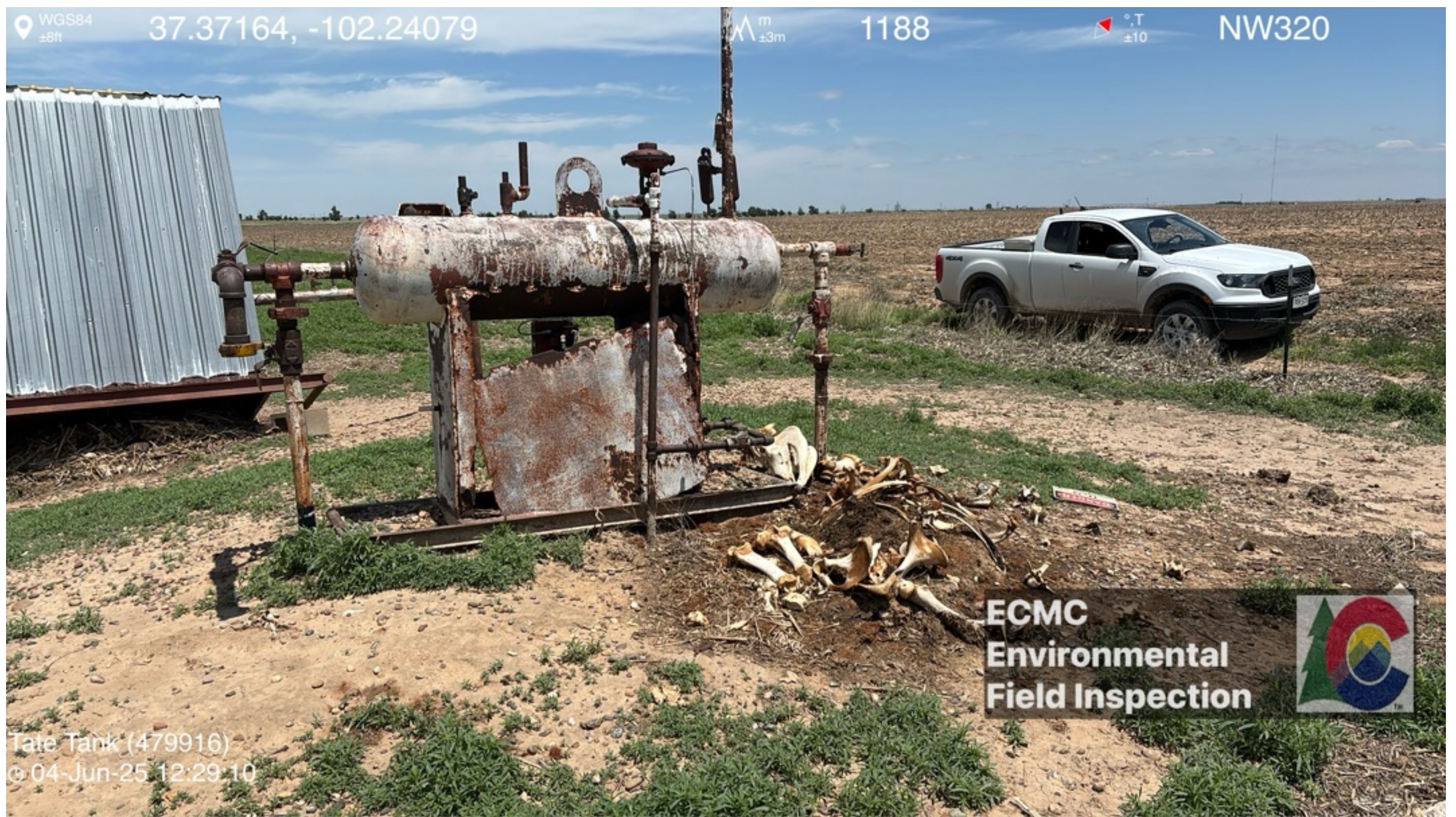
Cattle carcass, weeds, fallen signage.