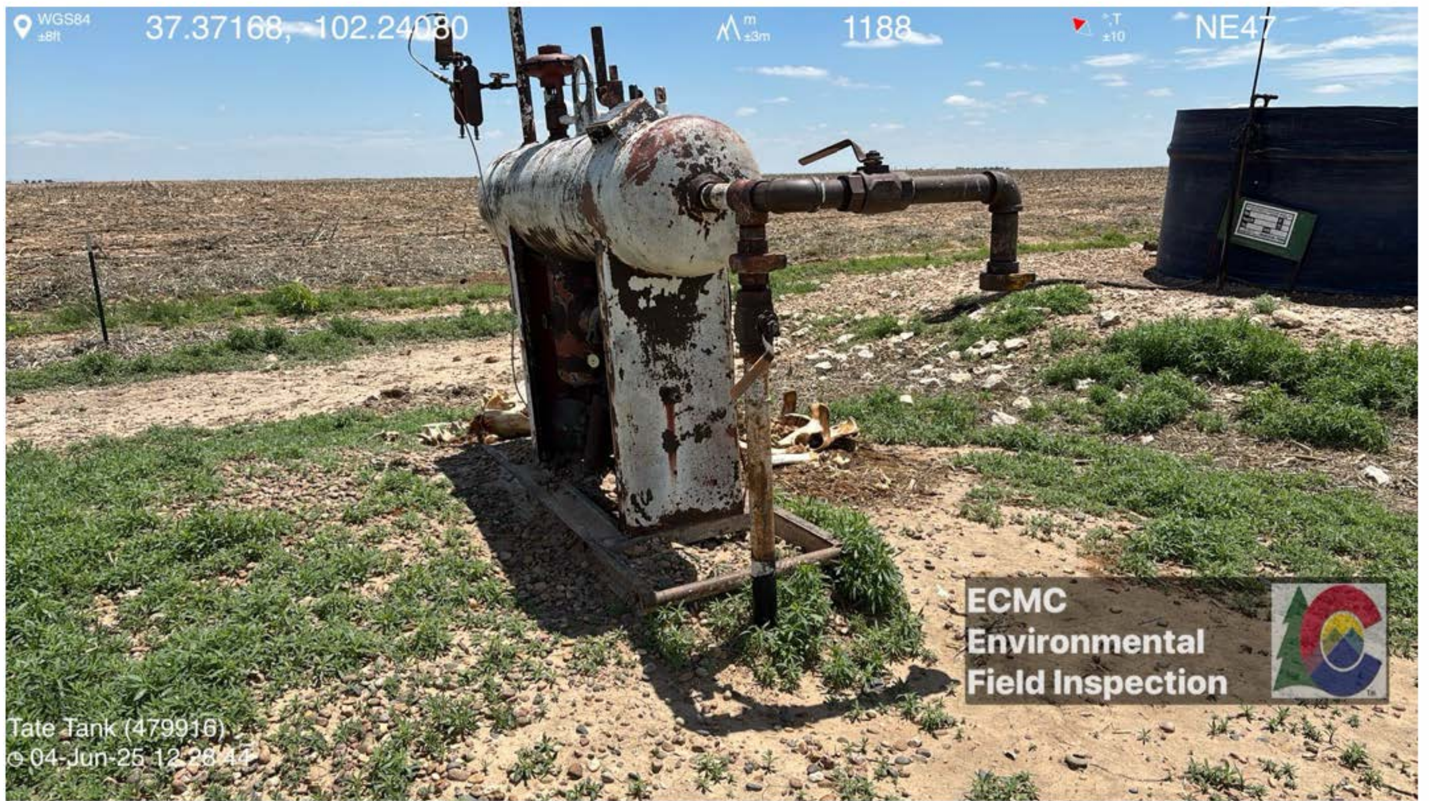
Separator, weeds, cattle carcass, inadequate secondary containment for produced water tank.