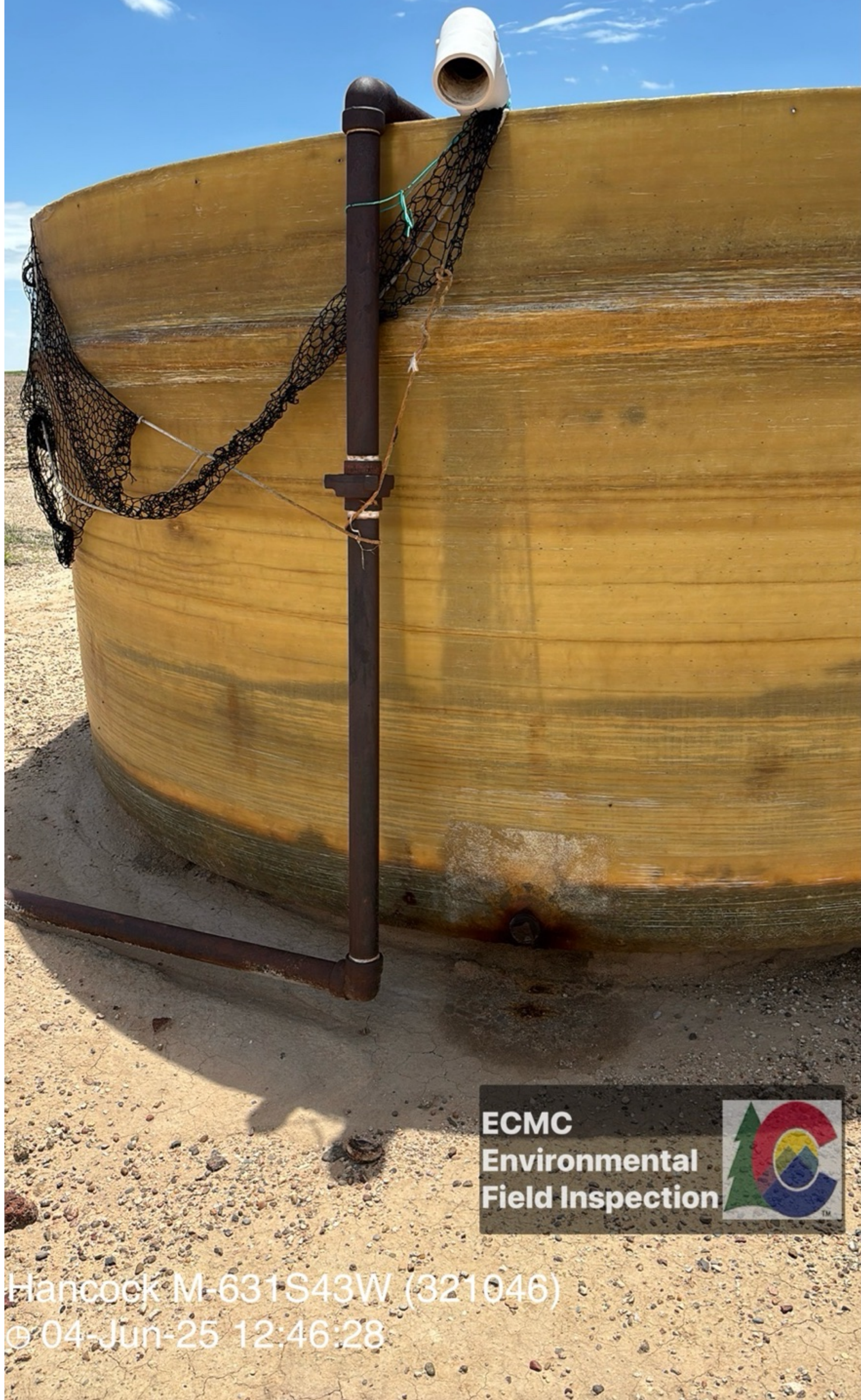
Stained soil observed beneath the bung installed on outlet/drain port on the ~100-bbl open top fiberglass produced water storage tank.

WGS84 37.36249, ±7ft -102.23854 1187 m ±3m °T ±11 SE147