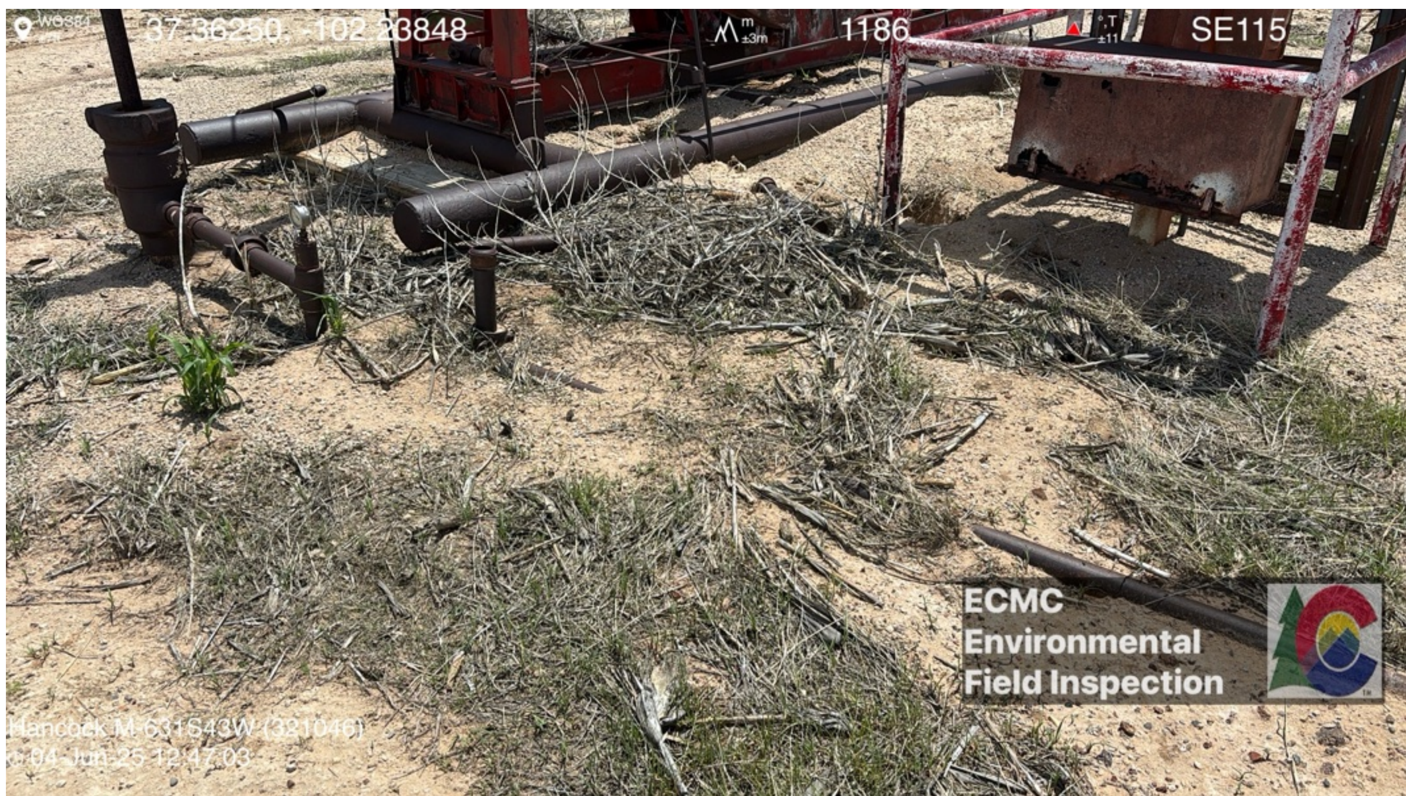
Weeds/debris observed next to wellhead and cathodic rectifier.