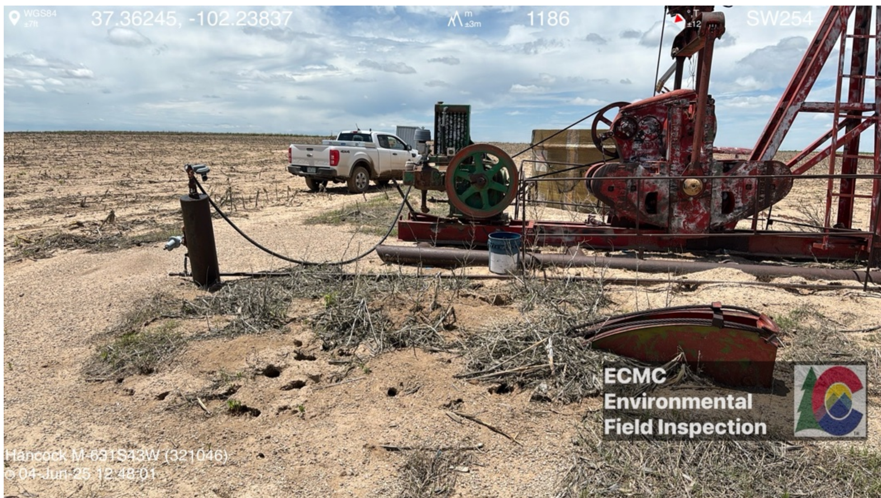
Weeds/debris/unused equipment observed next to welhead and cathodic rectifier.