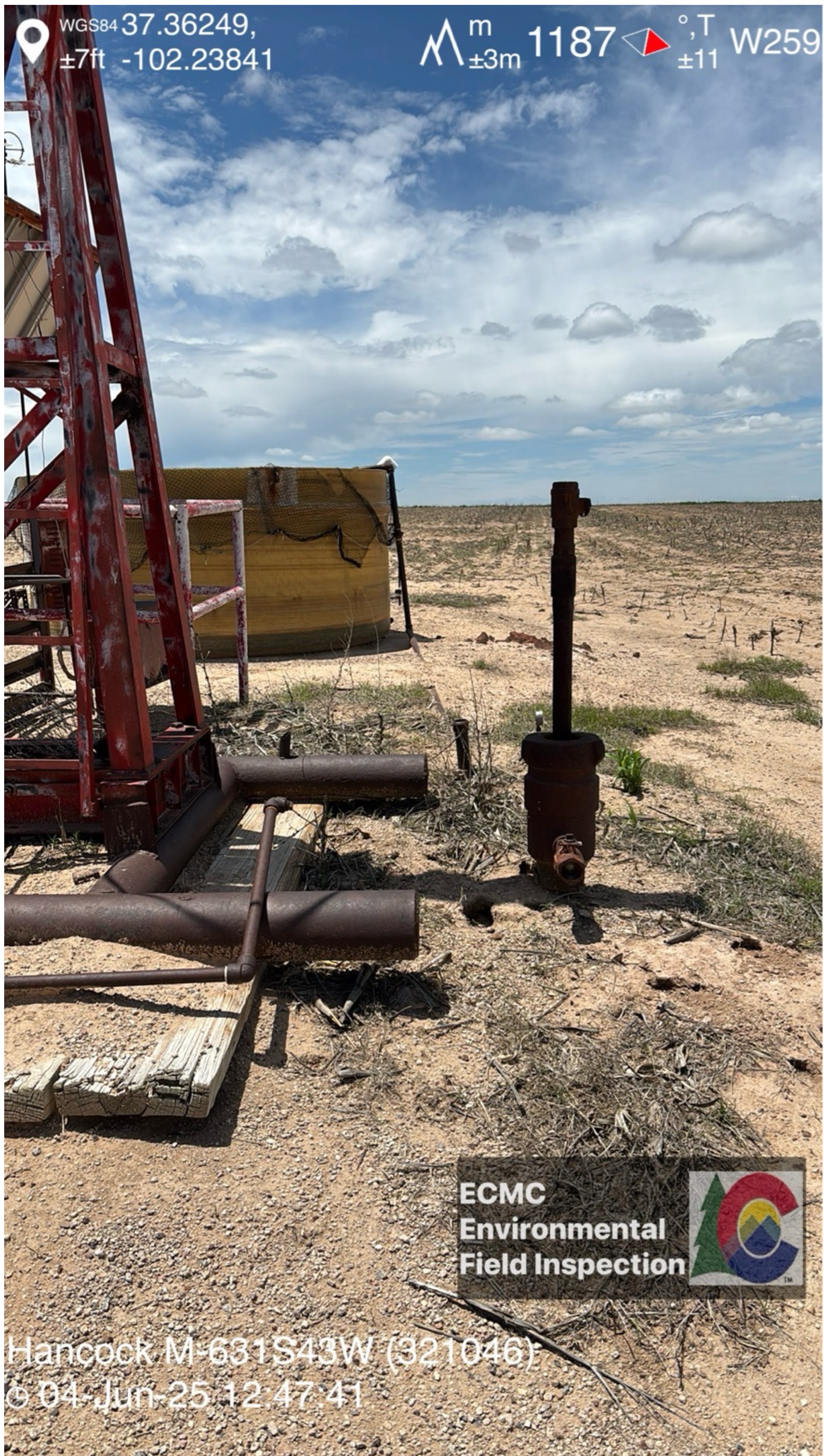
Weeds/debris observed next to welhead and cathodic rectifier.