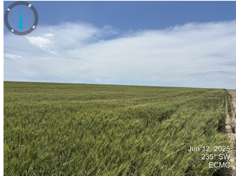
Photo 10. Reference cropland to the west of the well location.