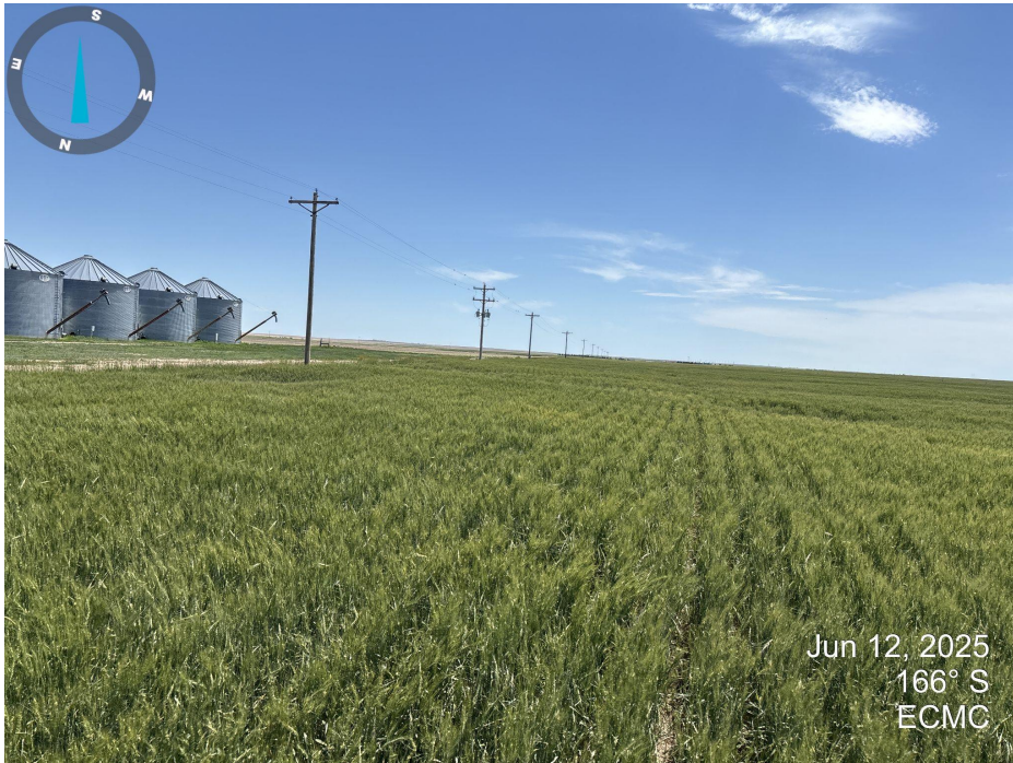
Photo 3. Looking from the south side of the tank battery down the former access road. Vegetation on the tank battery access road appears reflective of surrounding cropland.