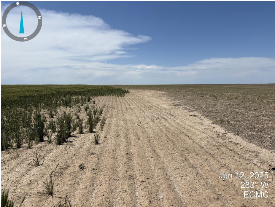
Photo 5. Looking west towards the well location. See photo 4 comments.