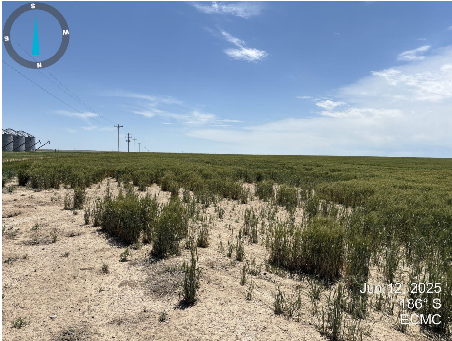
Photo 1. Looking south across the tank battery location. Bare patches and stunted crop growth is present on the former tank battery location.