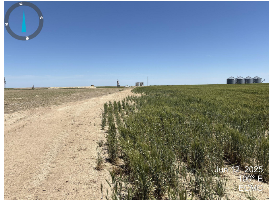
Photo 8. Looking east from the well location. See photo 6 comments.