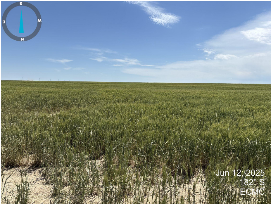
Photo 7. Looking south from the well location. See photo 6 comments.