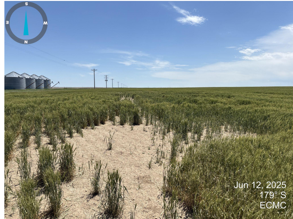
Photo 2. Looking south from the center of the tank battery location. Bare soil is present within active cropland.