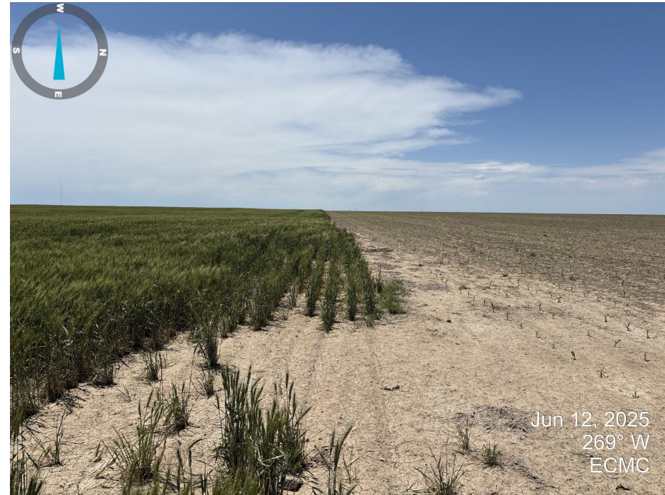
Photo 6. Looking west from the wellbore. No oil and gas equipment is present. Crop coverage is absent or stunted on the well location.