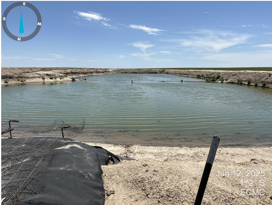
Photo 5. Looking south across the eastern produced water pit. The wall on this edge of pit is approximately 18" above water level.