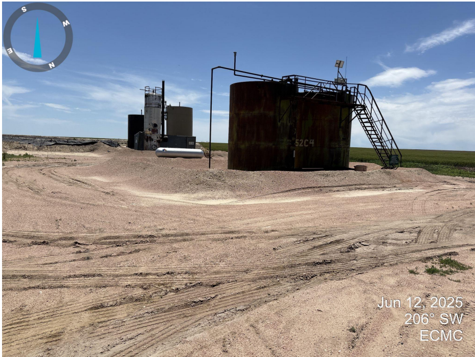
Photo 1. Looking south across tank battery.