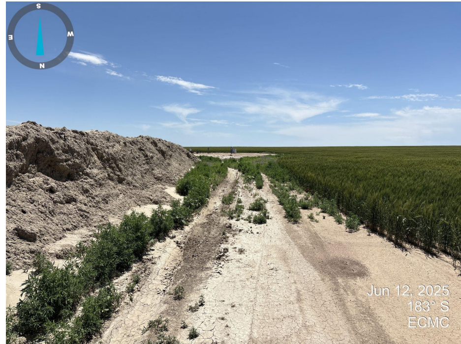
Photo 6. Looking south down access road to wellhead. Undesirable weed kochia is present.