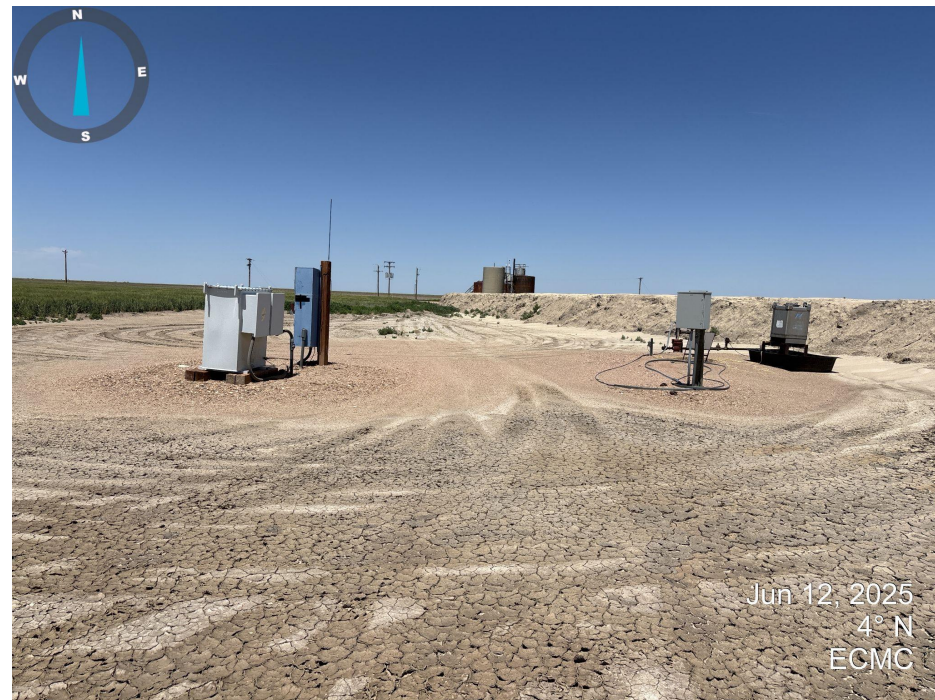
Photo 8. Looking north across wellhead area.