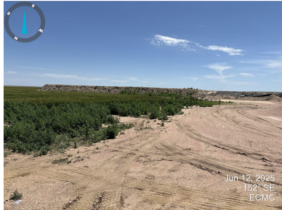
Photo 2. Looking south across the east side of tank battery towards produced water pit. Undesirable weed kochia is present at location. Location is surrounded by active cropland.