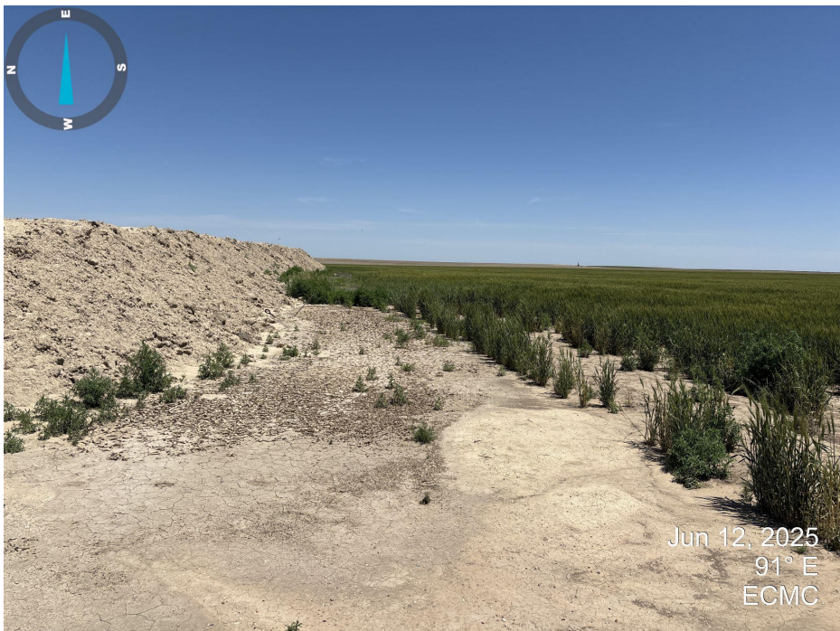
Photo 9. Looking east along the south side of the location. Location is surrounded by cropland.