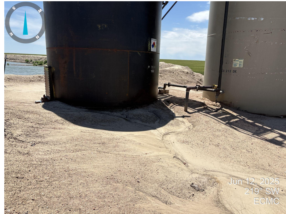
Photo 4. Picture taken at tank behind separator. Erosion is beginning to wash out underneath the north edge of the tank.