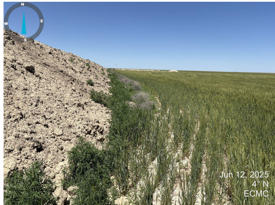
Photo 10. Looking north along the east side of location. See photo 9 comments.