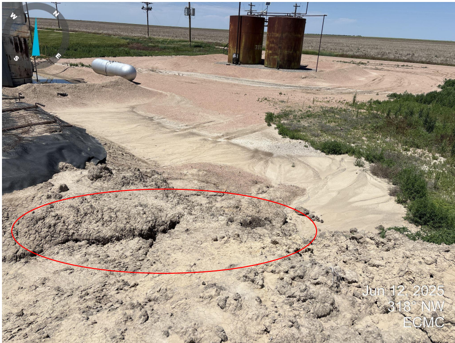
Photo 3. Picture taken near skim pit looking northwest. Gully erosion is present between produced water pit and skim pit (red circle).