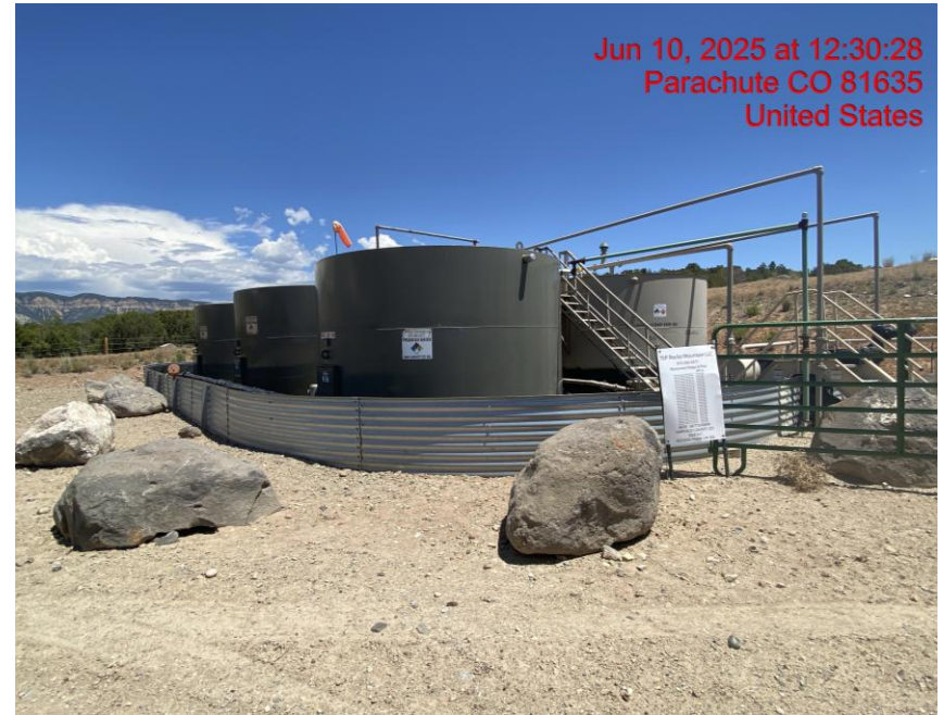
Location – Photo #09216