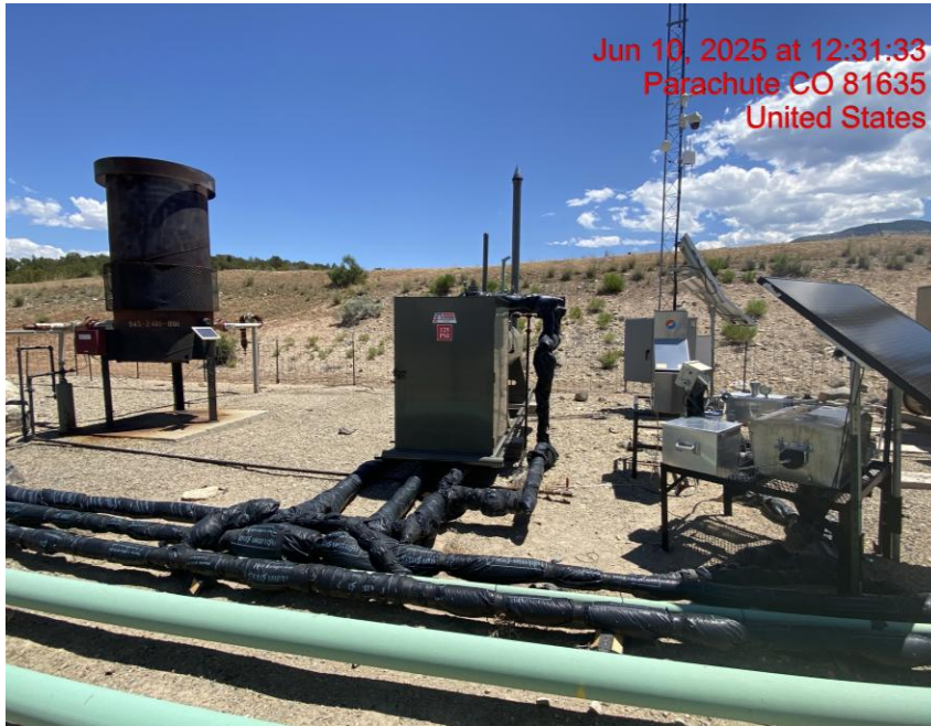
Location – Photo #09218