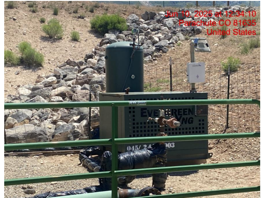
Location – Photo #09221