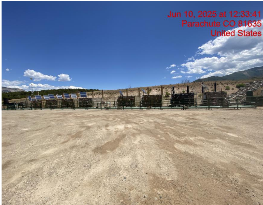
Location – Photo #09220