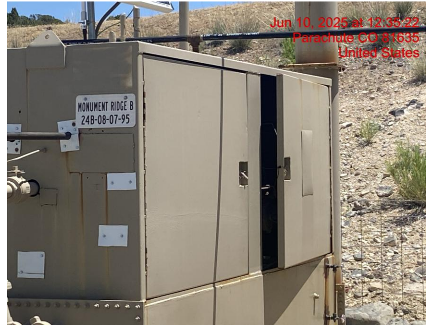
Wildlife Entry Hazard – Photo #09222