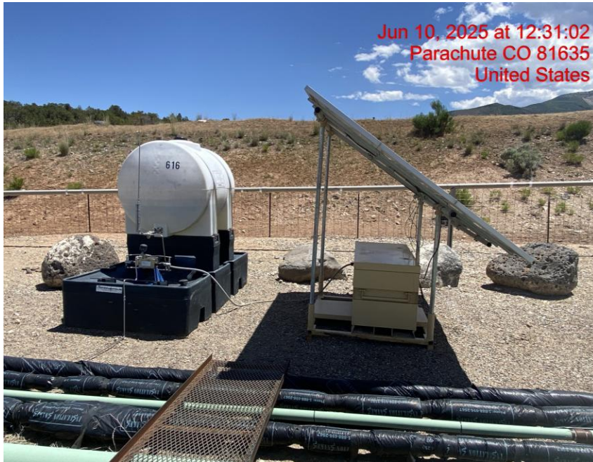
Location – Photo #09217