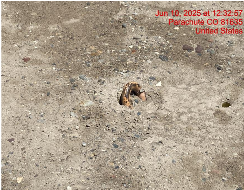
Unmarked Deadman – Photo #09219