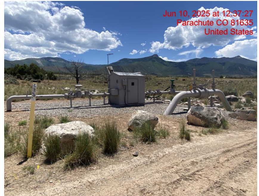
Location – Photo #09224