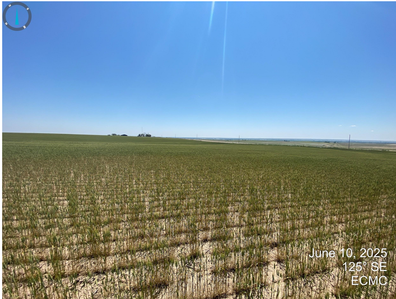
Photo 9. Photo of the adjacent reference area south of the former well location.