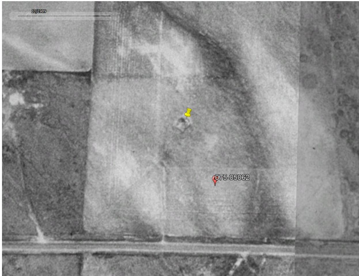
Photo 10. Google Earth historical aerial imagery (circa 10/1989) illustrating that the reported lat/long on the scout card for API 075-05062 (40.465150, -103.434530; red dot) differs from field observations and historical imagery, represented by the yellow pin (approx. 40.4658422, -103.4350519).