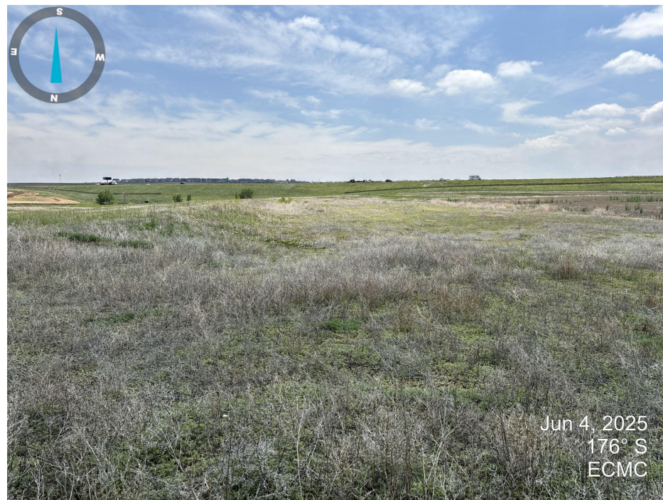
Photo 4. Looking south from the west side of wellbore location.