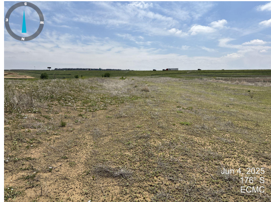
Photo 2. Looking from cogis location. The gps location appears to be incorrect. It appears that significant earthworks were conducted over the location.