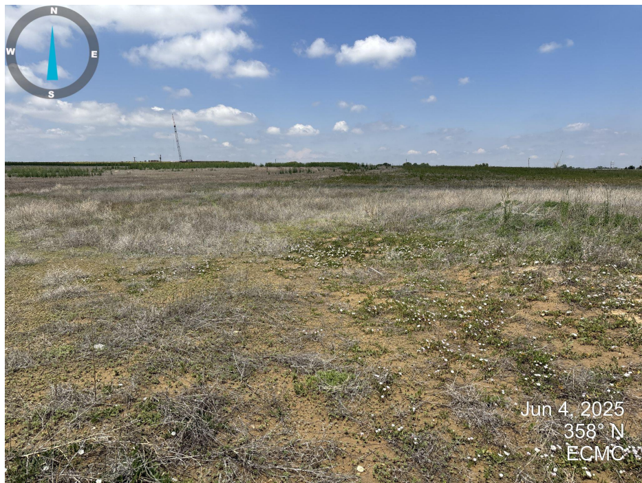
Photo 3. Looking north from the cogis location towards the actual location.