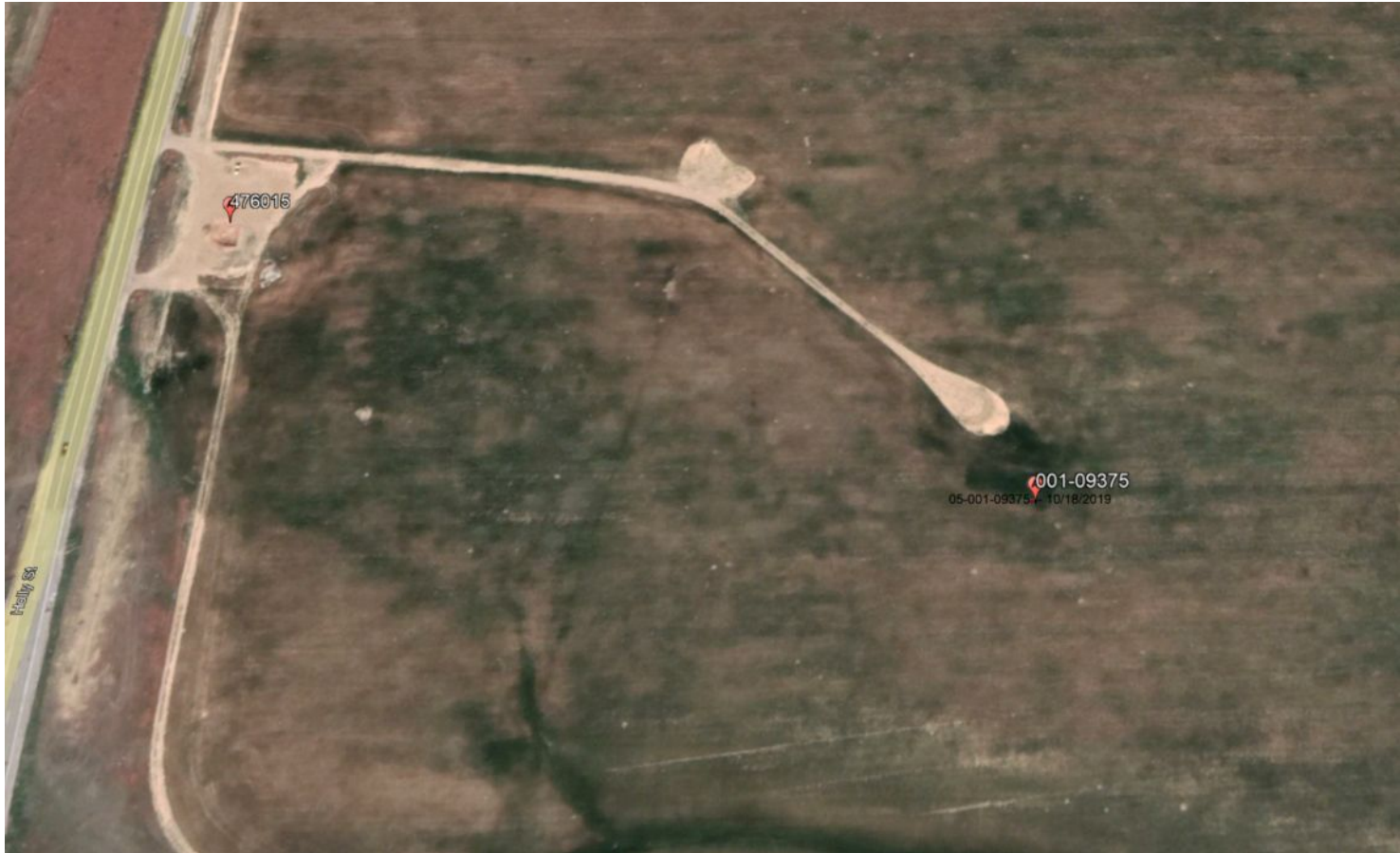
Photo 5. Google earth aerial photo taken 06/2020. Access road and well location are in cropland. GPS data of wellbore location appears to be 125 ft off from imagery.