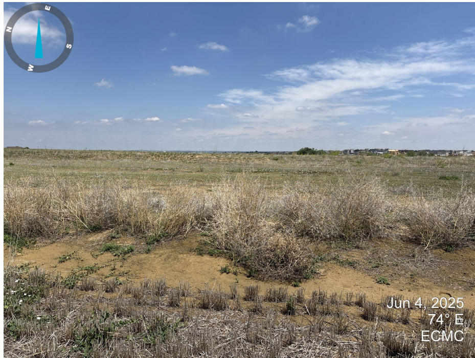
Photo 1. Looking east from fallow cropland across cogis location.