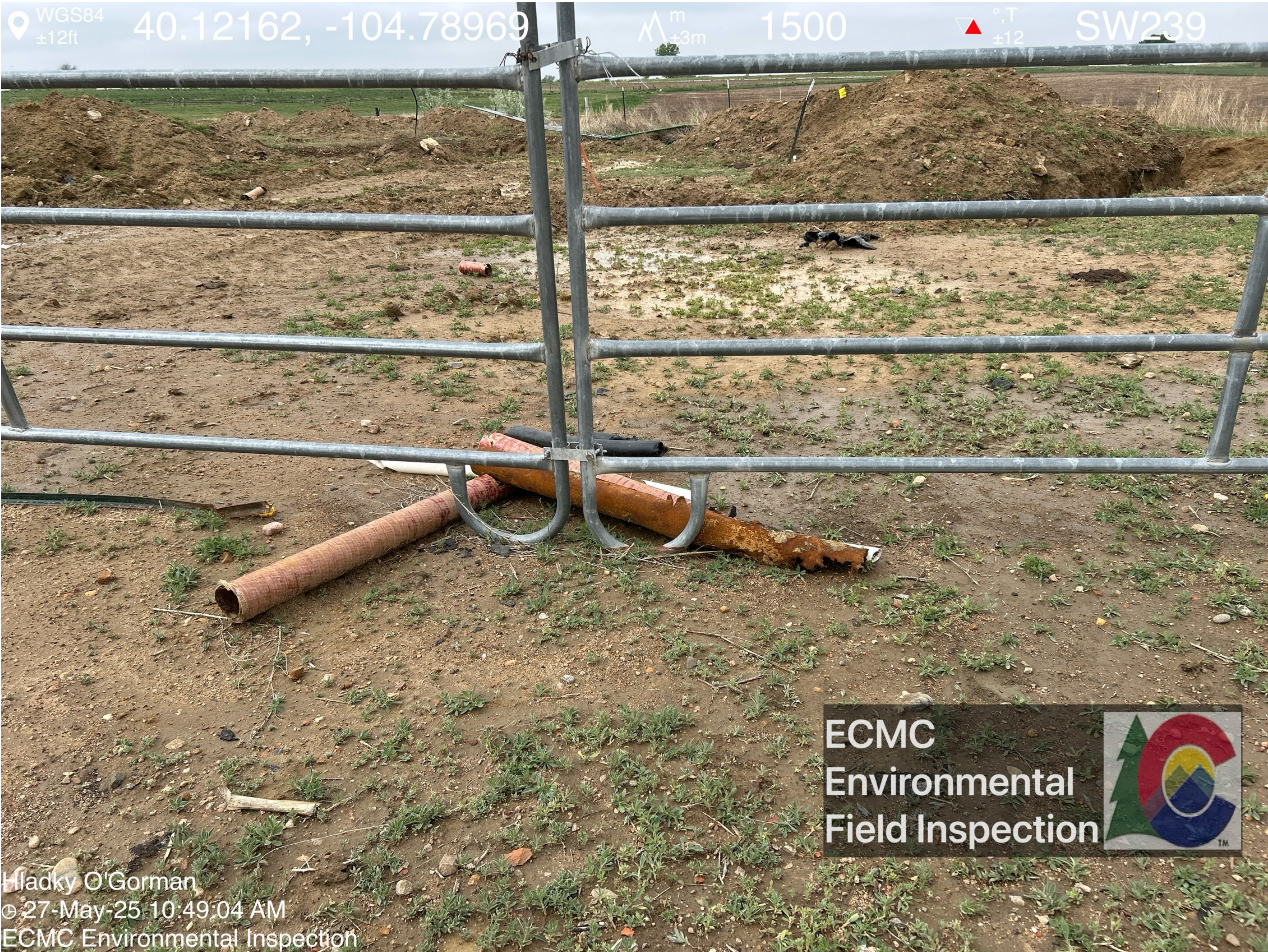
Trash (cans) and E&P waste (pieces of flowline) were visible on location.