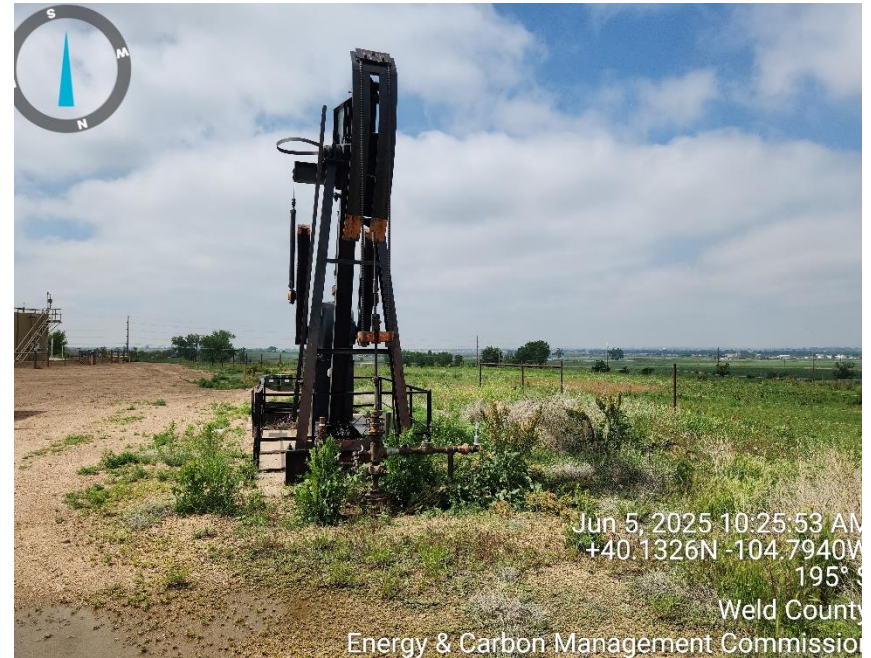
Photo 2 well head and equipment