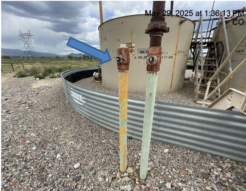
Photo # 4638 Unused flowline lacks lockout tagout (OOSLAT) /not in compliance with CECMC rules