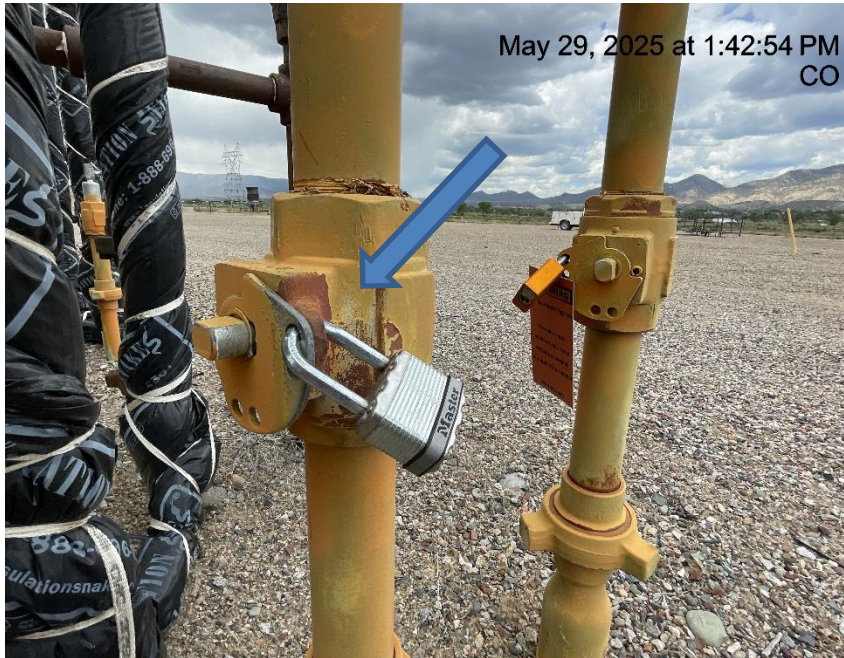
Photo # 4640 Unused flowline near separator locked but lacks required tag/not in compliance with CECMC rules