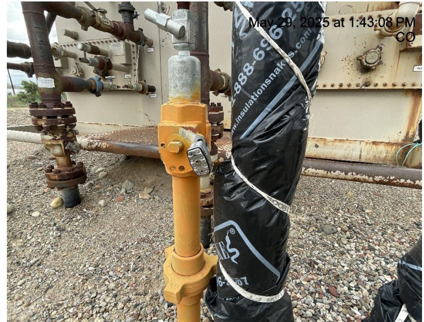
Photo # 4641 Unused flowline near separator locked but lacks required tag/not in compliance with CECMC rules