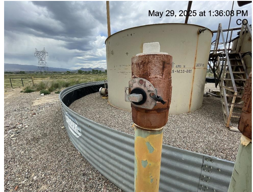
Photo # 4639 Unused flowline lacks lockout tagout (OOSLAT) /not in compliance with CECMC rules