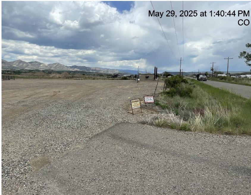
Photo # 4642 Emergency contact # on sign at entrance to location incorrect/# is disconnected & not in service