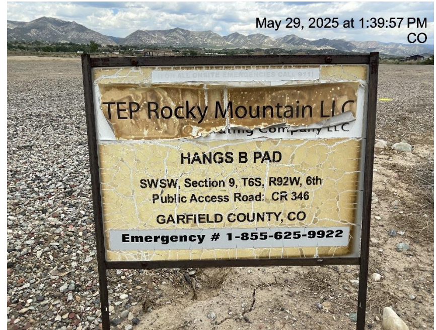
Photo # 4643 Emergency contact # on sign at entrance to location incorrect/# is disconnected & not in service