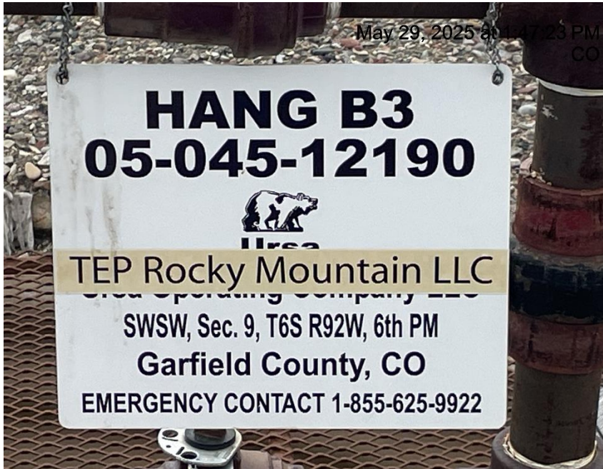
Photo # 4644 Emergency contact # on wellhead sign incorrect/# is disconnected & not in service