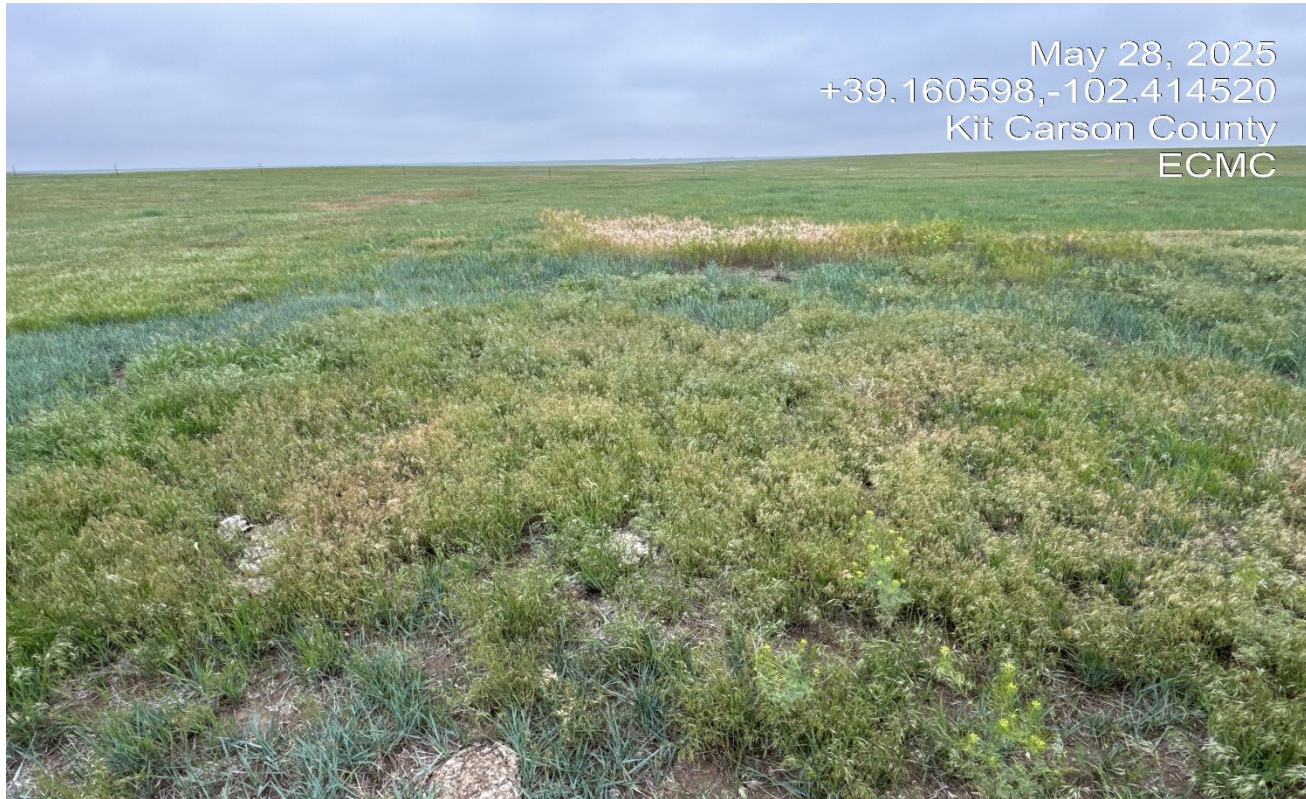
Photo 3. Center of the location facing north.