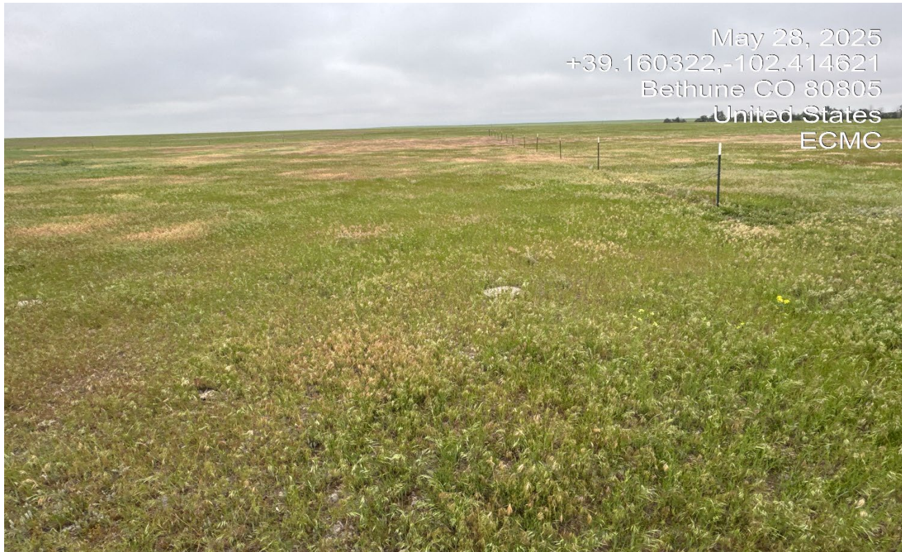
Photo 2. Facing east at the location . The perimeter fence remains around the location and is in disrepair.