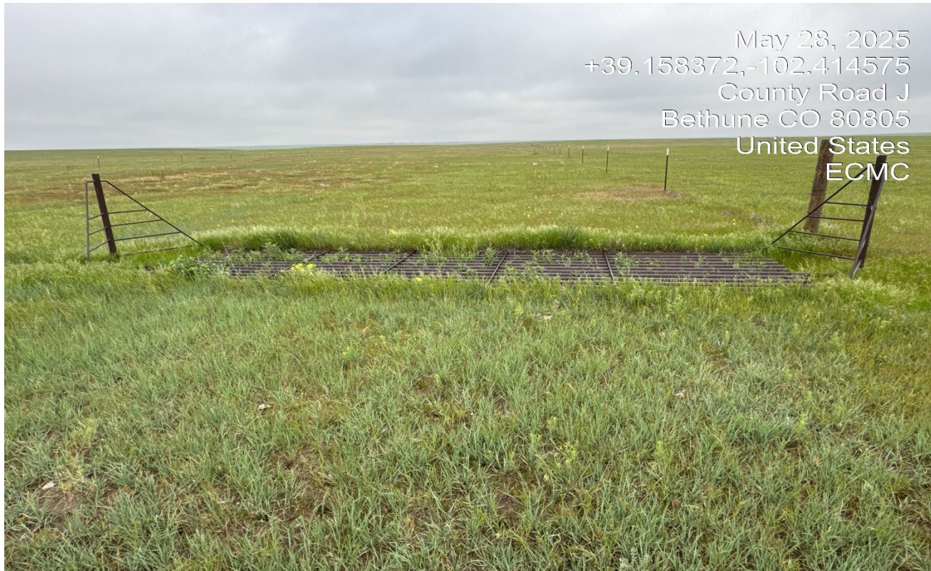
Photo 1. Facing north at the beginning of the former access road. The cattleguard and perimeter fence have not been removed.