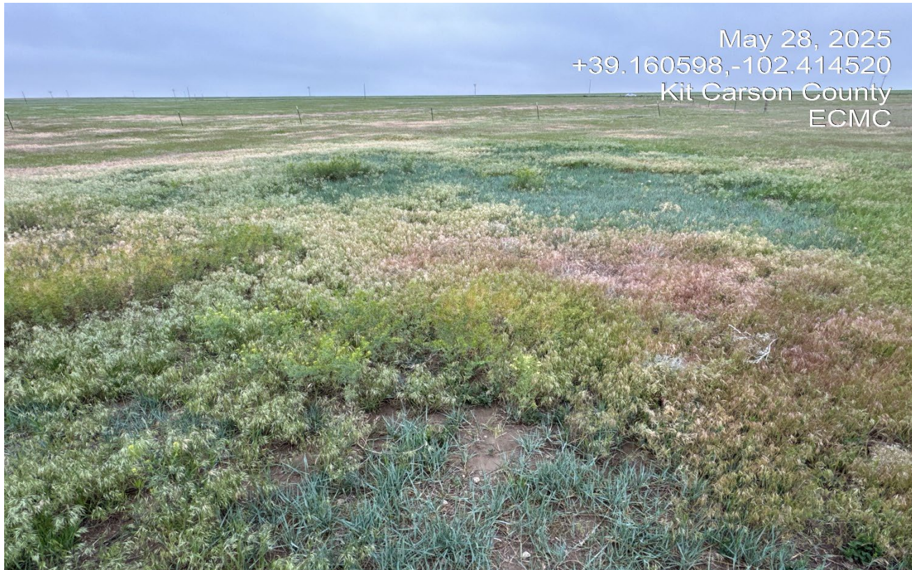
Photo 5. Center of the location facing south.