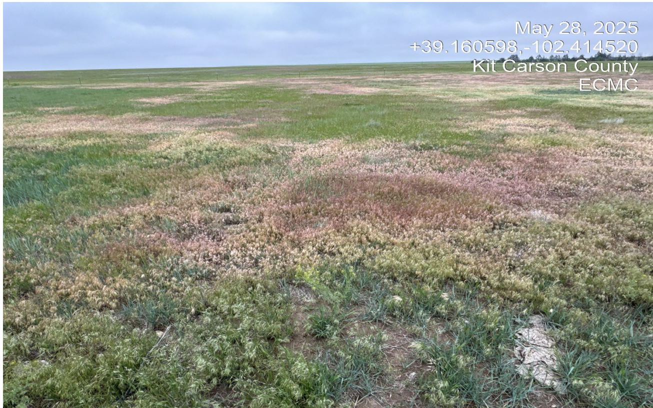
Photo 6. Center of the location facing east.