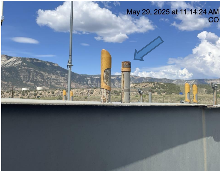
Photo # 4395 Rupture disc vent line does not comply with CECMC pressure safety device rules