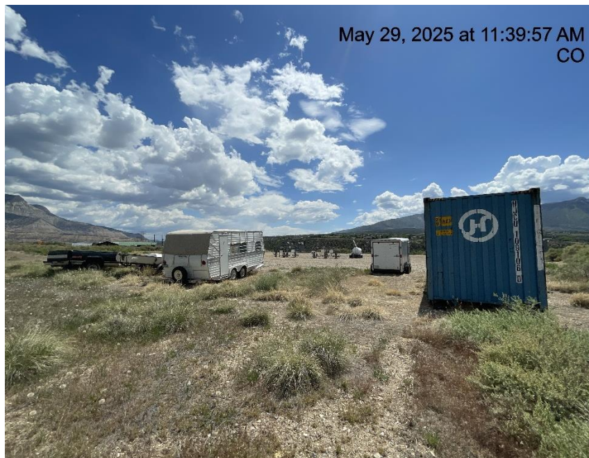
Photo # 4397 Stored shipping container, camper, trailer, boat & truck bed