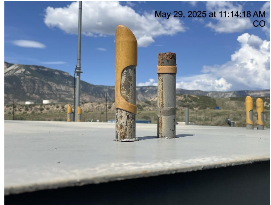
Photo # 4396 Rupture disc vent line does not comply with CECMC pressure safety device rules