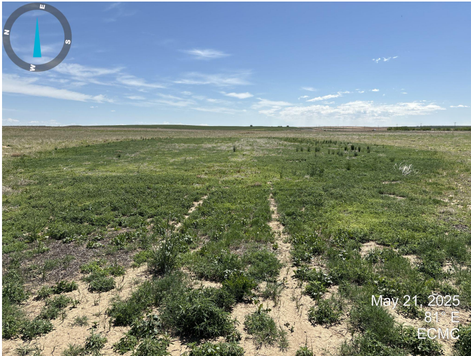
Photo 3. Looking east across the well location. Vegetation on location is primarily undesirable weedy vegetation russian thistle and kochia. Desirable vegetation establishment appears to be very poor across location.