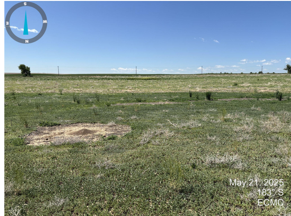
Photo 6. Looking south from the wellbore. See photo 3 comments.