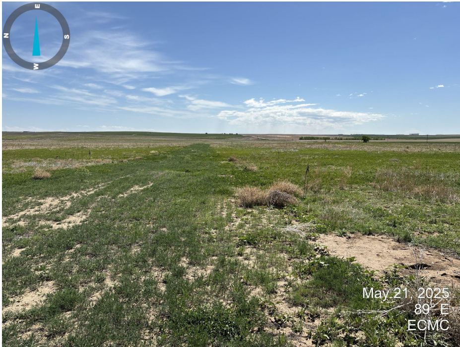
Photo 1. Looking east down the access road towards the well location. Access road vegetation is primarily undesirable weed russian thistle and list C noxious weed field bindweed. Little to no desirable vegetation is present on the access road.