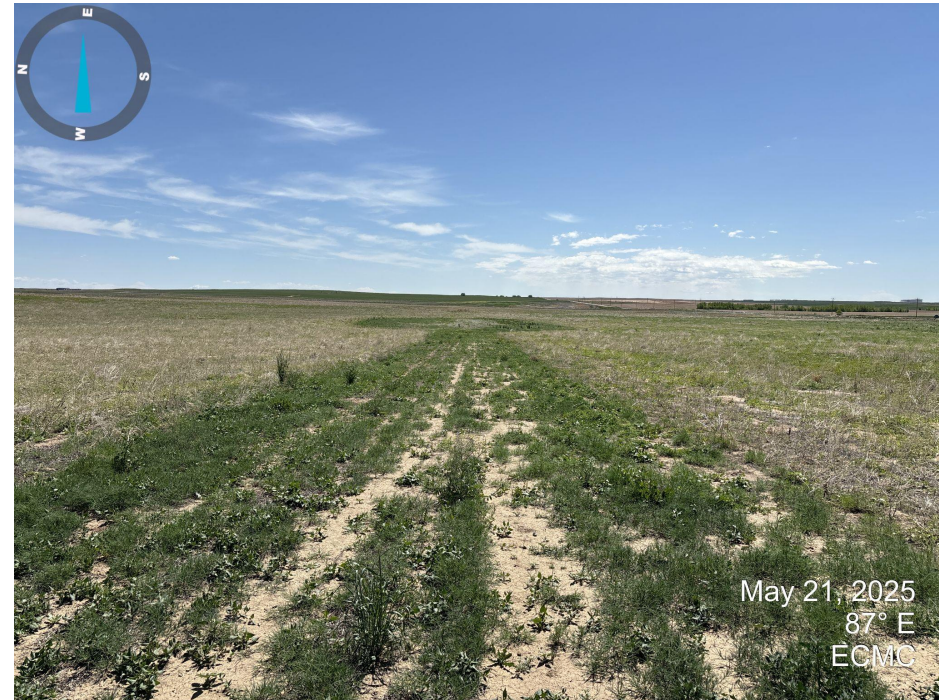
Photo 2. Photo taken at midpoint of access road looking east. Illustrating undesirable weedy vegetation coverage and difference in vegetation compared to reference area.