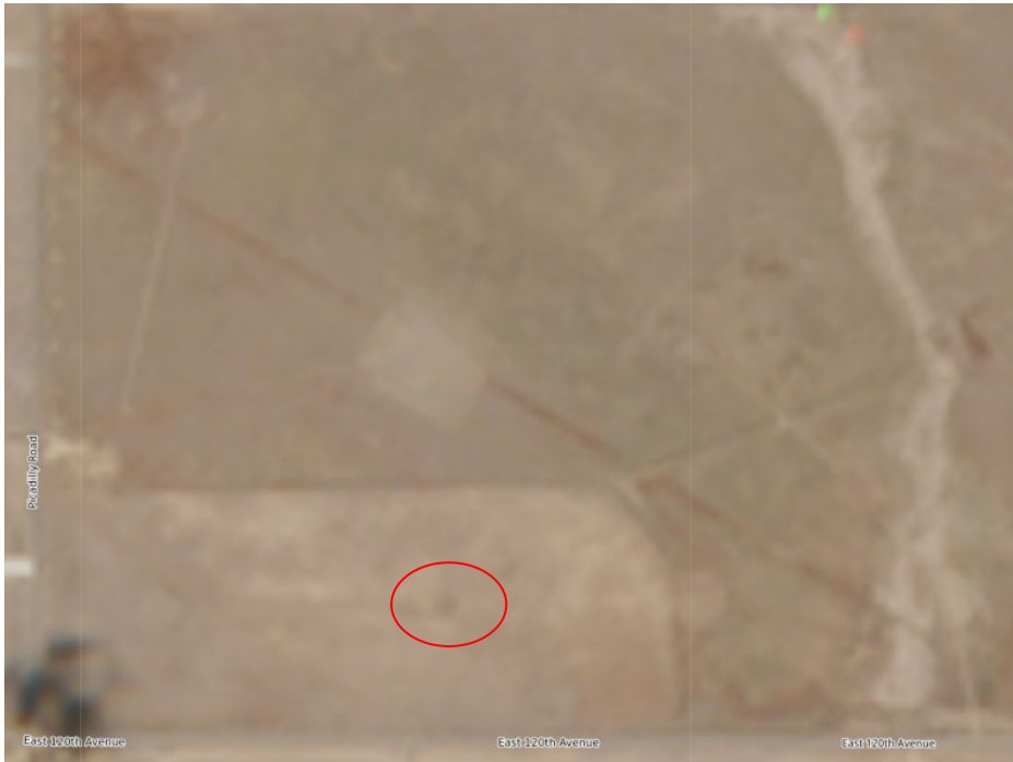
Photo 7. Aerial photo taken Apr 2, 2024. Before reclamation activity (red circle).