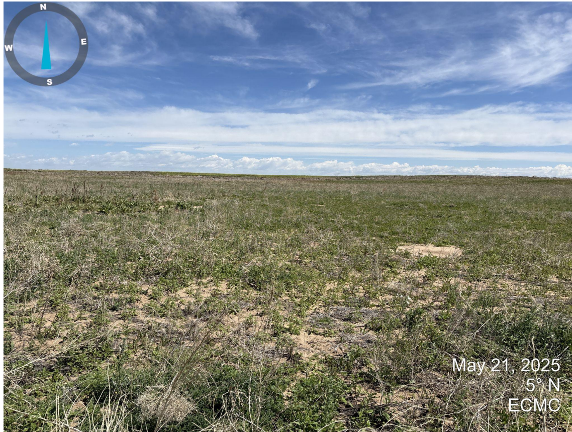
Photo 9. Reference vegetation to the north of the location.