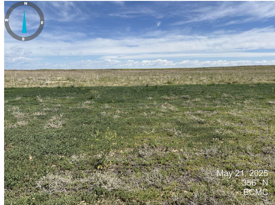
Photo 4. Looking north from the wellbore. See photo 3 comments.