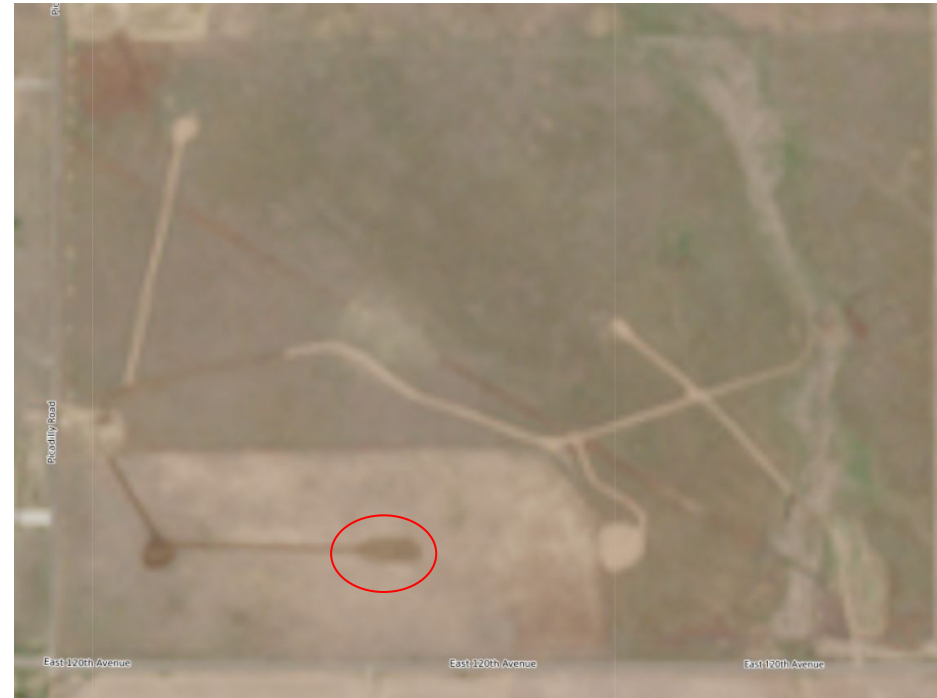
Photo 8. Aerial photo taken Apr 30, 2024. Appears that reclamation was conducted on this location (red circle) and several others in the area.