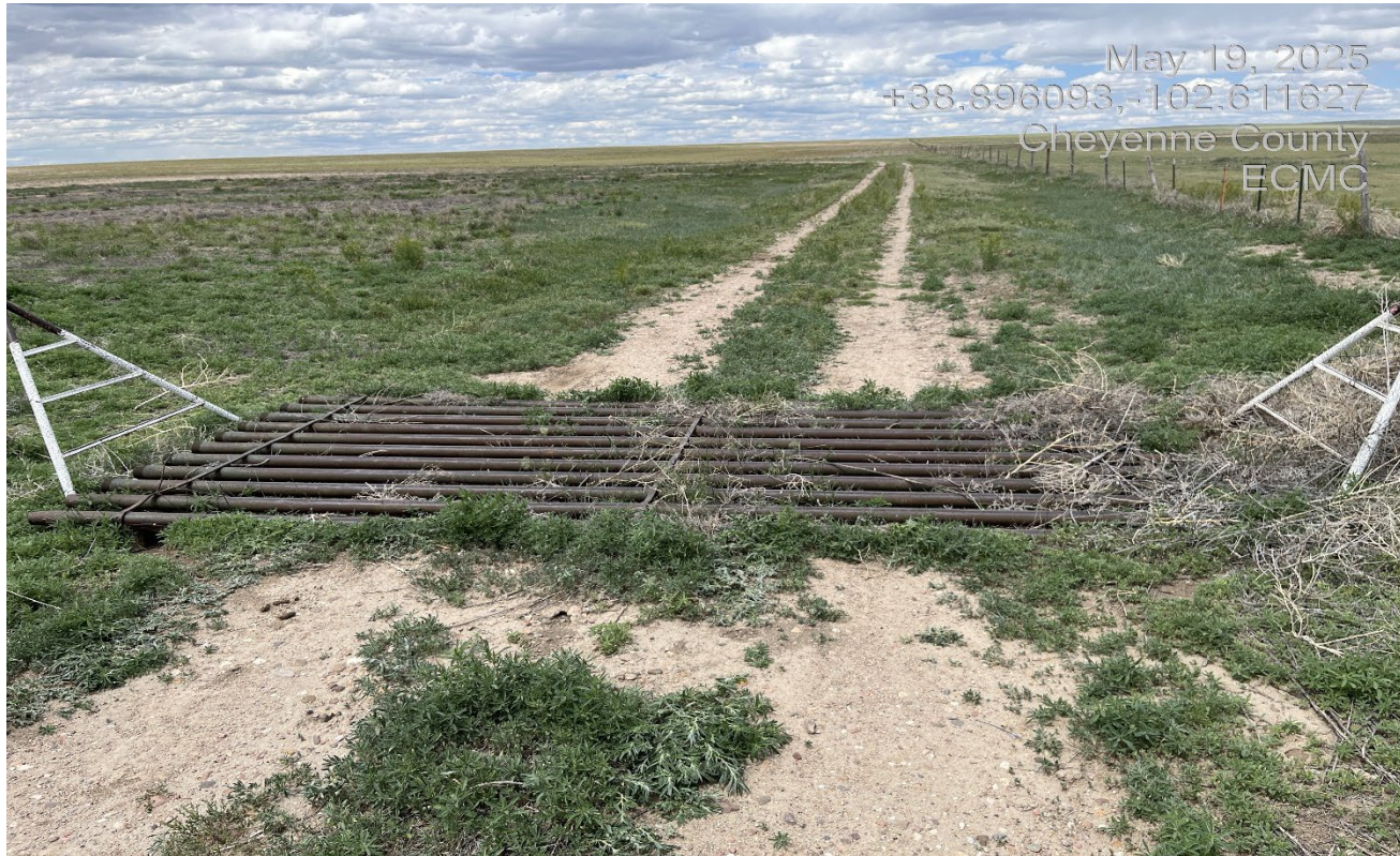
Photo 1. Facing north at beginning of the access road. The cattleguard has not been removed and two track road remains.