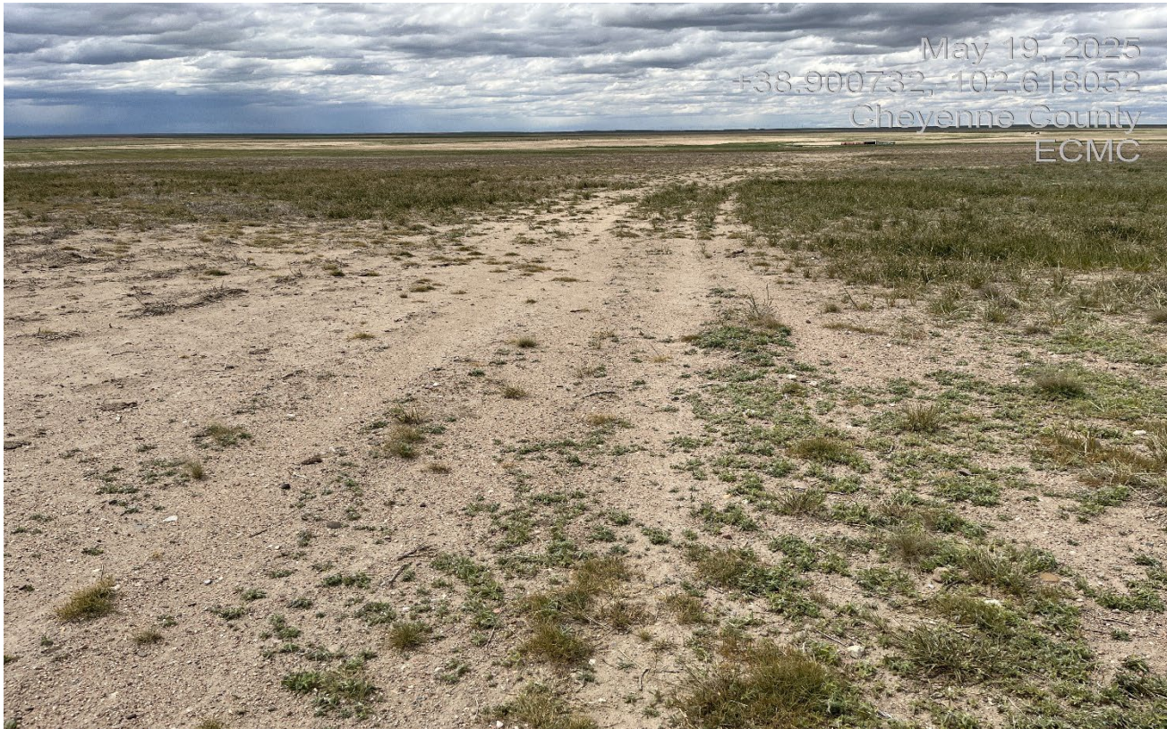
Photo 5. Facing northwest toward the wellsite.