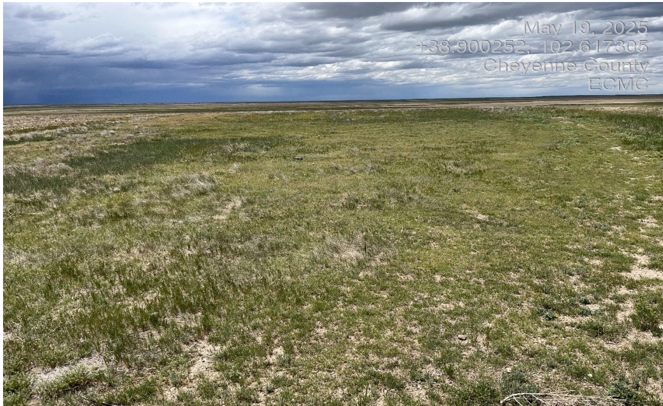
Photo 3. Facing northwest toward the associated tank battery location.