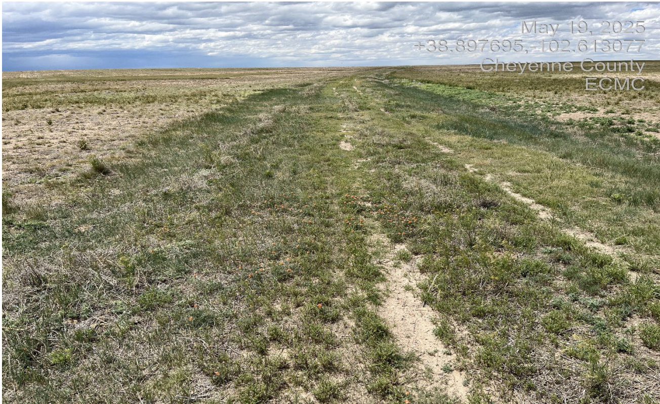
Photo 2. Facing northwest along the access road which remains elevated and crowned. The road must be regraded and contoured.