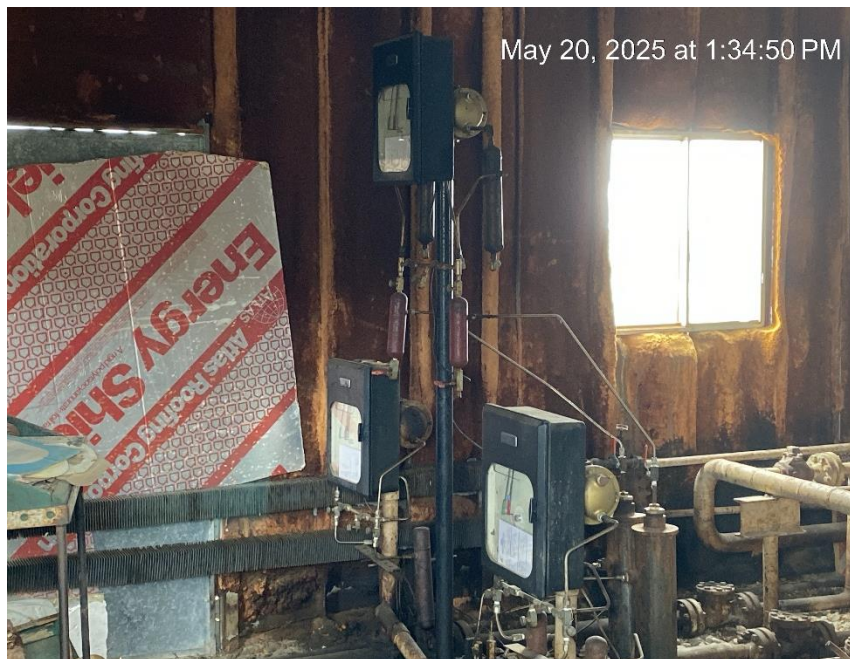
3 meter runs for 1 well?