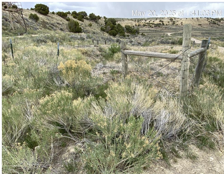
BHP Petroleum pit ID