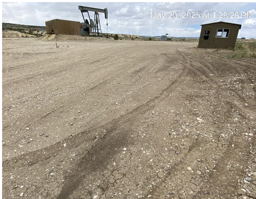
Well location from South entrance