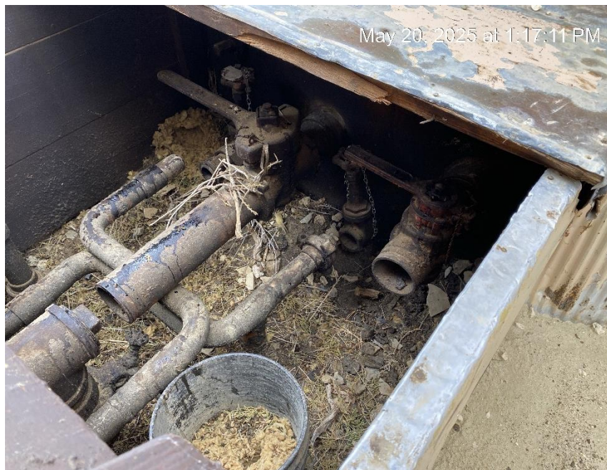
Open end tank valves