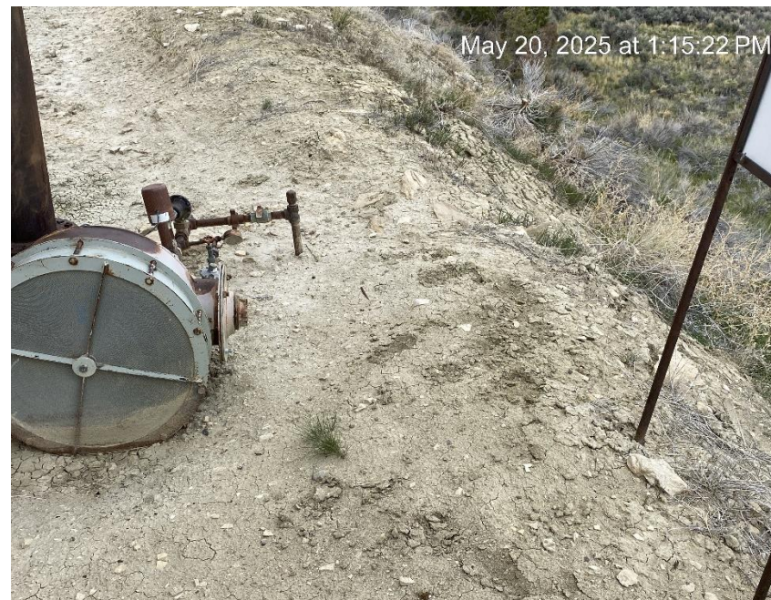
Inadequate tank berm