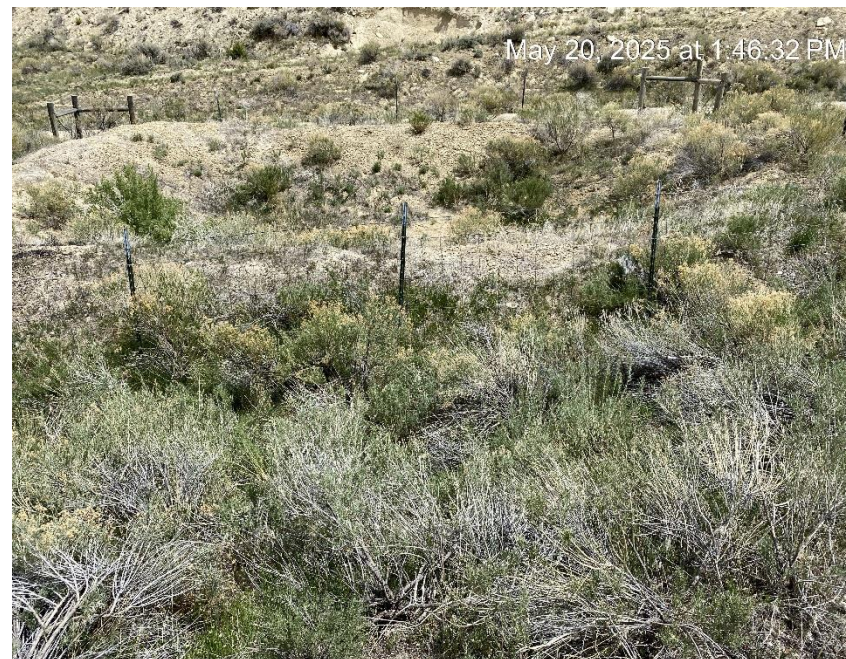
BHP Petroleum pit ID