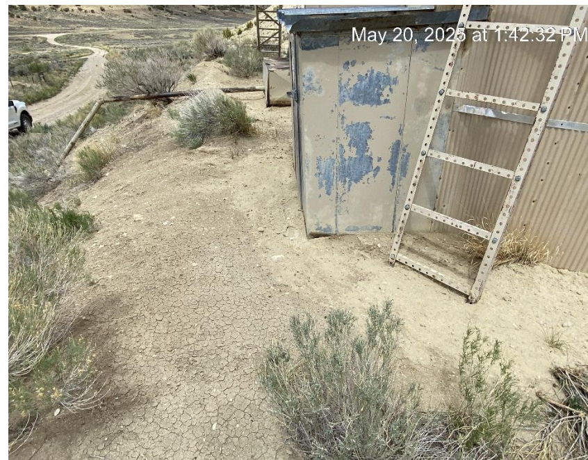
Inadequate tank berm