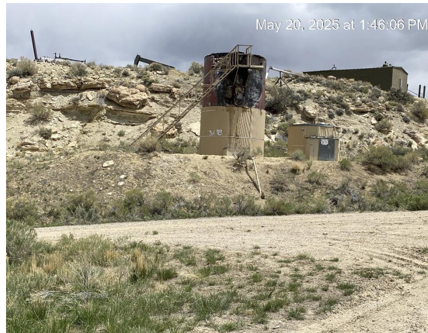
2 nd tank battery from main tank battery