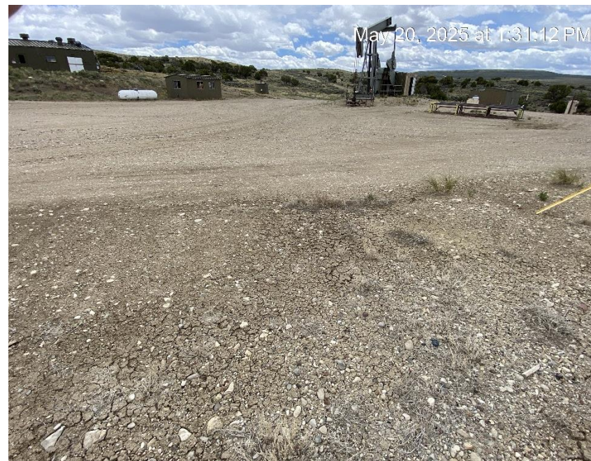
Well location from North corner