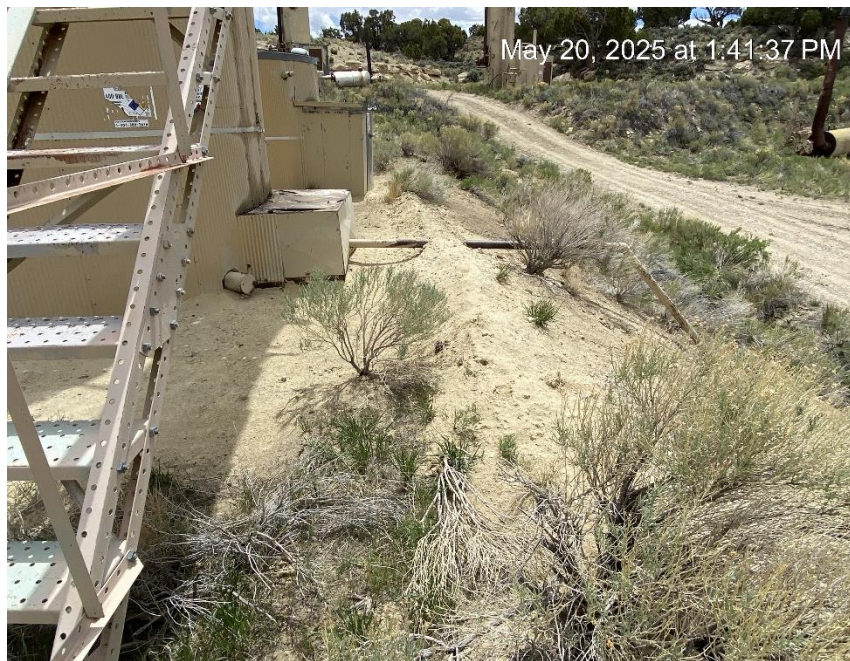
Inadequate tank berm