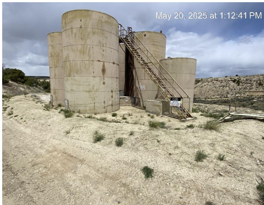
Main tank battery