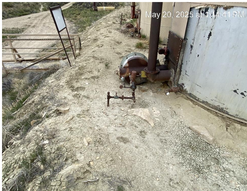
Inadequate tank berm