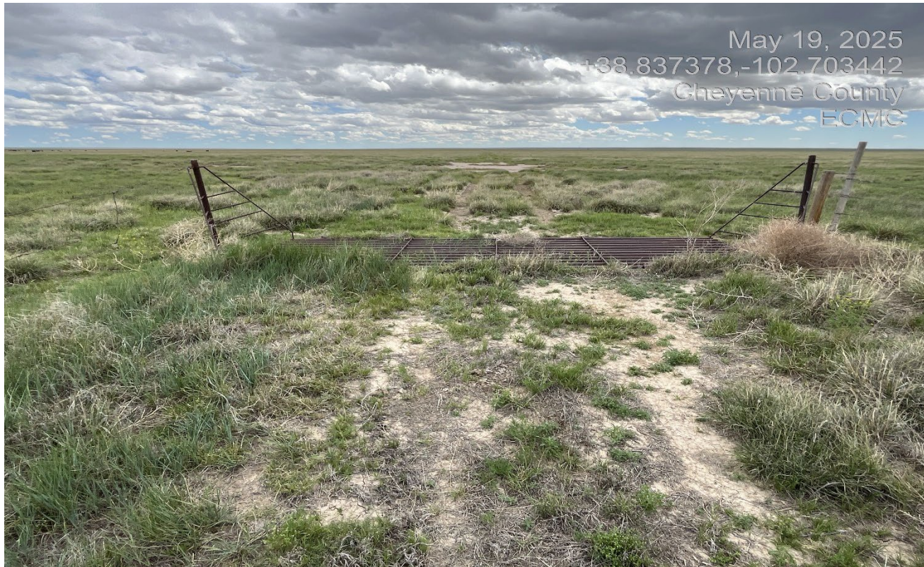
Photo 1. Facing east at the beginning of the access road. The cattleguard remains and the fence has not been repositioned back in line with original fenceline..