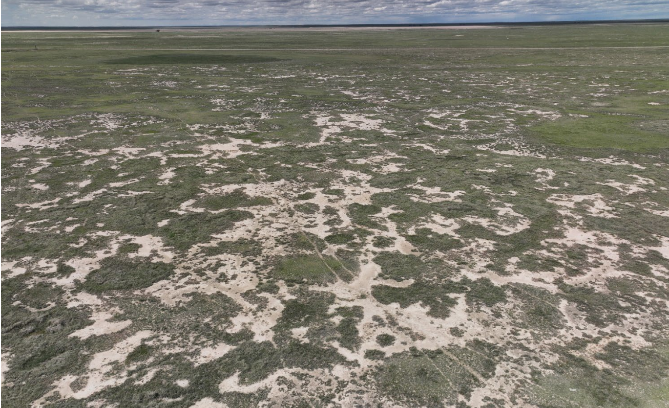
Photo 4. Facing west at the surrounding area which has interspersed bare areas along with areas of native vegetation.