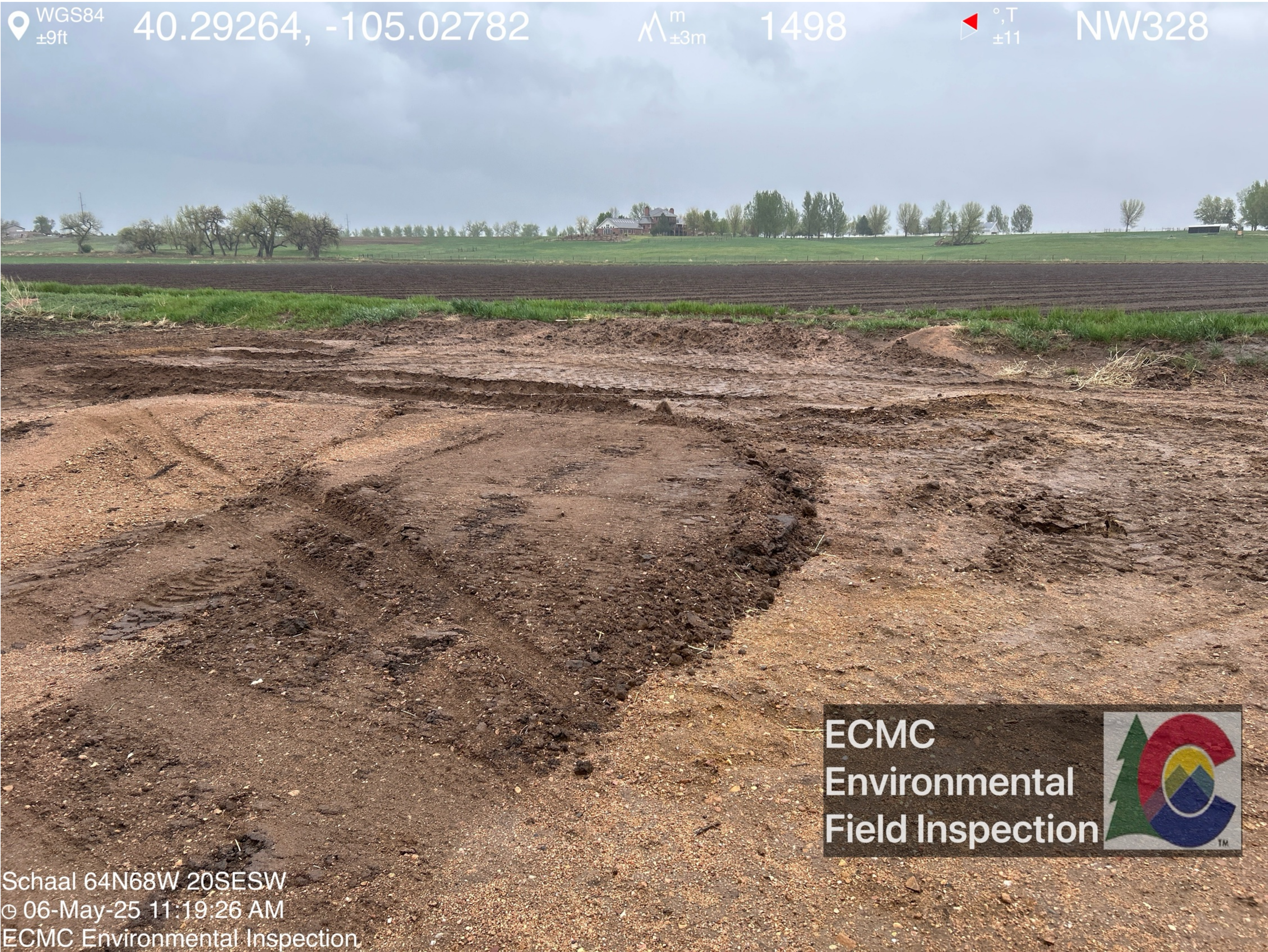
Approximate location of former separators and emission control devices.