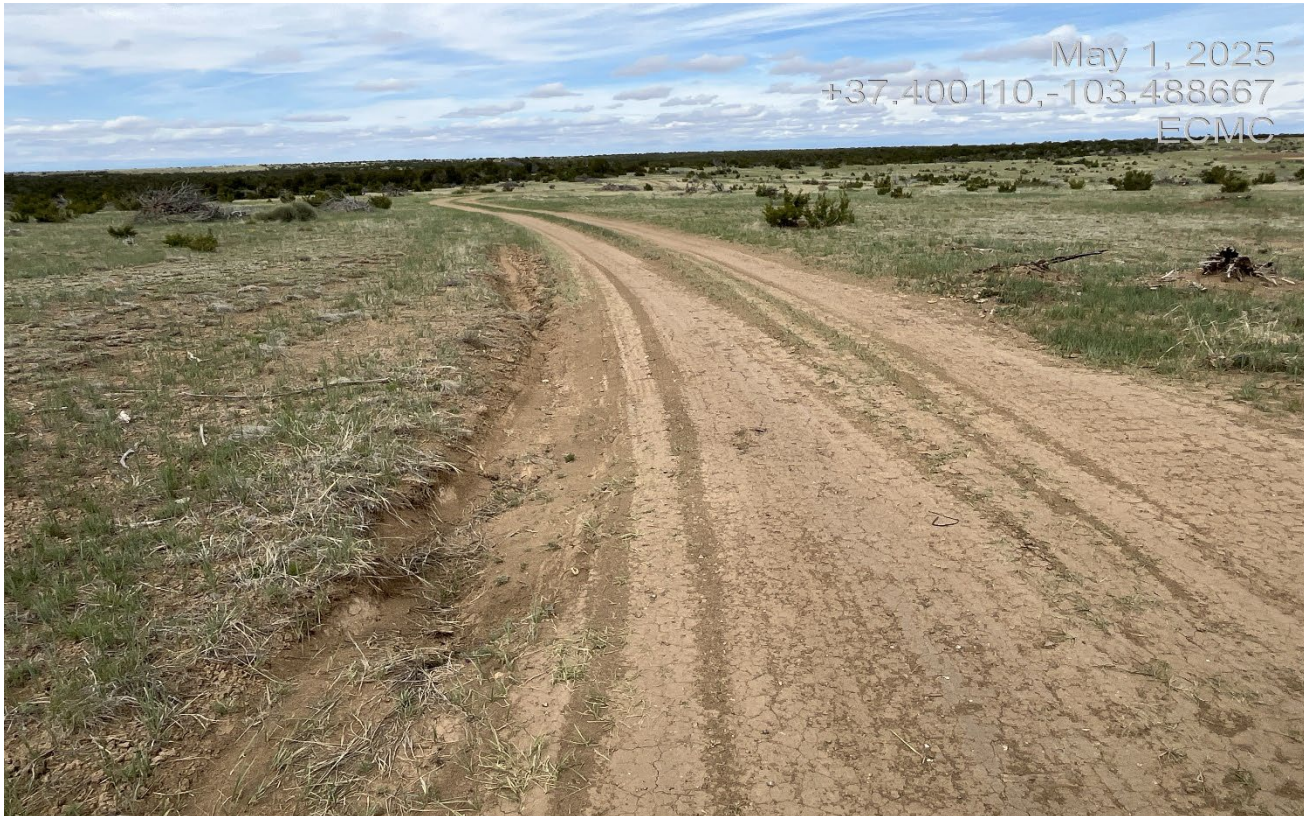
Photo 2. Facing northwest along the pre-existing access road. The road will need to be maintained per 1002.f. rules.