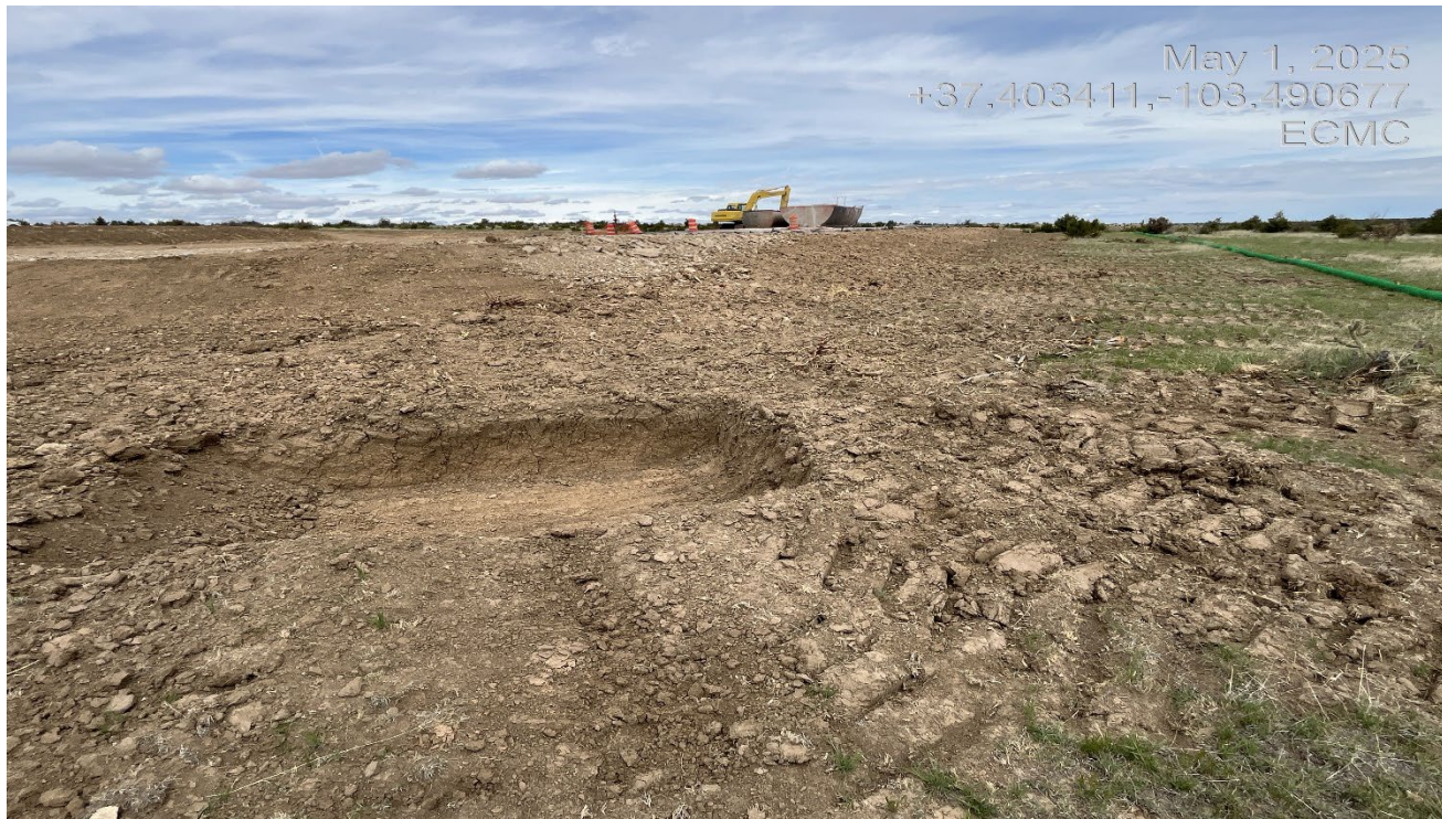
Photo 8. The sediment trap was dug out in this area has no diversion to direct flow to the sediment trap and does not have proper inlet/outlet.