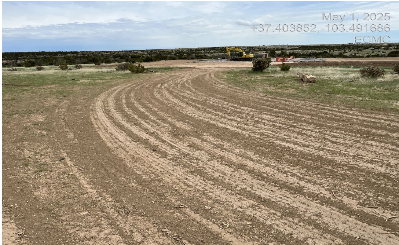
Photo 3. Facing east toward the access road and location. Topsoil was not salvaged along the road to the location approximately 100 yards. Soils are heavily compacted in this area..