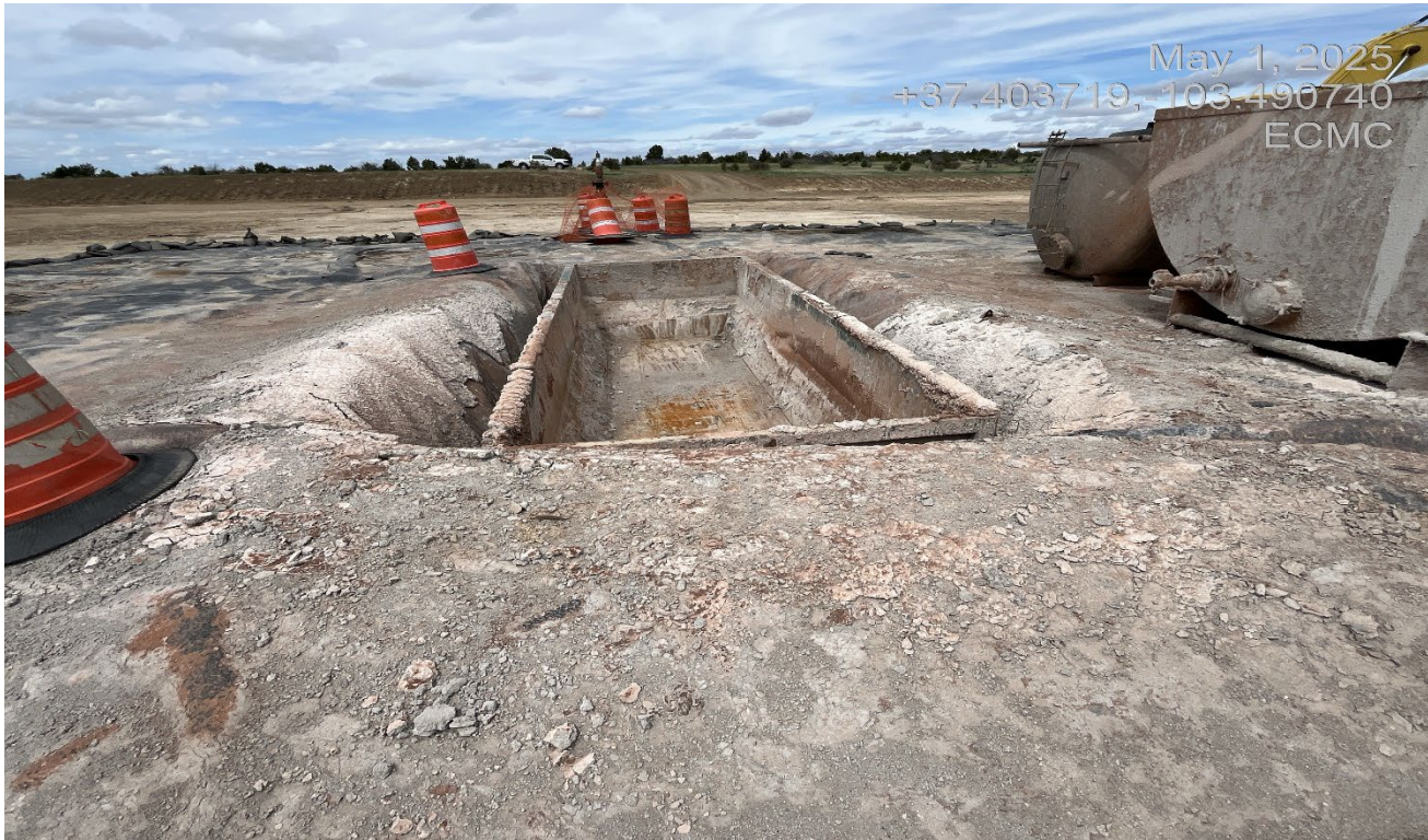
Photo 5. Facing toward the cuttings trench. The cutting material has been placed into the open top tanks at the right side of photo.