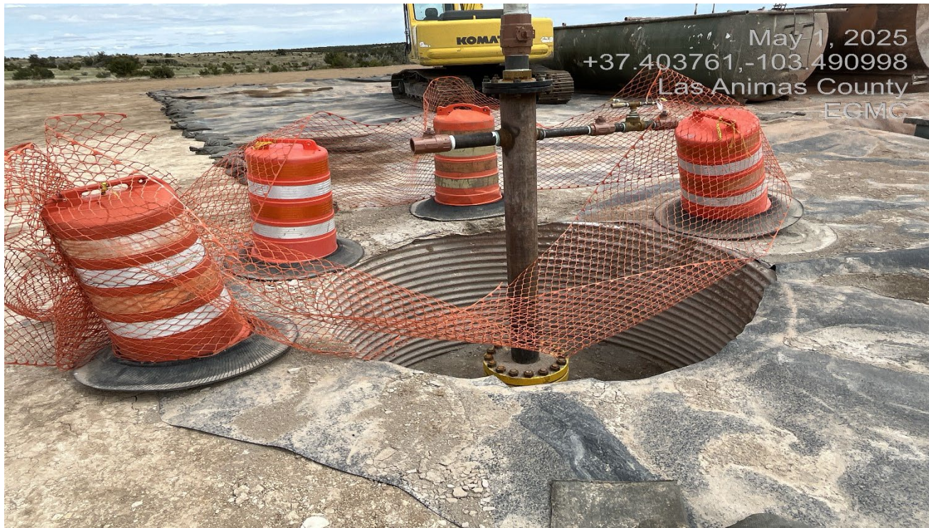
Photo 4. The well cellar does not have adequate fence installed to prevent livestock or wildlife entry.