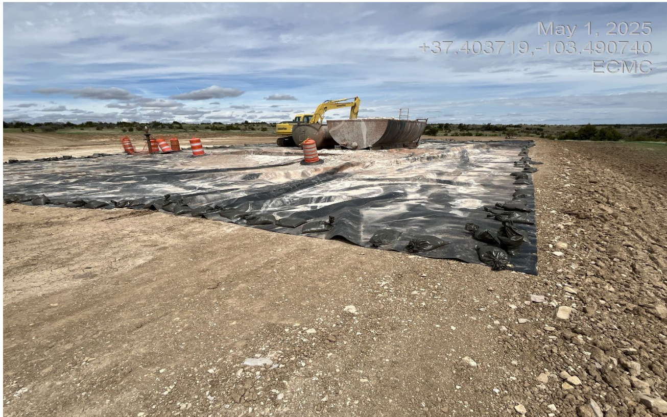
Photo 6. Facing northwest along the east side of the location. The liner with the drill cuttings material has no containment to prevent stormwater from washing the material off the liner.