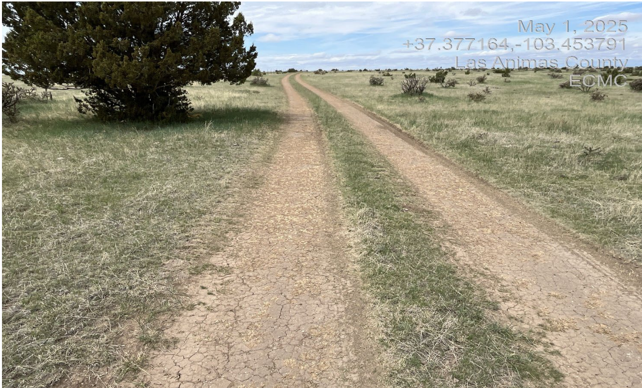
Photo 1. Facing east along the access road. The road will need to be maintained per 1002.f. rules.