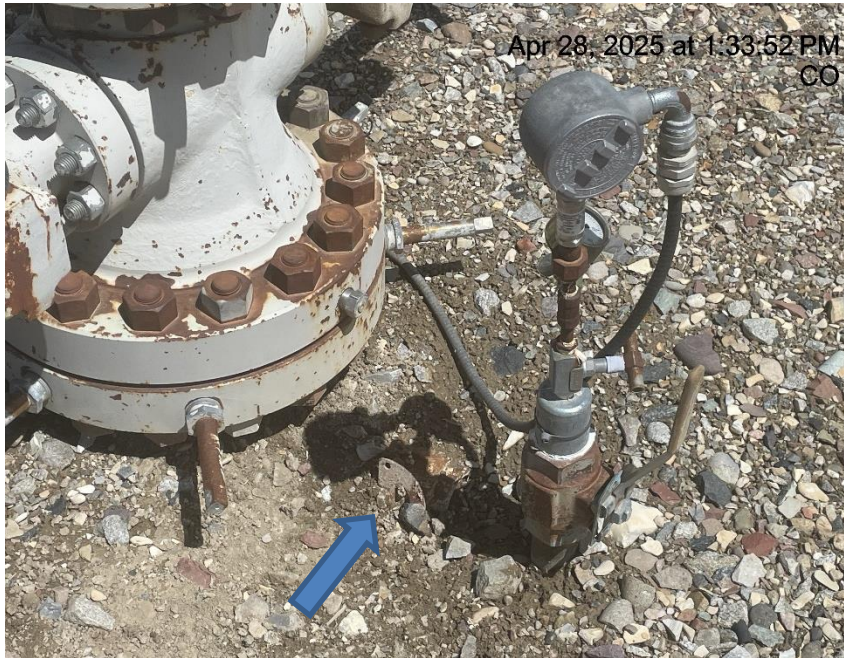
Photo # 6465 Partially buried valve on the JUNIPER 2-16 (M1E) well (possibly SC BH valve or IC BH valve)