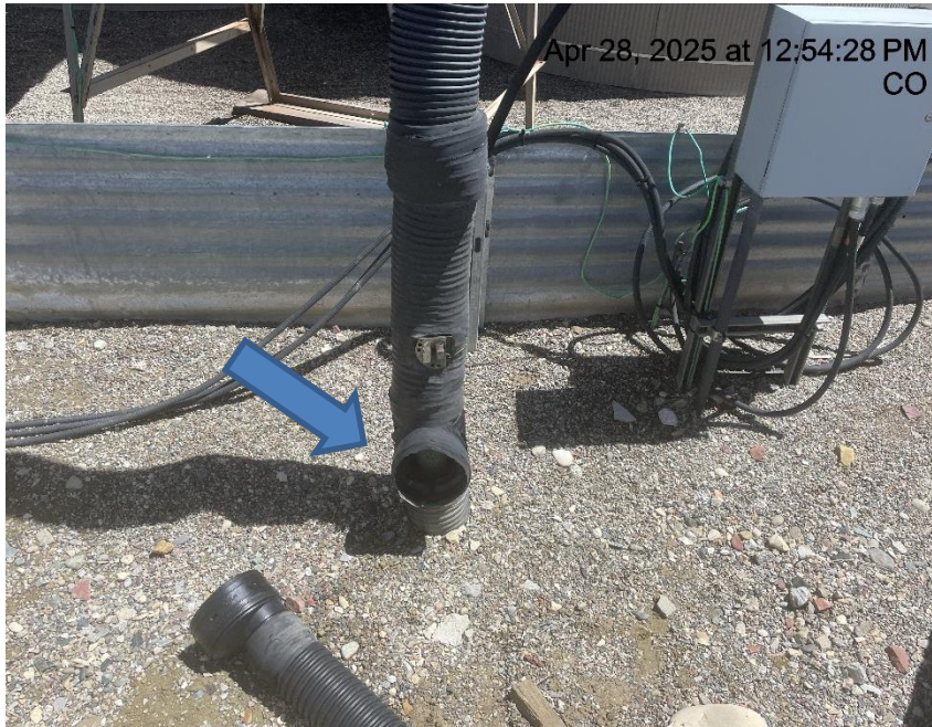
Photo # 6455 Flowline heating insulation open ended /wildlife hazard/available for entry by wildlife