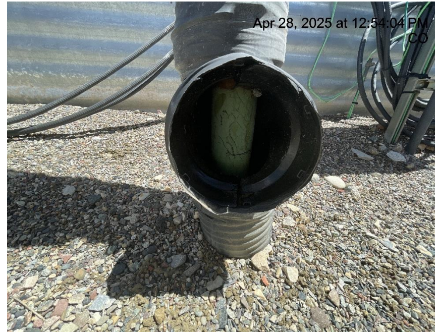
Photo # 6456 Flowline heating insulation open ended /wildlife hazard/available for entry by wildlife