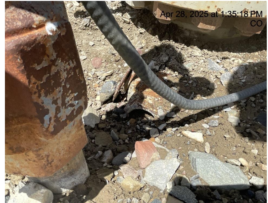
Photo # 6466 Partially buried valve on the JUNIPER 2-16 (M1E) well (possibly SC BH valve or IC BH valve)