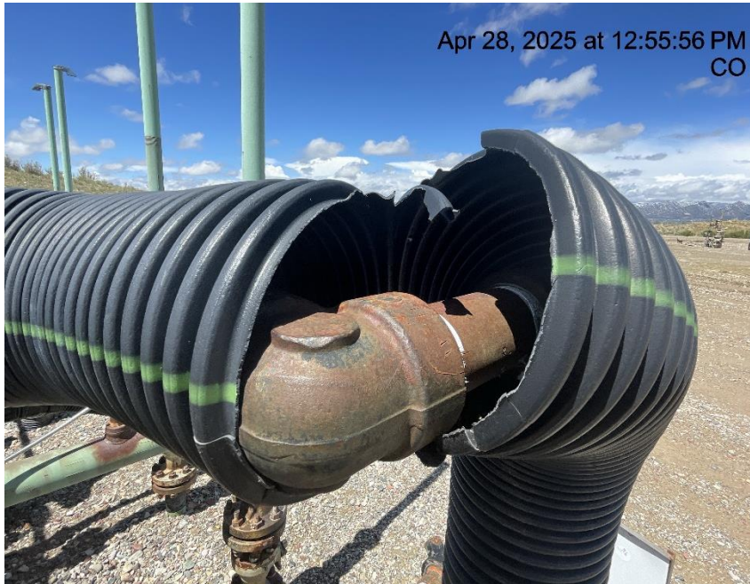
Photo # 6457 Flowline heating insulation damaged/wildlife hazard/available for entry by wildlife