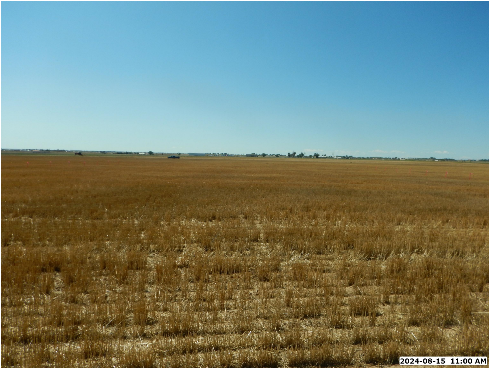
LOCATION PICTURE OF MESQUITE HZ WELL PAD - CAMERA VIEW SOUTH