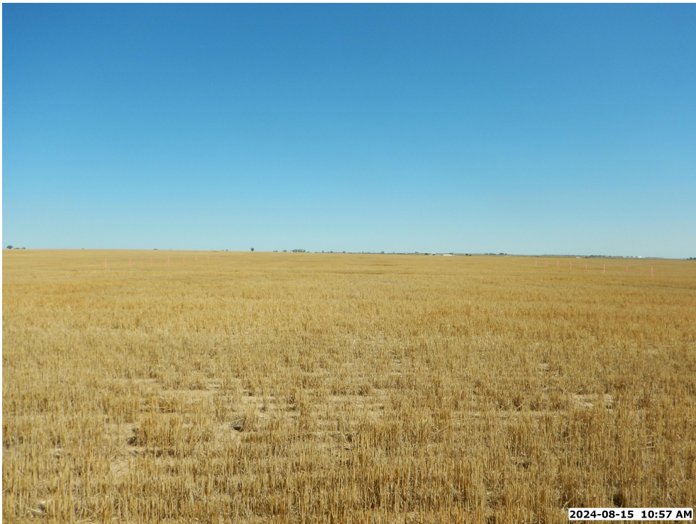
LOCATION PICTURE OF MESQUITE HZ WELL PAD - CAMERA VIEW NORTH

SW1/4 NW1/4 SECTION 31, TOWNSHIP 2 NORTH, RANGE 63 WEST, 6TH P.M., WELD COUNTY, COLORADO