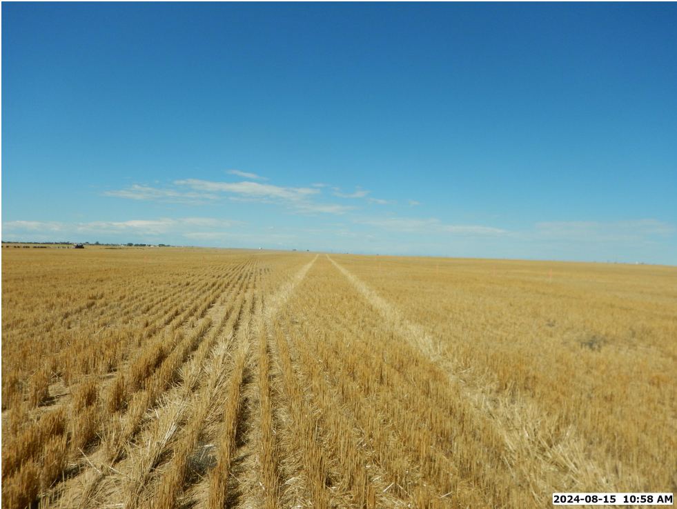
LOCATION PICTURE OF MESQUITE HZ WELL PAD - CAMERA VIEW WEST

K:\ANADARKO\2023\2023_50_MESQUITE_T2N_R63W_SEC_31DWGMESQUITE_T2N_R63W_SEC_31.dwg, 9/3/2024 9:44:48 AM, Phase