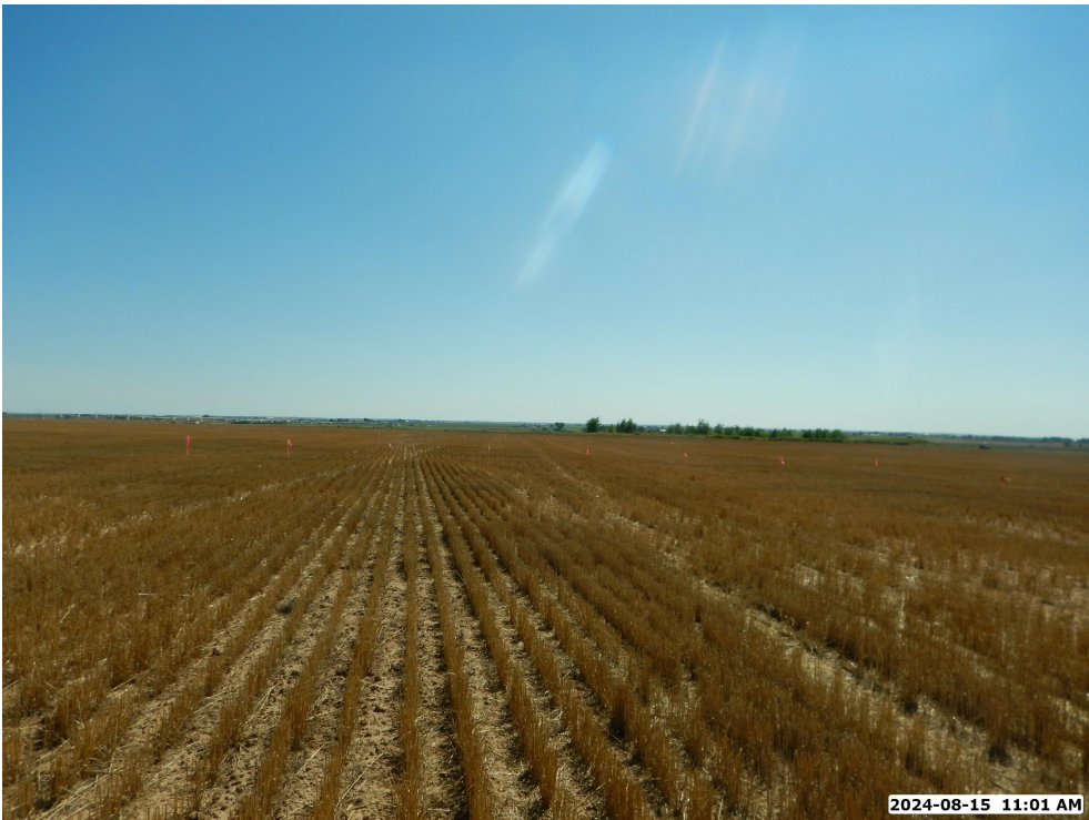
LOCATION PICTURE OF MESQUITE HZ WELL PAD - CAMERA VIEW EAST