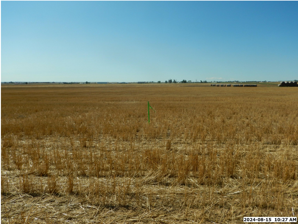
LOCATION PICTURE OF MESQUITE HZ FACILITY PAD - CAMERA VIEW SOUTH