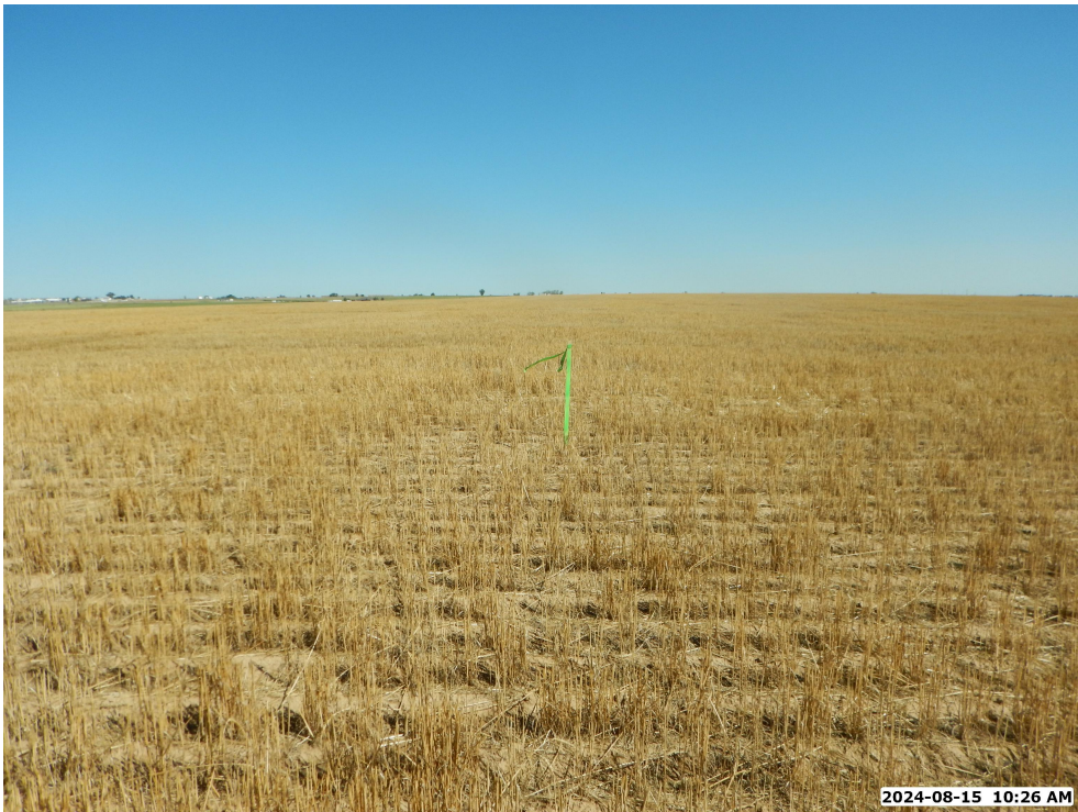
LOCATION PICTURE OF MESQUITE HZ FACILITY PAD - CAMERA VIEW NORTH

SW1/4 NW1/4 SECTION 31, TOWNSHIP 2 NORTH, RANGE 63 WEST, 6TH P.M., WELD COUNTY, COLORADO