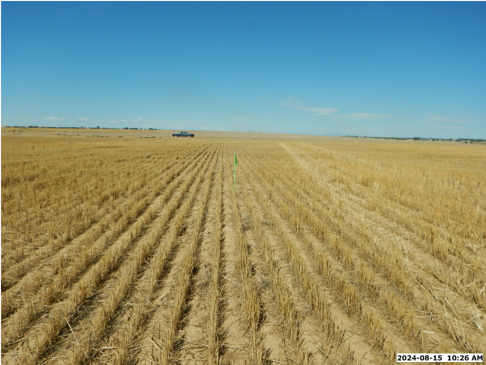
LOCATION PICTURE OF MESQUITE HZ FACILITY PAD - CAMERA VIEW WEST

K:\ANADARKO\2023\2023_50_MESQUITE_T2N_R63W_SEC_31DWG\MESQUITE_T2N_R63W_SEC_31.dwg, 9/3/2024 9:43:32 AM, Phase