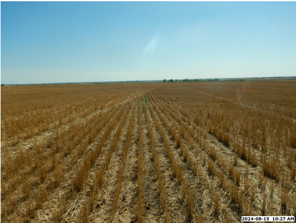
LOCATION PICTURE OF MESQUITE HZ FACILITY PAD - CAMERA VIEW EAST