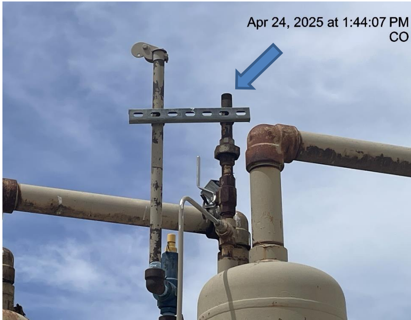
Photo # 5670 Rupture disc vent line does not comply with CECMC pressure safety device rules