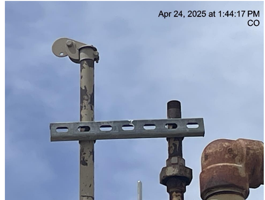
Photo # 5671 Rupture disc vent line does not comply with CECMC pressure safety device rules