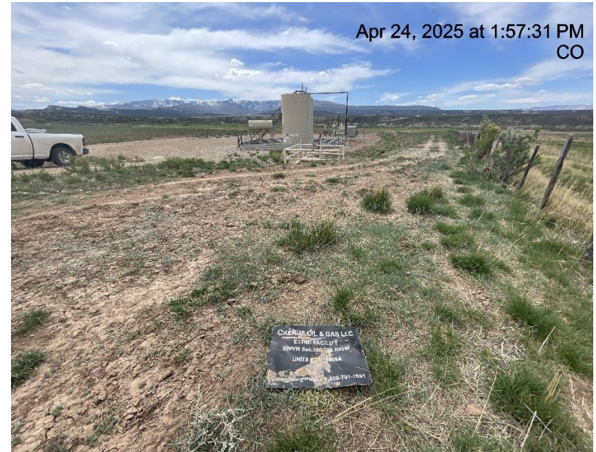
Photo # 5687 Entrance to location sign laying on the ground /not properly posted