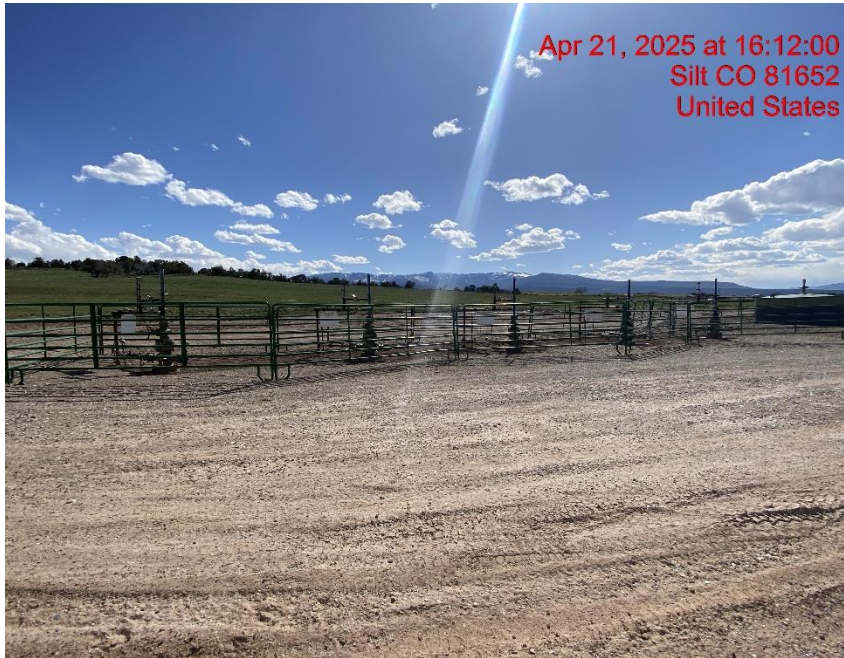
Location – Photo #08273