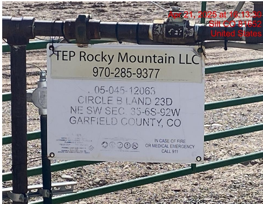
Illegible Wellhead Sign – Photo #08276