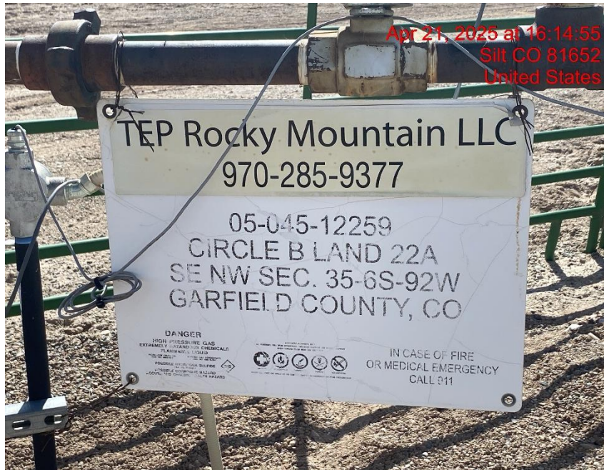
Faded Wellhead Sign – Photo #08280