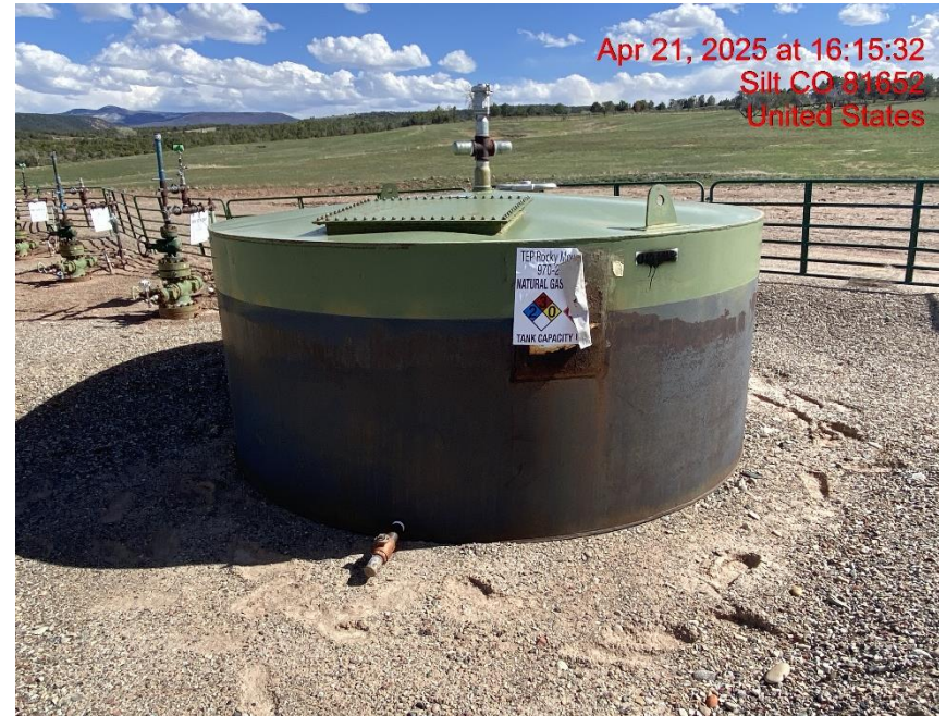
Unused Equipment – Photo #08283