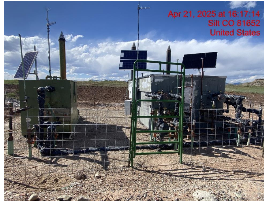
Location – Photo #08284