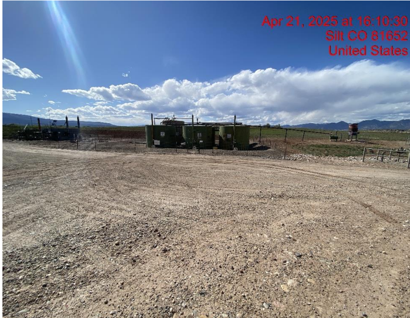
Location Overview – Photo #08271