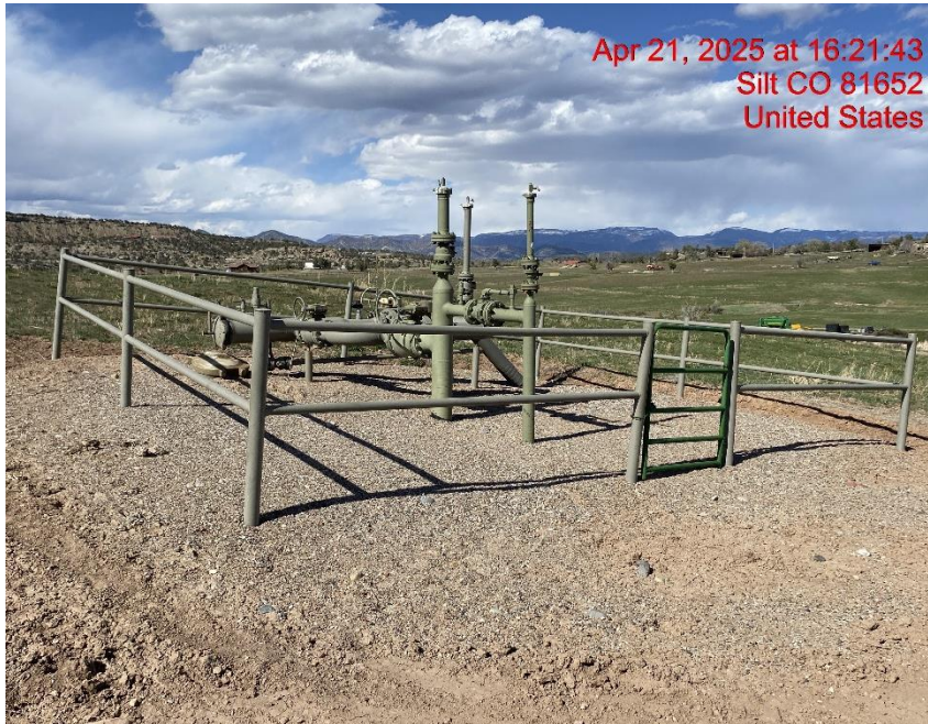
Location – Photo #08294