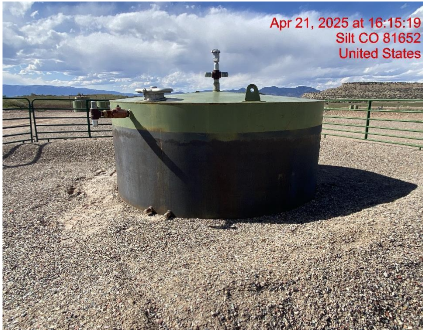
Unused Equipment – Photo #08282