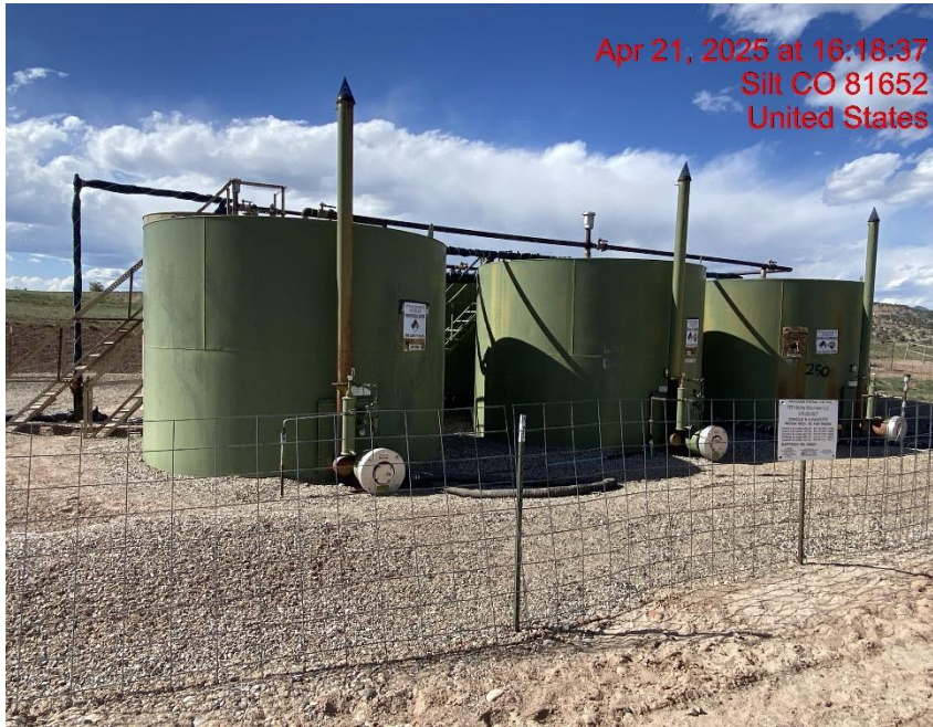
Location – Photo #08287