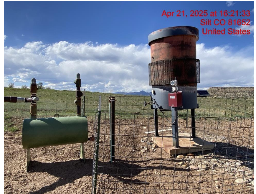
Location – Photo #08293