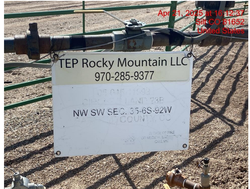
Illegible Wellhead Sign – Photo #08274