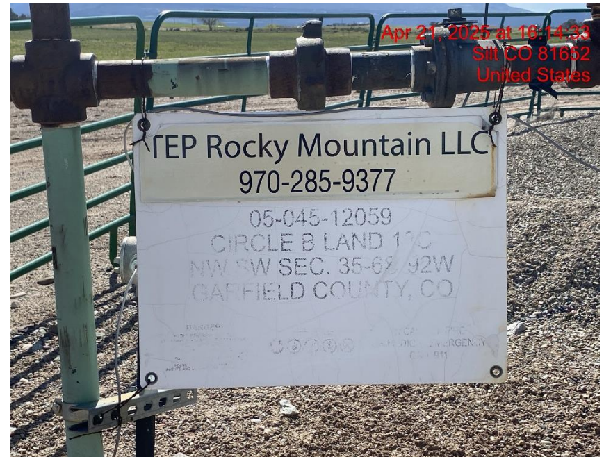
Illegible Wellhead Sign – Photo #08278