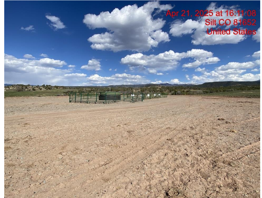
Location Overview – Photo #08272