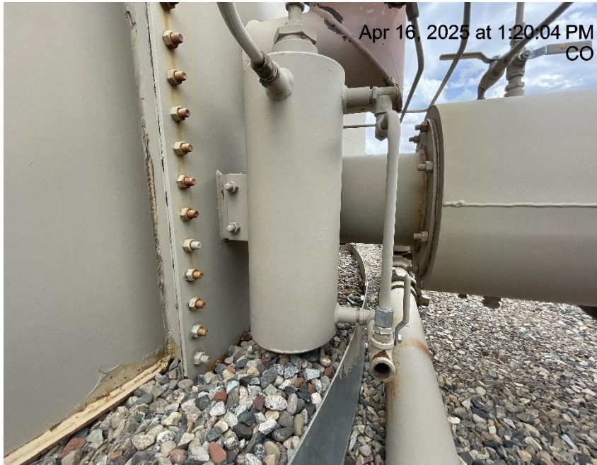
Photo # 1975 PRV vent line does not comply with CECMC pressure safety rules or general safety rules