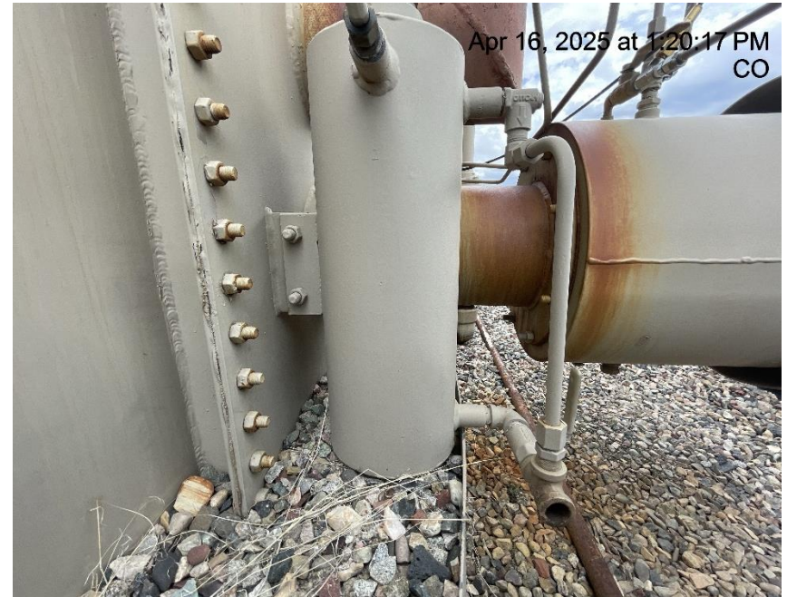
Photo # 1974 PRV vent line does not comply with CECMC pressure safety rules or general safety rules