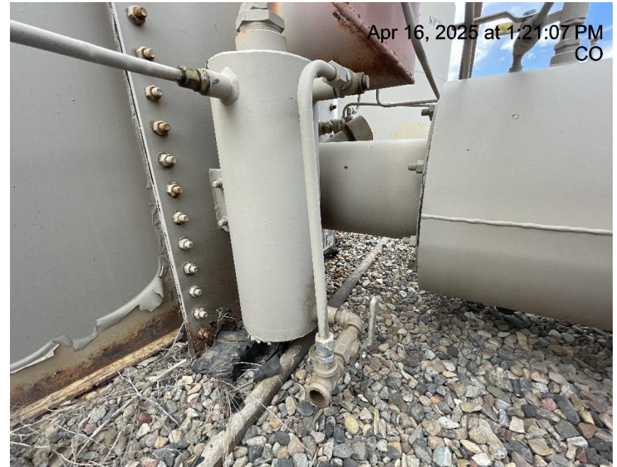
Photo # 1972 PRV vent line does not comply with CECMC pressure safety rules or general safety rules