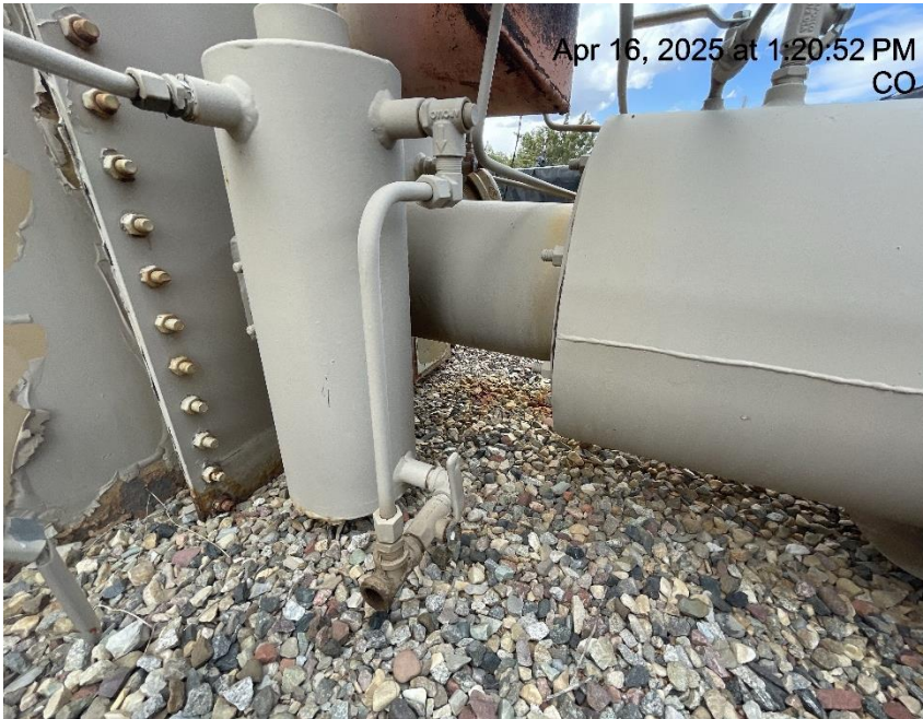
Photo # 1973 PRV vent line does not comply with CECMC pressure safety rules or general safety rules