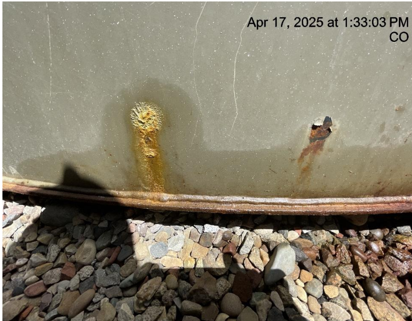
Photo # 2494 Possible tank failure - Suspected leaks on production tank/tank appears to lack integrity