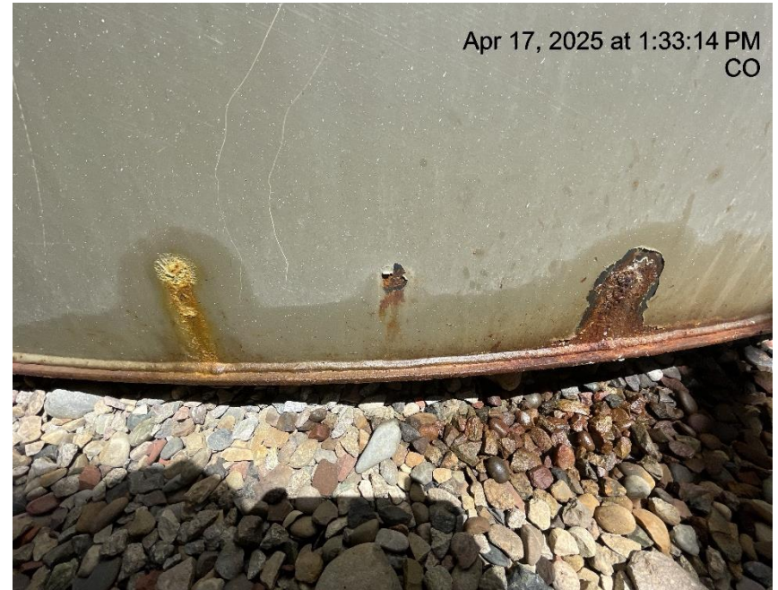
Photo # 2491 Possible tank failure - Suspected leaks on production tank/tank appears to lack integrity