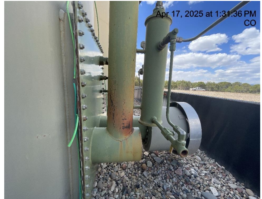
Photo # 2495 PRV vent line does not comply with CECMC pressure safety device rules or general safety rules