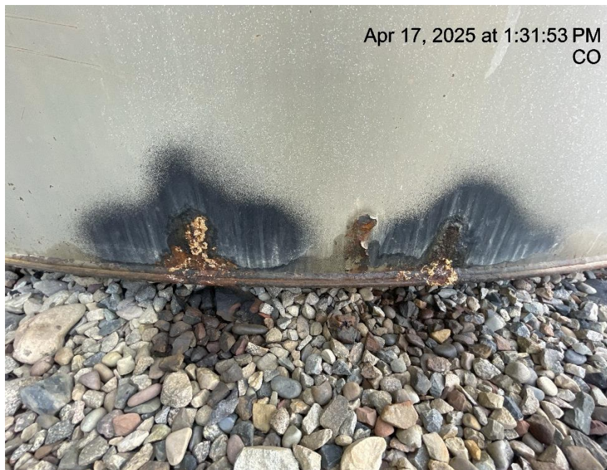
Photo # 2488 Possible tank failure - Suspected leaks on production tank/tank appears to lack integrity