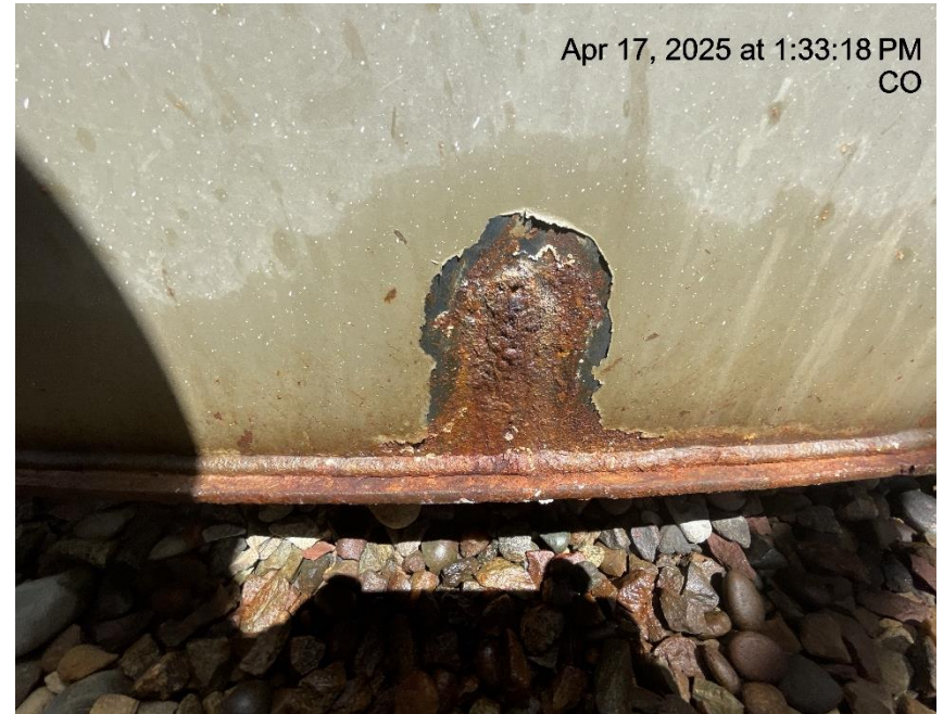
Photo # 2493 Possible tank failure - Suspected leak on production tank/tank appears to lack integrity