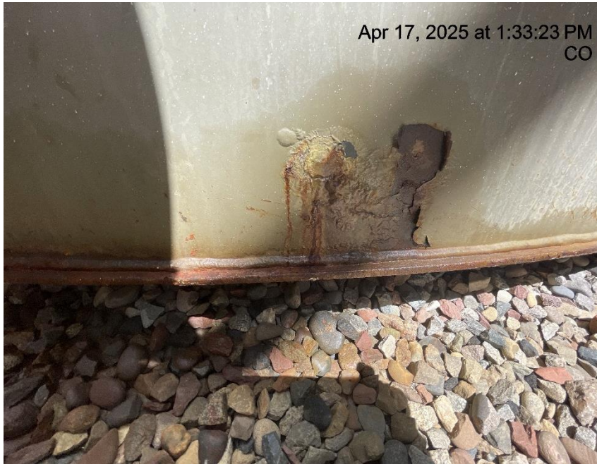
Photo # 2492 Possible tank failure - Suspected leak on production tank/tank appears to lack integrity