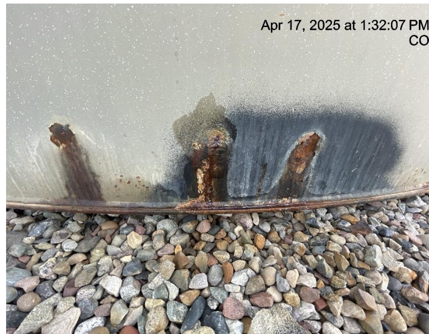
Photo # 2489 Possible tank failure - Suspected leaks on production tank/tank appears to lack integrity