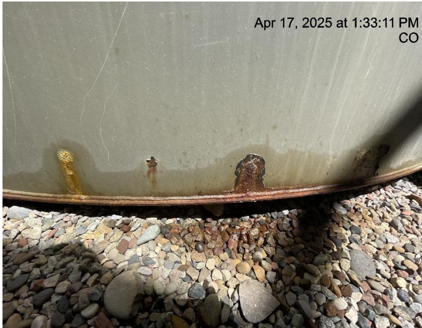
Photo # 2490 Possible tank failure - Suspected leaks on production tank/tank appears to lack integrity