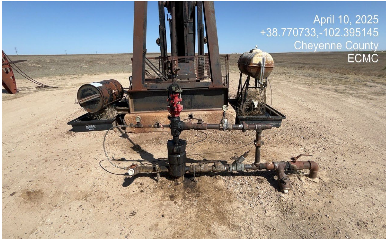
Photo 2. Stained soils at the wellhead need to be cleaned up and properly disposed.