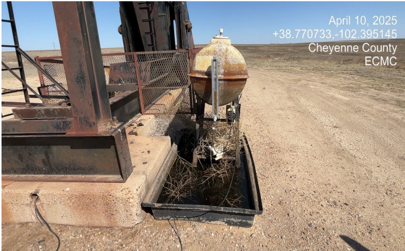
Photo 3. The containment is full of oily fluid and needs to be properly disposed. Secondary containment must have wildlife protections to prevent entry.