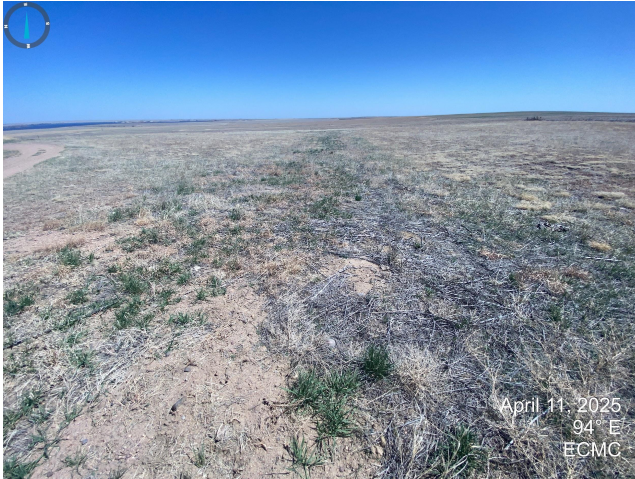
Photo 1. Taken along the access road, facing east towards the former location. Road base was observed throughout the former road, which does not appear reflective of the adjacent reference areas.