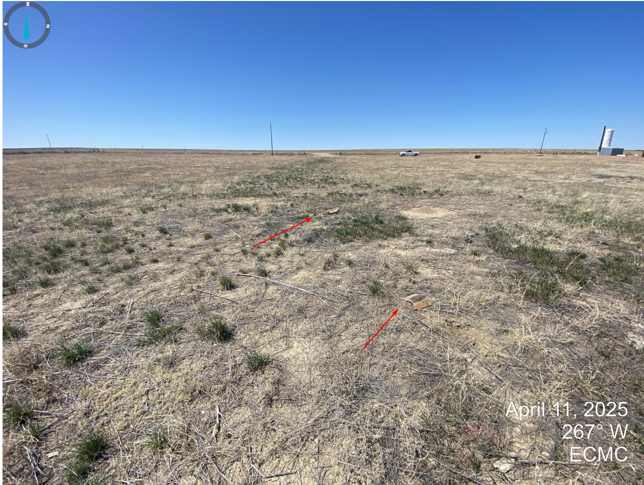
Photo 3. Continued from Photo 2, facing west. Debris observed throughout the former well location.